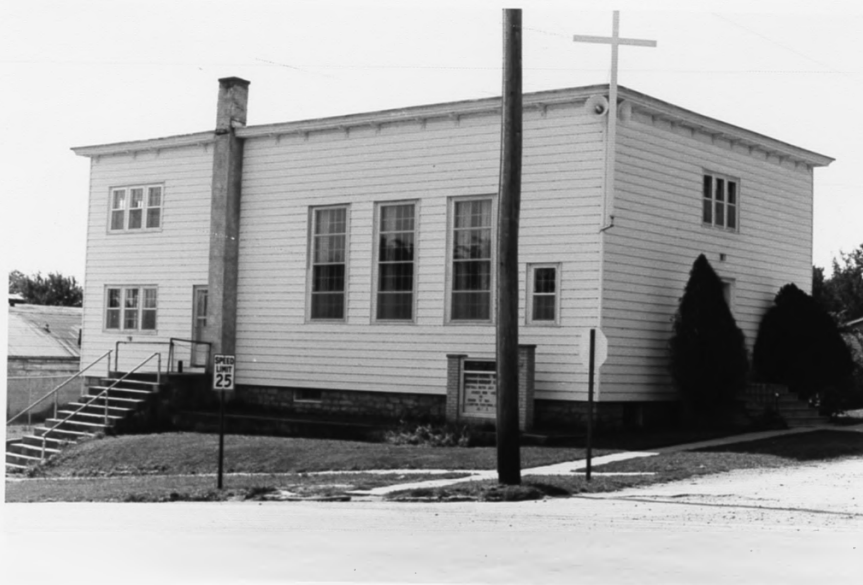
Methodist Church, originally a hotel contemporaneous with territorial capitol