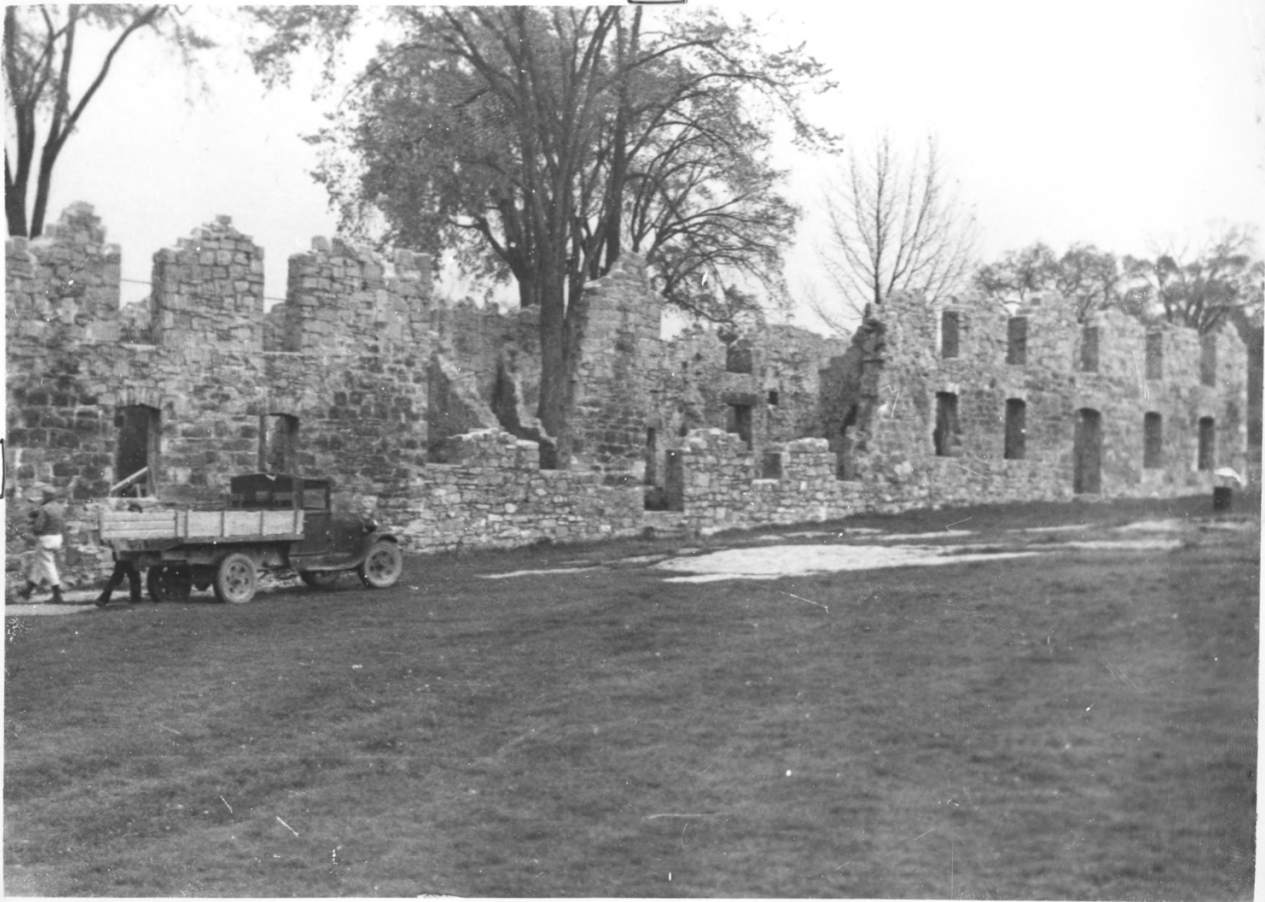
VIEWS OF RUINS OF OLD FORT AMHERST SHOWING EXTENT, PRESENT STATE OF PRESERVATION, AND DETAILS OF BARRACKS