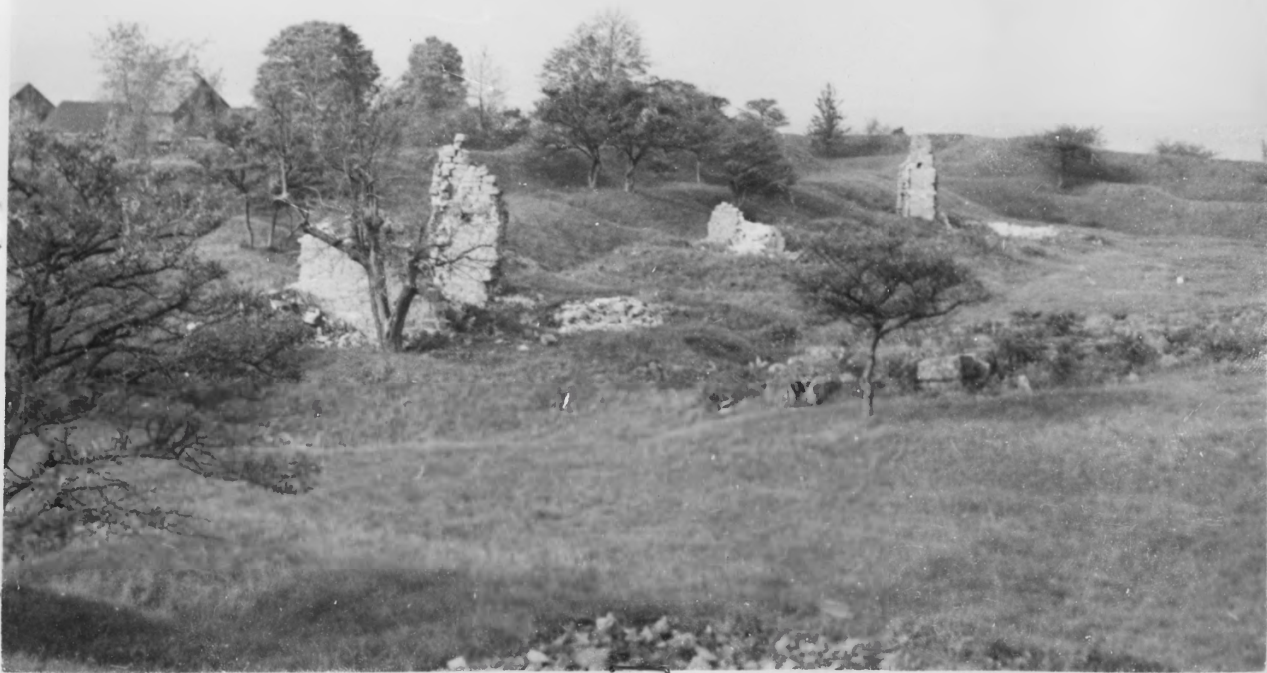
OLD CHIMNEY STACKS, ALL THAT IS LEFT OF THIS SECTION OF BARRACKS