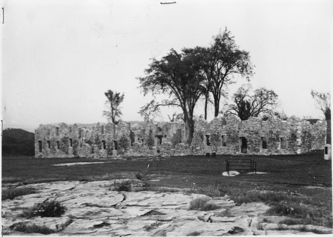
VIEWS OF RUINS OF OLD FORT AMHERST SHOWING EXTENT, PRESENT STATE OF PRESERVATION, AND DETAILS OF BARRACKS