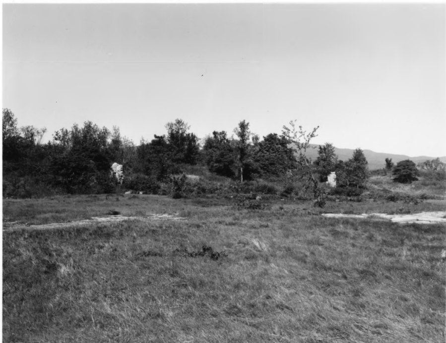
Fort Crown Point (Amherst), 1760 View of the 2 remaining end walls of the S. W. Barracks, Parade Ground, and Walls