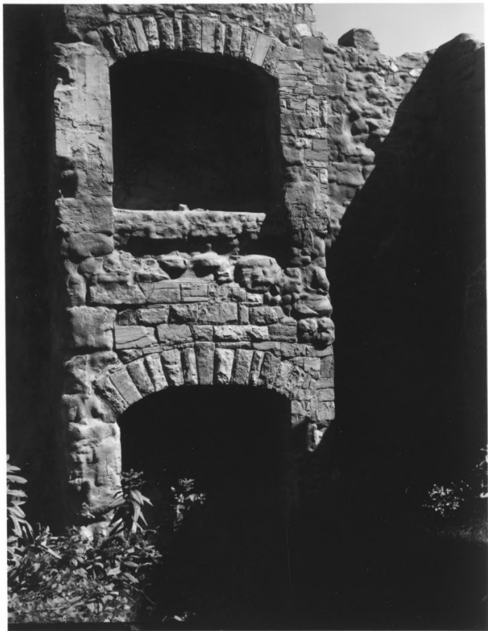
Fort Crown Point (Amherst), 1760 View of Fireplaces inside Room in S.E. Barracks