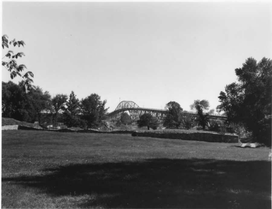
View of the Ruins of Fort St. Frederic, 1731 West Side and South End