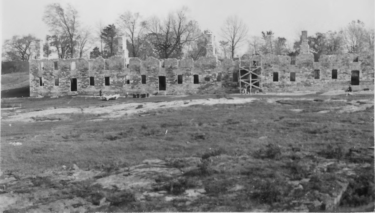
VIEWS OF RUINS OF OLD FORT AMHERST SHOWING EXTENT, PRESENT STATE OF PRESERVATION, AND DETAILS OF BARRACKS