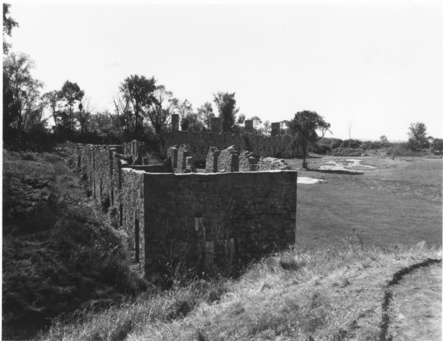
Fort Crown Point (Amherst), 1760 View of 2 standing Barracks (N.E. Barracks left and Southeast Barrack, Center and Right)