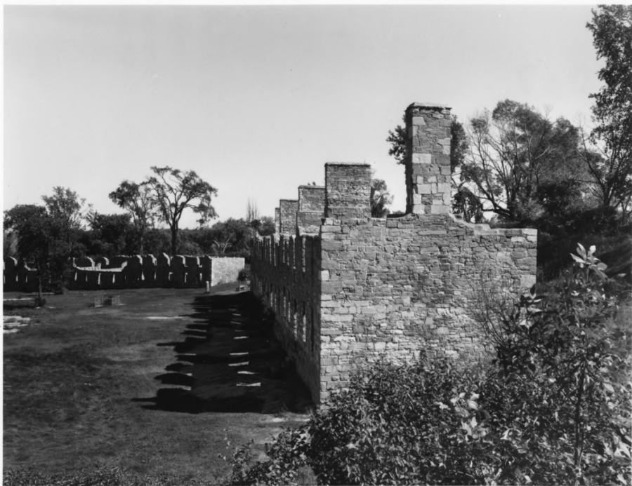
Fort Crown Point (Amherst), 1760 View of S.E. Barracks (Right) and N.E. Barracks (Left), and Parade Ground