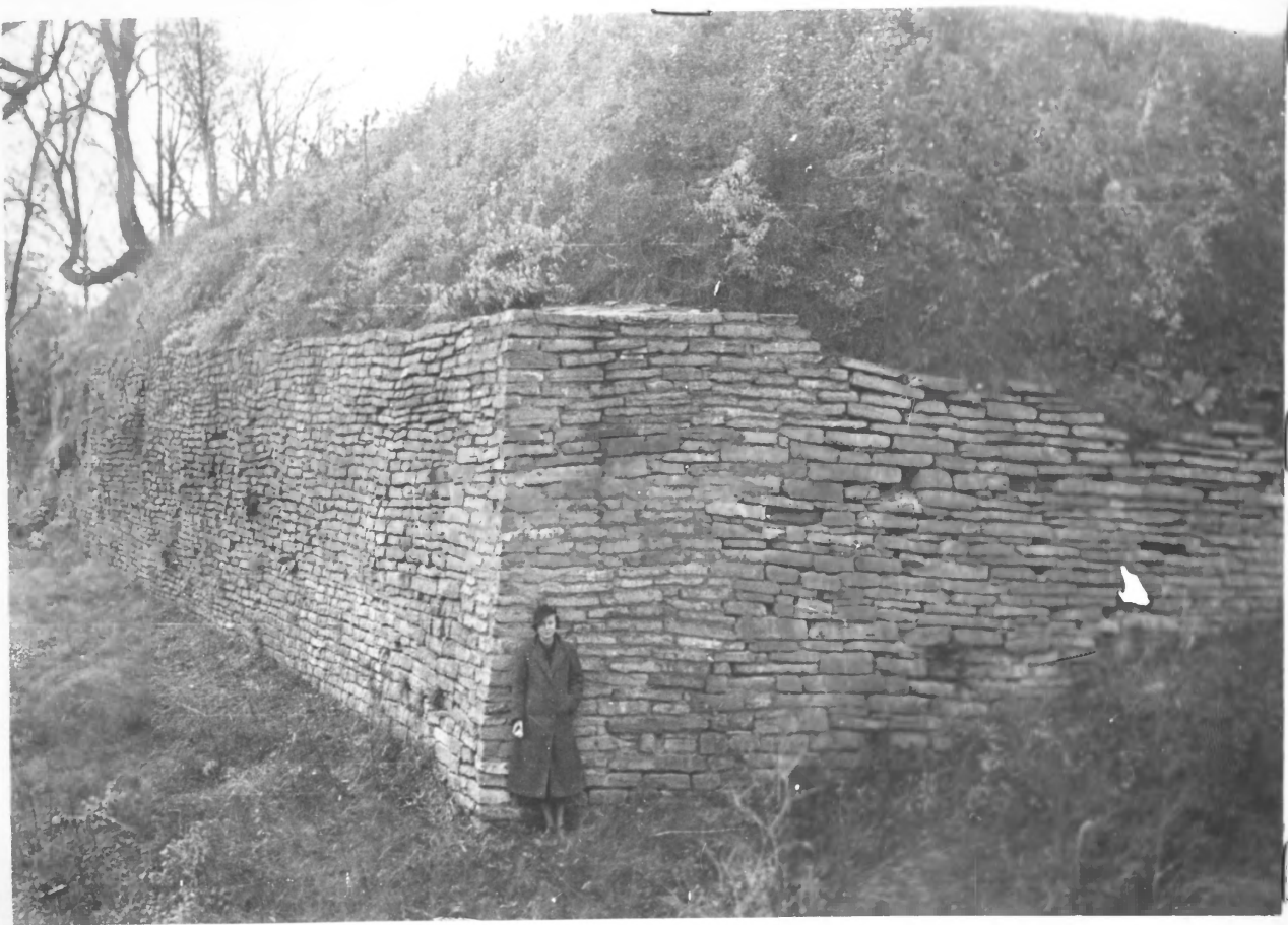
OUTSIDE CORNER OF OLD FORT AMHERST