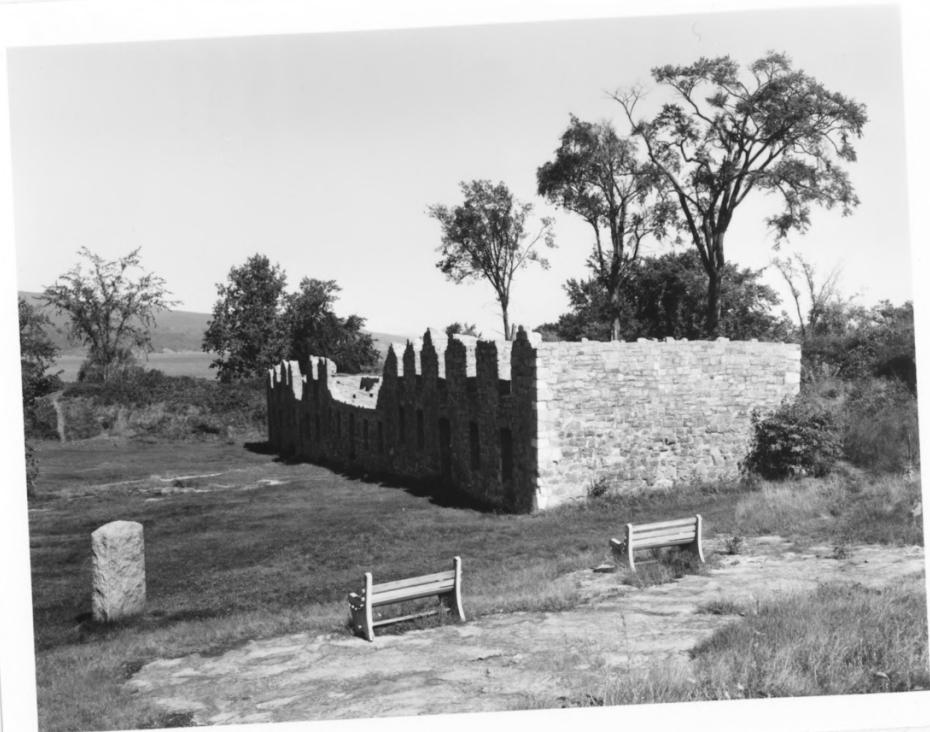
Fort Crown Point (Amherst) 1760 View of South (Front) Elevation and East End of N.E. Barracks