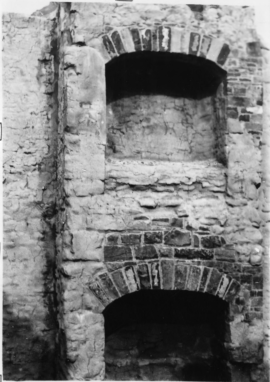
CLOSE-UP OF FIREPLACES SHOWING FIRST AND SECOND FLOOR LEVELS