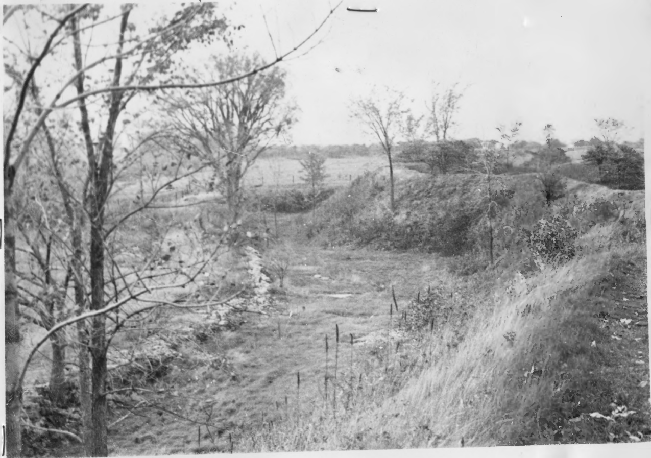
VIEW OF OUTER TRENCH AND EARTHWORK -- SECTION OF OLD FORT AMHERST