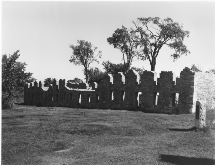
Fort Crown Point (Amherst), 1760 South (Front) Elevation and East end of N. E. Barracks