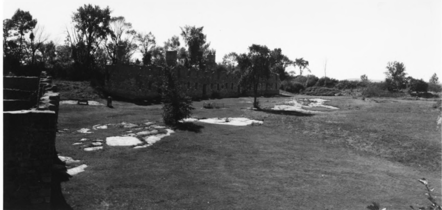
Fort Crown Point (Amherst), 1760 View of N.E. Barracks (Left), S.E. Barracks, Center, and Parade Ground