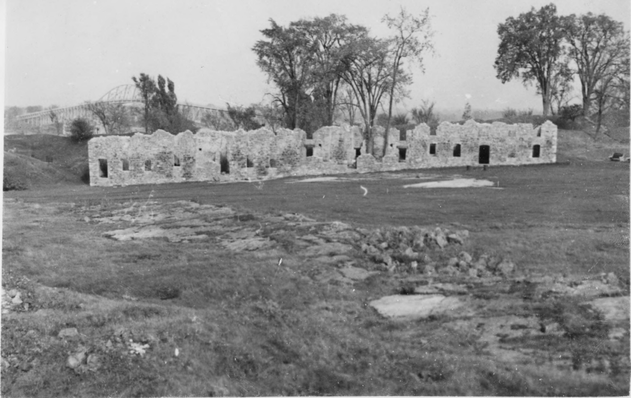
VIEWS OF RUINS OF OLD FORT AMHERST SHOWING EXTENT, PRESENT STATE OF PRESERVATION, AND DETAILS OF BARRACKS