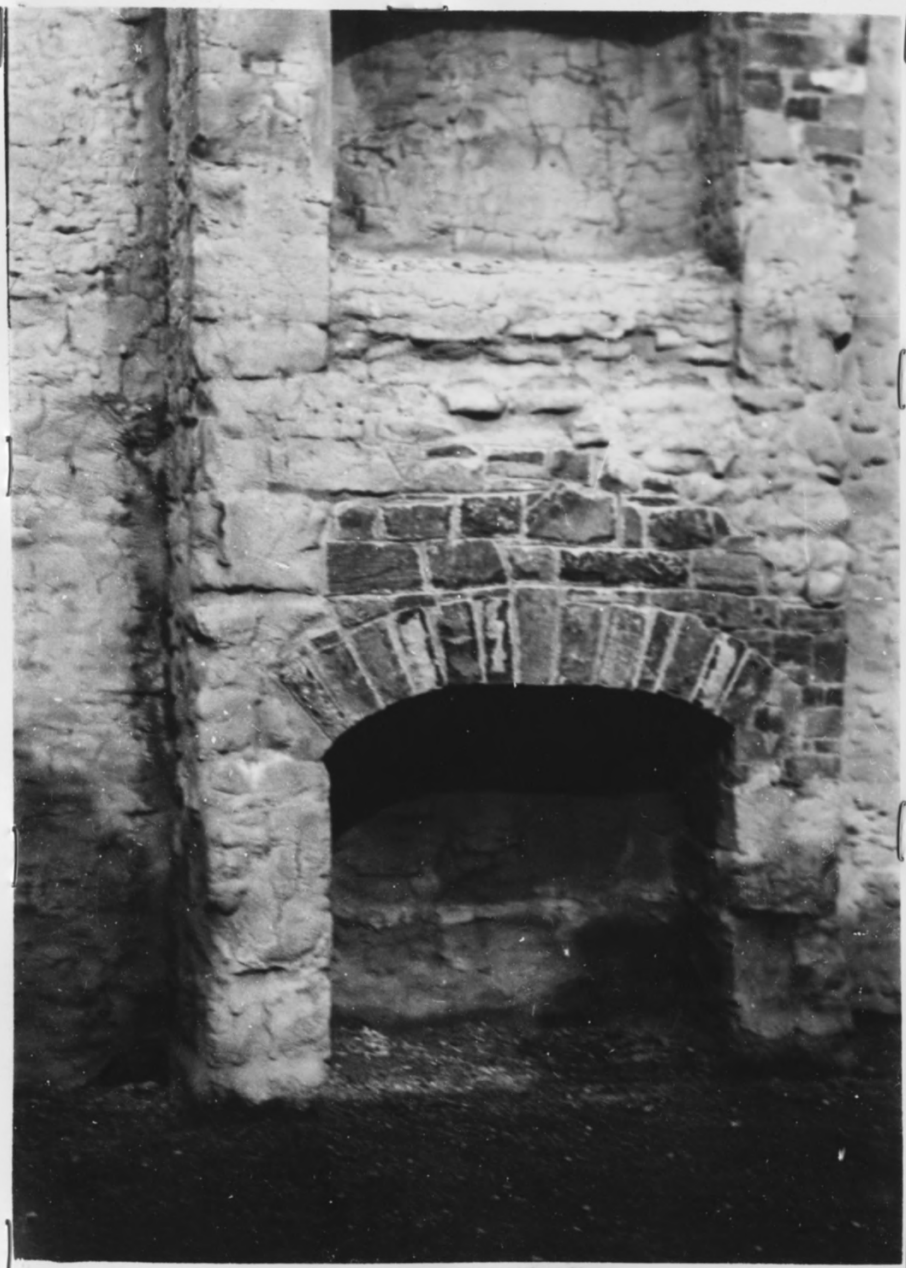
LOWER, OR FIRST FLOOR FIREPLACE