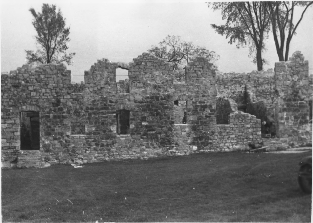
VIEWS OF RUINS OF OLD FORT AMHERST SHOWING EXTENT, PRESENT STATE OF PRESERVATION, AND DETAILS OF BARRACKS