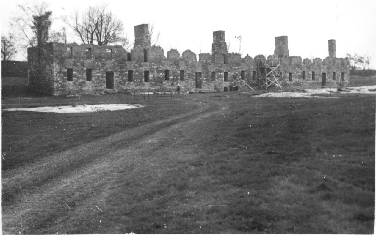
VIEWS OF RUINS OF OLD FORT AMHERST SHOWING EXTENT, PRESENT STATE OF PRESERVATION, AND DETAILS OF BARRACKS