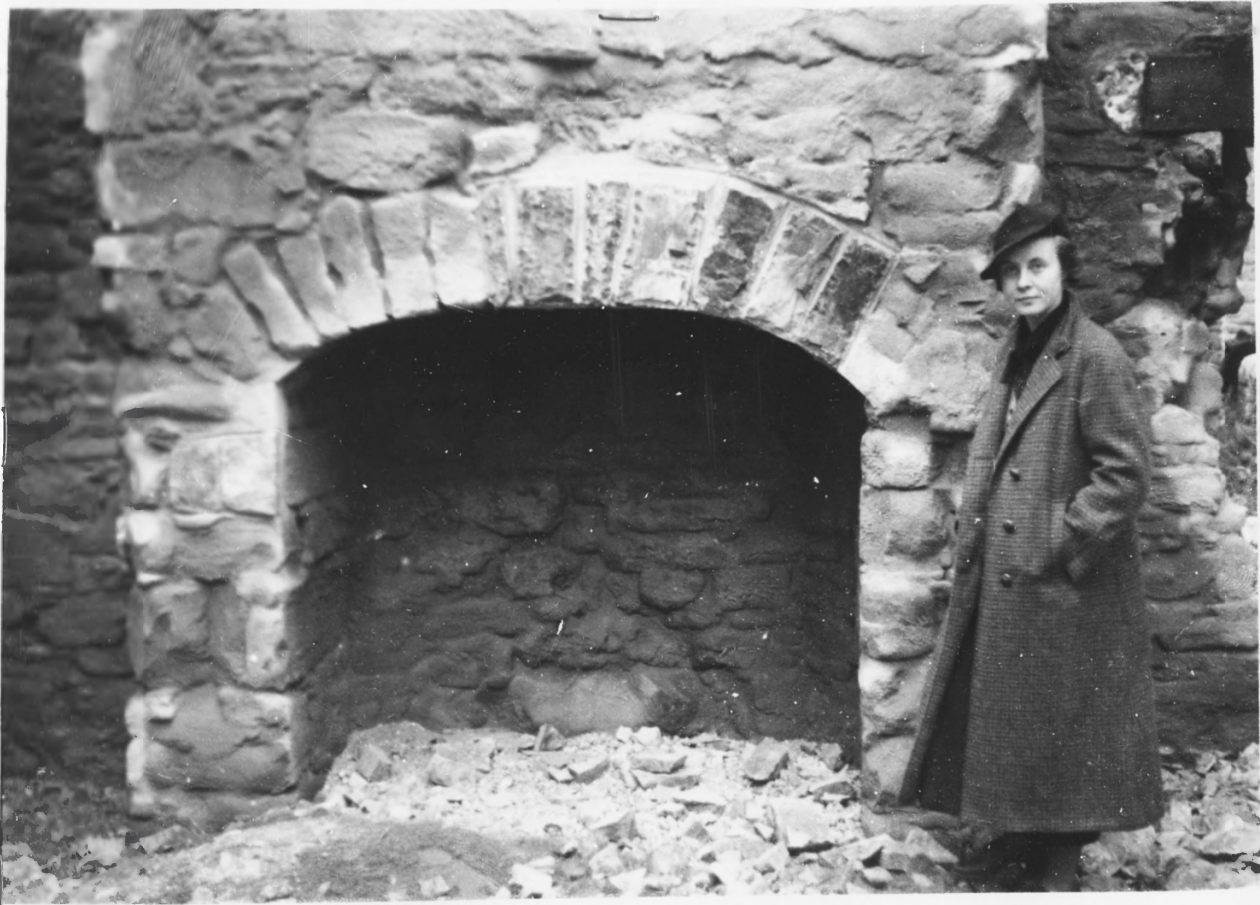
CLOSE-UP OF FIRST FLOOR FIREPLACE