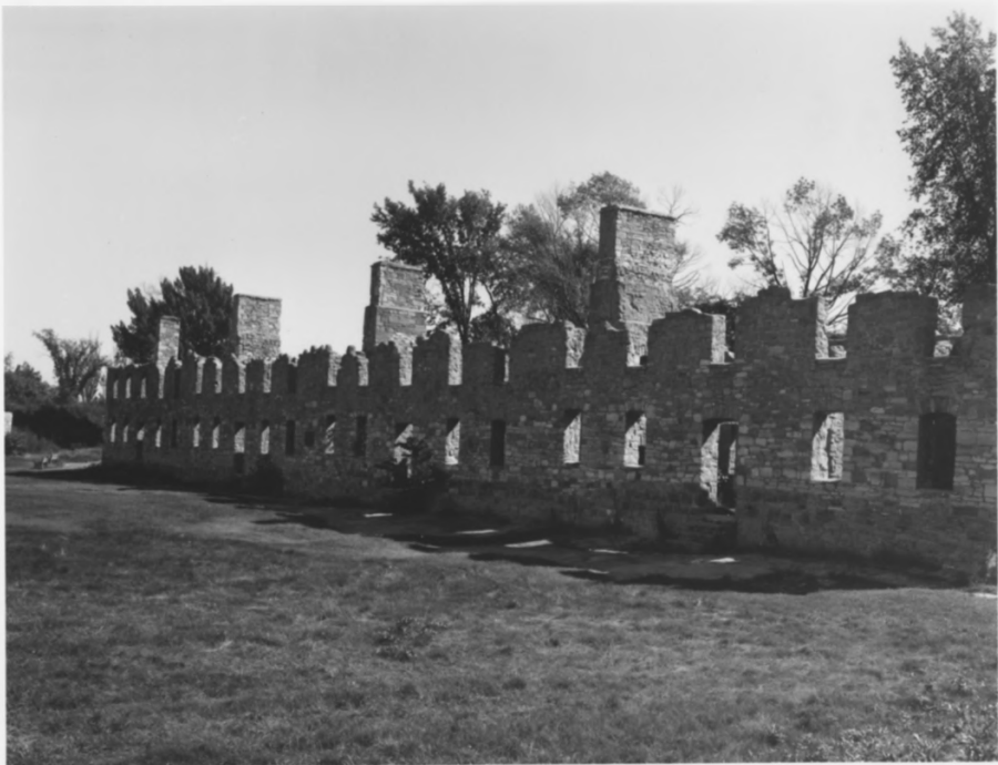
Fort Crown Point (Amherst), 1760 West (Front) Elevation of S.E. Barracks