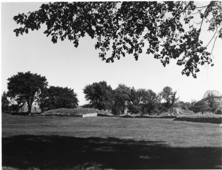
View of the Ruins of Fort St. Frederic, 1731 Crown Point, New York North end (Left) and West Side