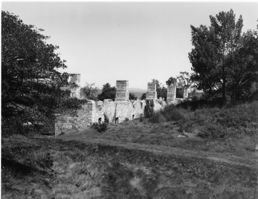
Fort Crown Point (Amherst), 1760 Rear (East) and South End of S.E. Barracks