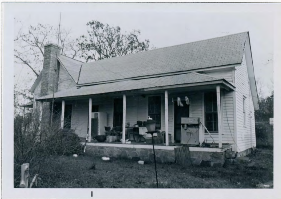
Historic Resources of Stone County Henry Copeland House, ST-36 Pleasant Grove 1983 Negative on file at the AHPP Viewed from the northwest