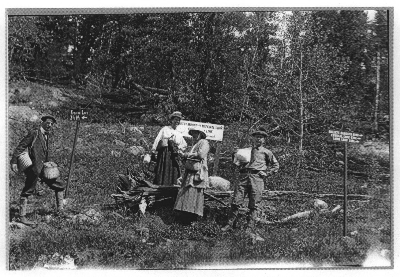
Photo H1: Ypsilon Lake Trail trailhead (the junction of Lawn Lake and Ypsilon Trails) in circa 1915. Notice the sign saying "Ypsilon Lake 3 ½ Mi," even though the trip is 4 ½ miles. The discrepancy is likely due to inaccurate measuring techniques.

Ypsilon Lake Trail Larimer County/ Colorado Rocky Mountain National Park MPS Historic Park Landscapes in National and State Parks MPS