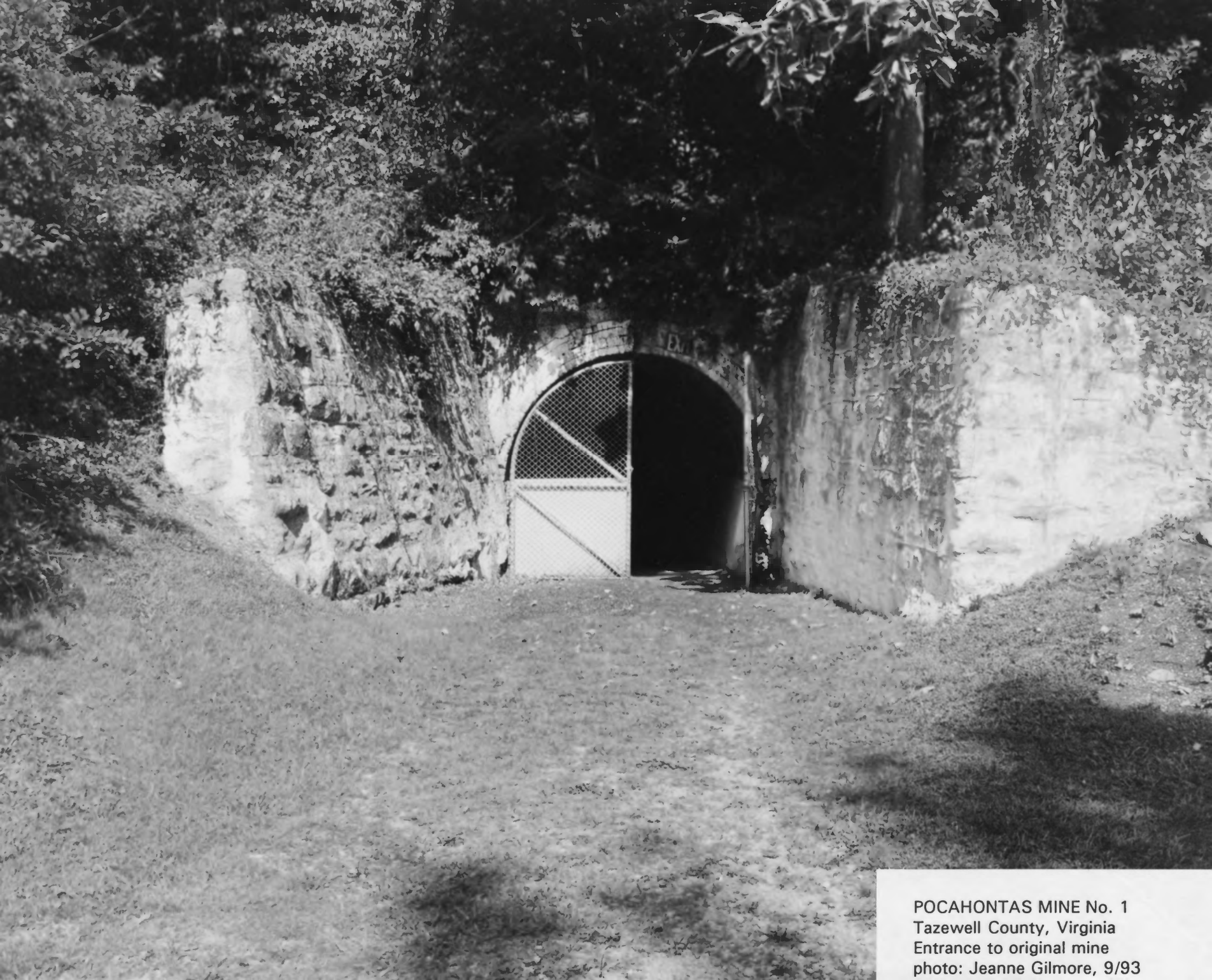
POCAHONTAS MINE No. 1 Tazewell County, Virginia Entrance to original mine photo: Jeanne Gilmore, 9/93