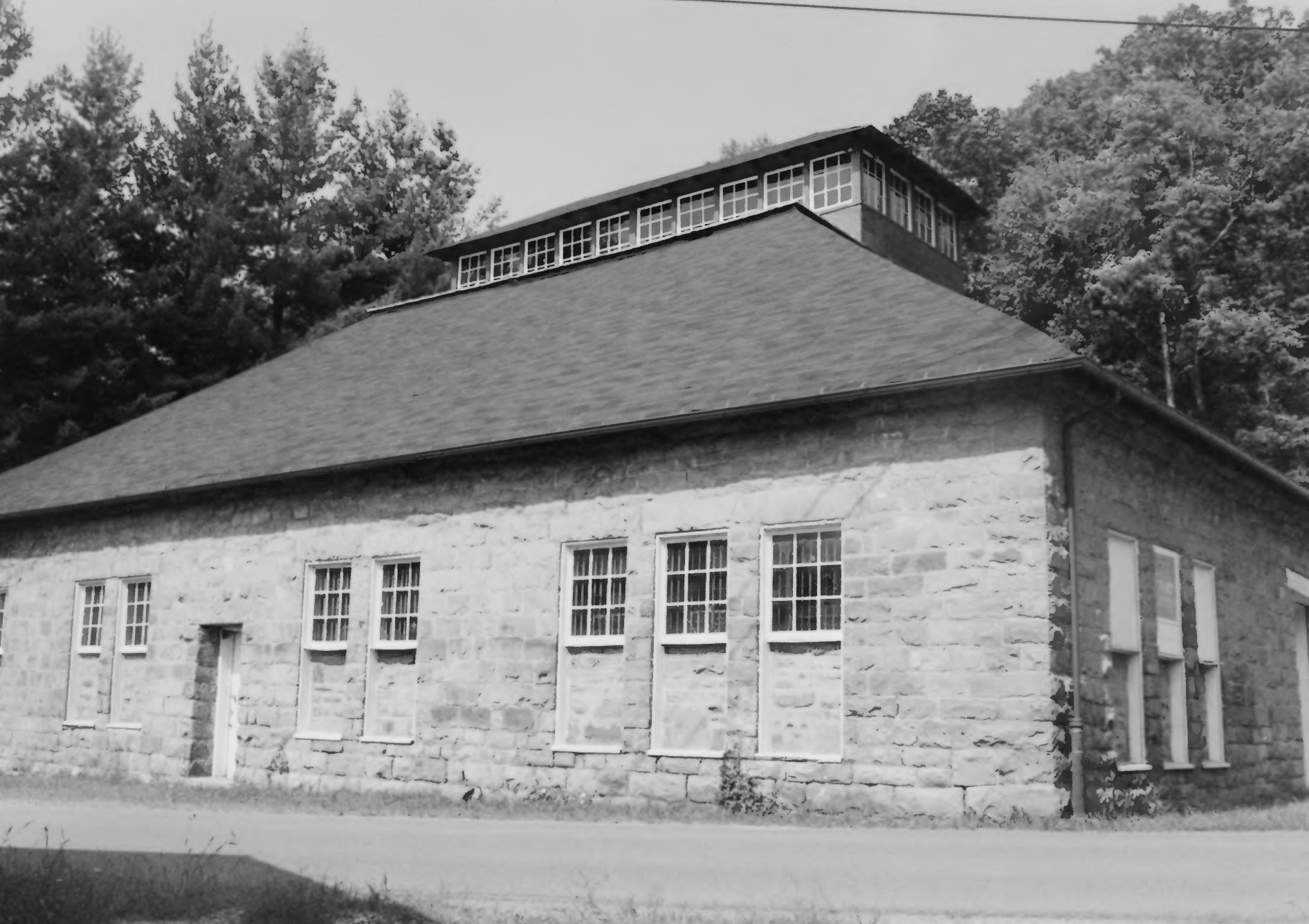
POCAHONTAS MINE No. 1 Tazewell County, Virginia Powerhouse/ Bathhouse photo: Jeanne Gilmore, 9/93