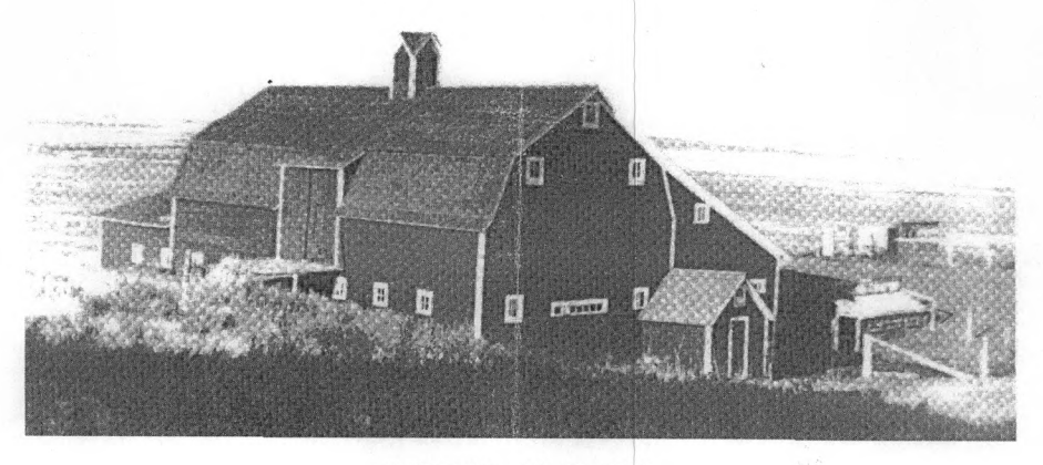
LaPierre Horse Hotel c. 1954.