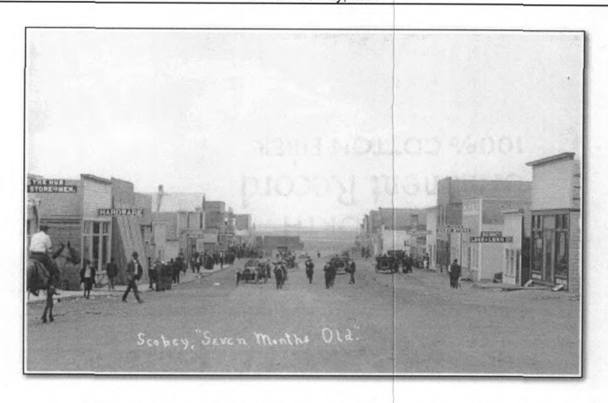
"Scobey, Seven Months Old." Scobey Parade on July 4, 1914.