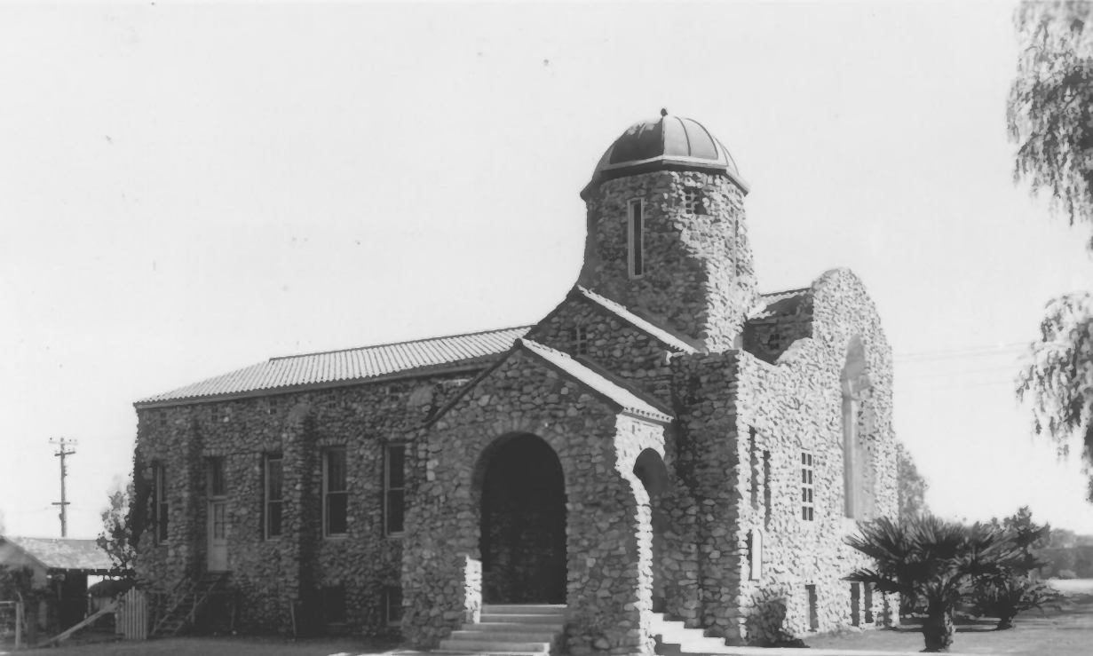
PRESBYTERIAN CHURCH, CASA GRANDE, ARIZONA 6283