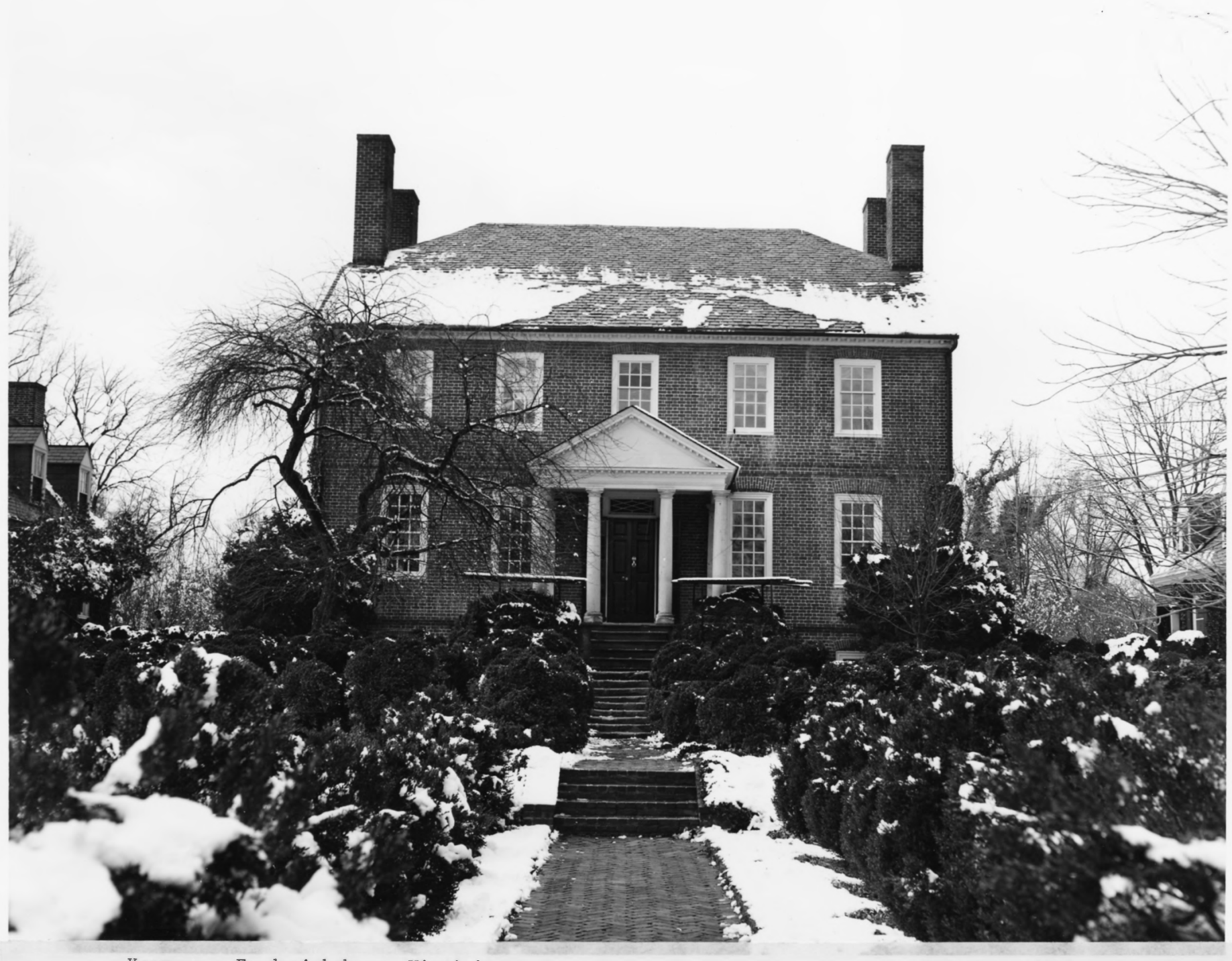
Kenmore, Fredericksburg, Virginia