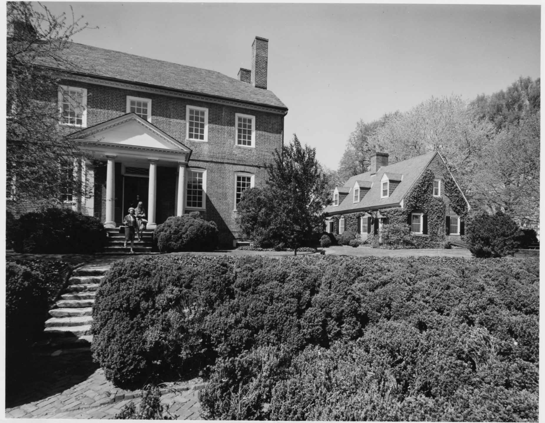
Kenmore, Fredericksburg, Virginia