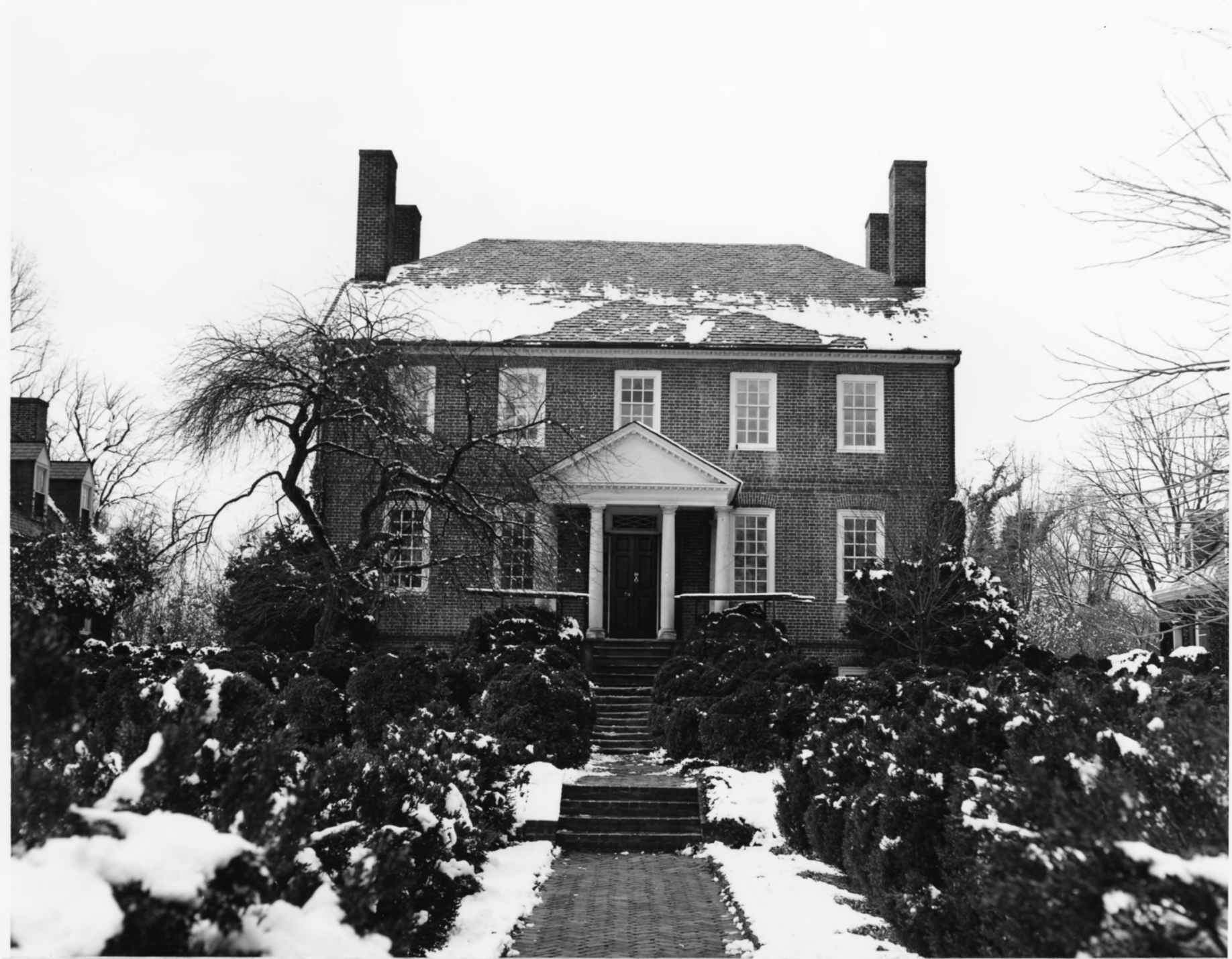
Kenmore, Fredericksburg, Virginia