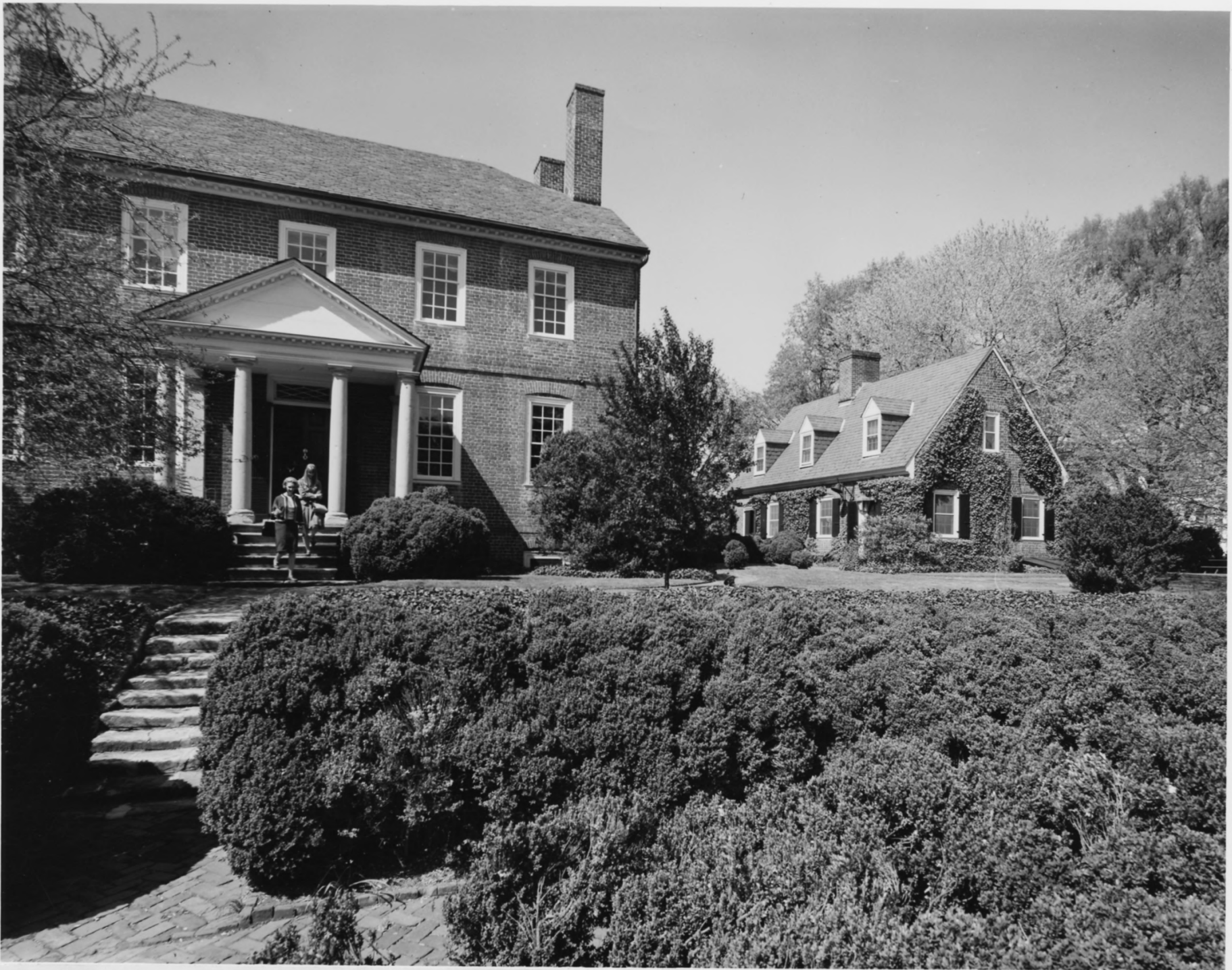
Kenmore, Fredericksburg, Virginia