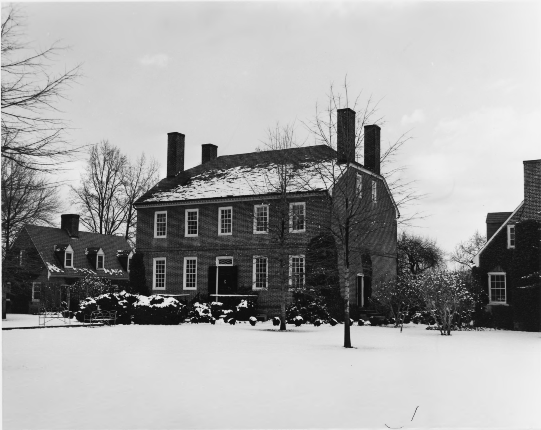
Kenmore, Fredericksburg, Virginia