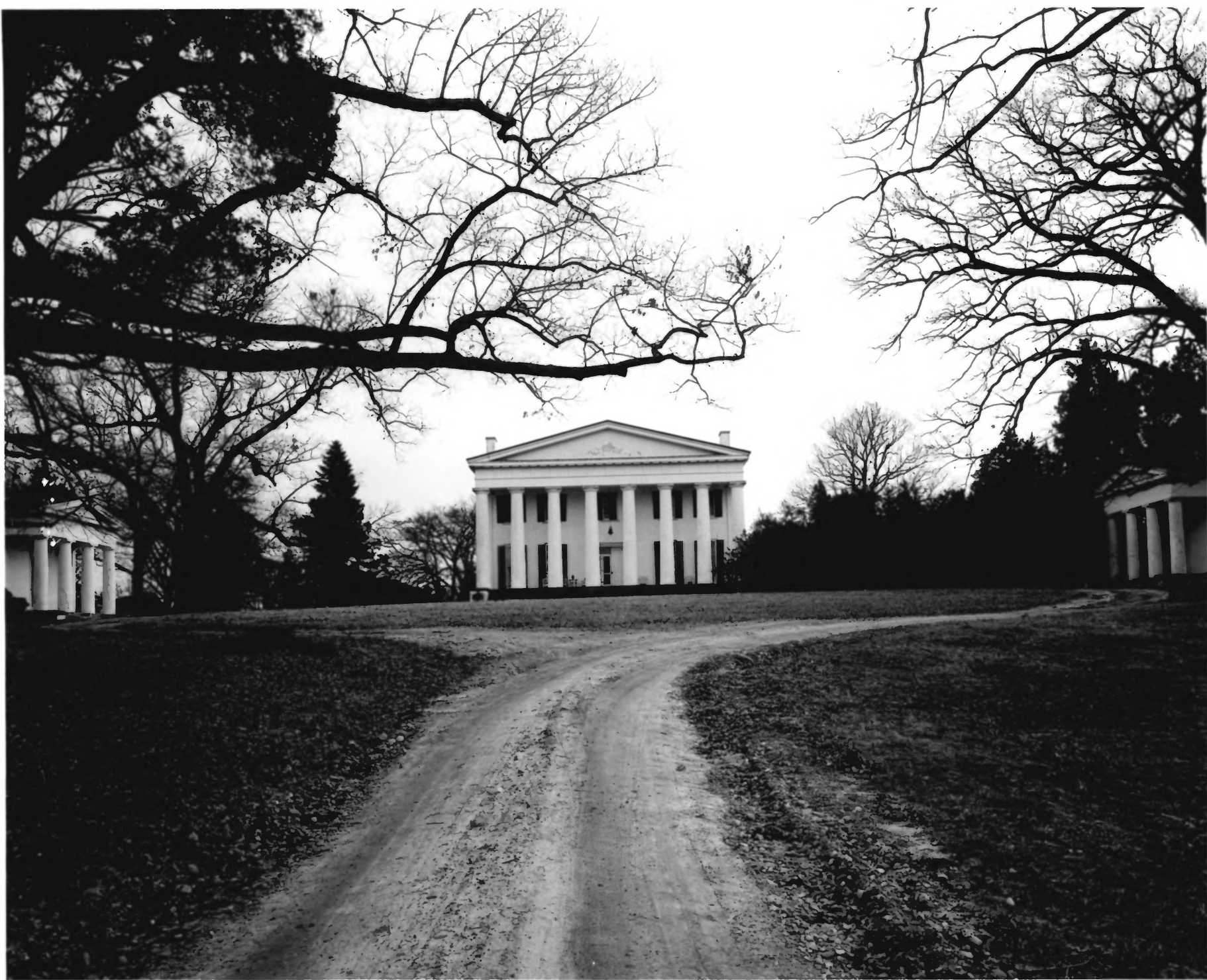
Berry Hill, Halifax Co., Virginia