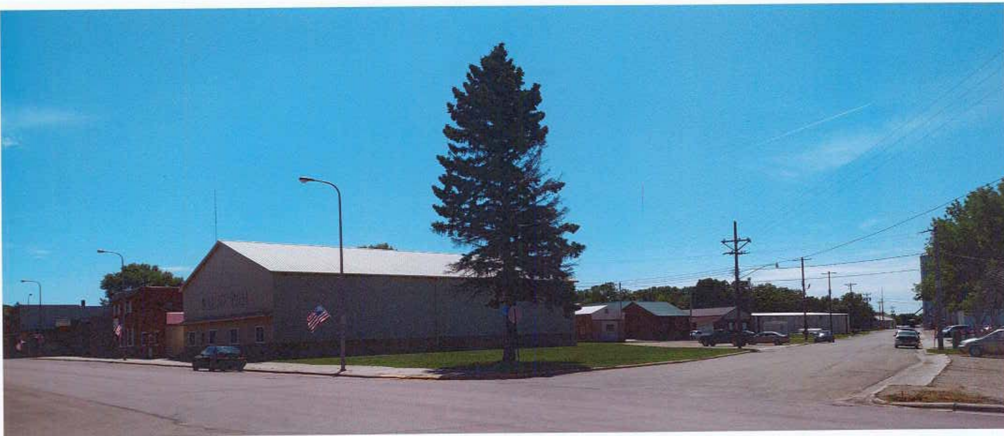
COMMERCIAL HOTEL REDWOOD COUNTY MN 30 MAY 2016 CAMERA FACING SE