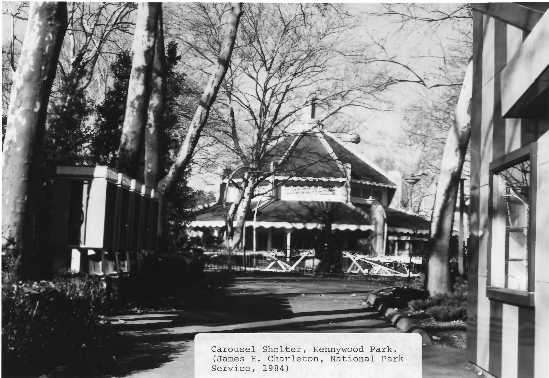
Carousel Shelter, Kennywood Park.