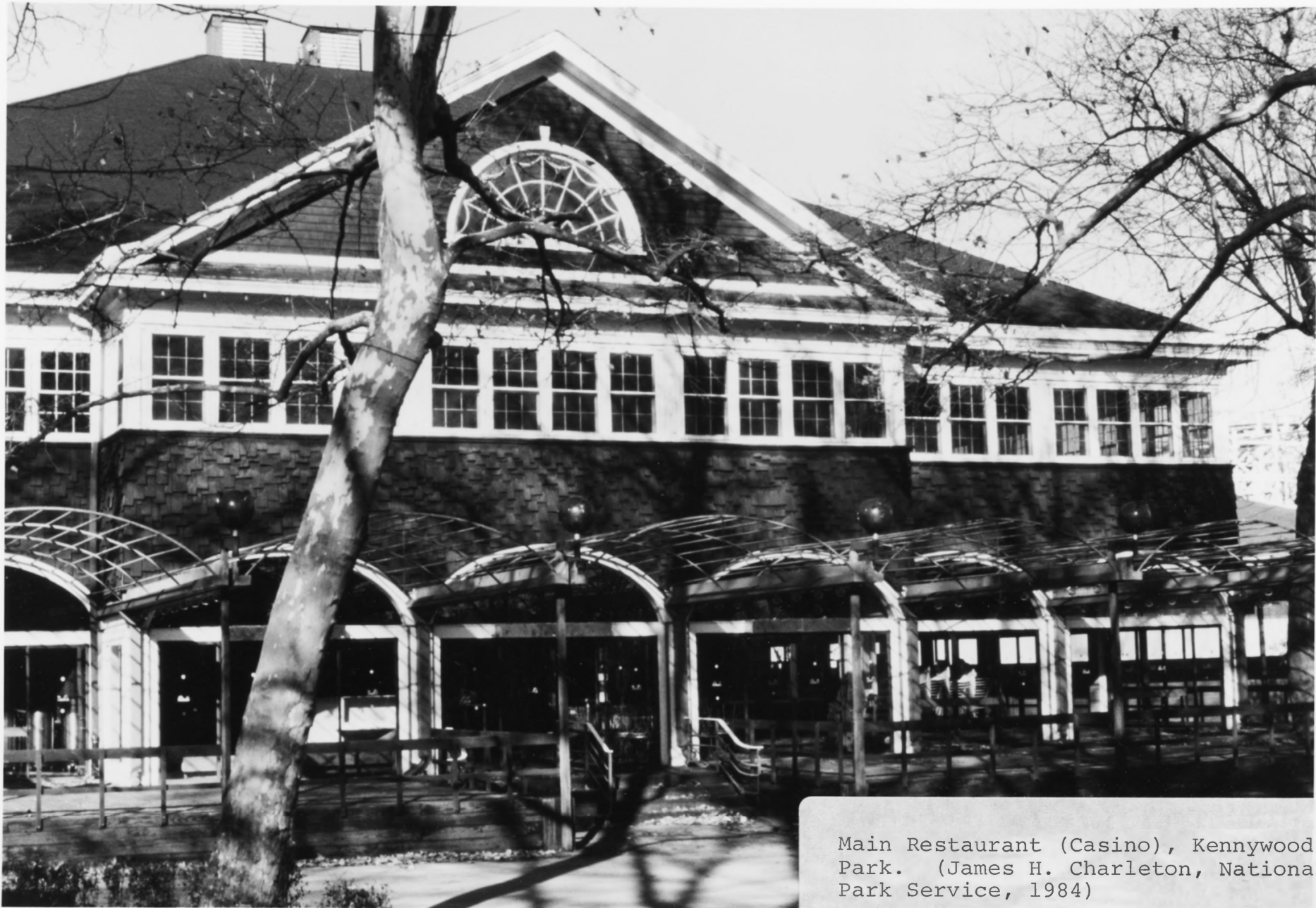
Main Restaurant (Casino), Kennywood Park.