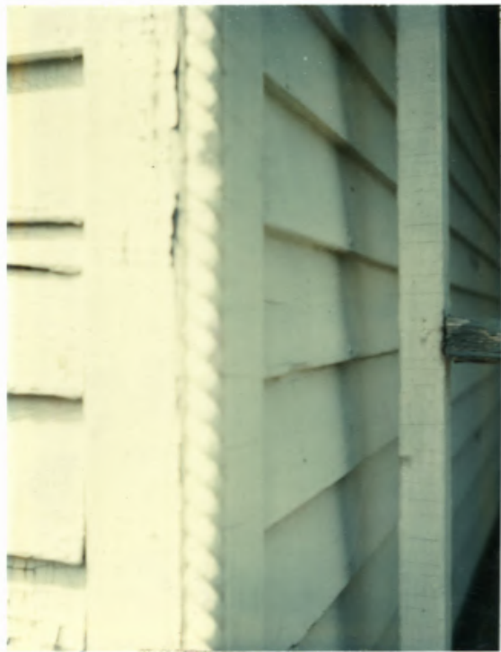
Rope Design on Corner