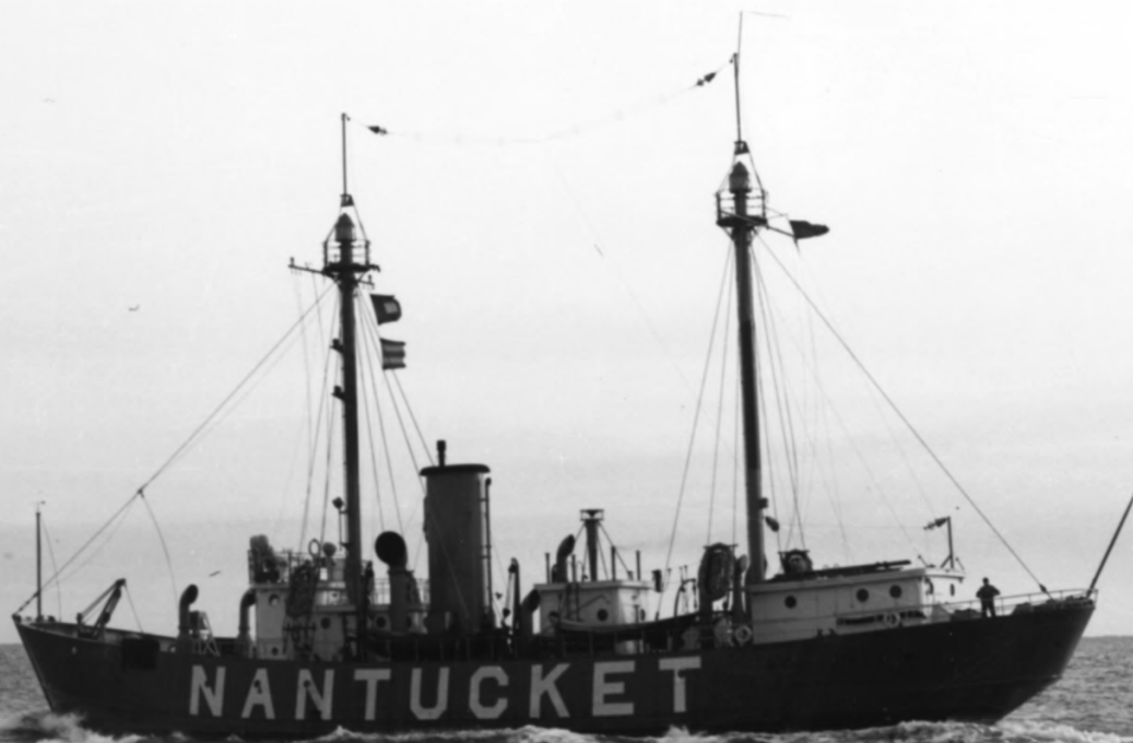
LIGHTSHIP NO. 112, NANTUCKET SOUTH PORTLAND, MAINE Owner: NANTUCKET LIGHTSHIP PRESERVATION LIGHTSHIP NO. 112 AS SHE APPEARED WHEN SERVING ON THE NANTUCKET STATION. Photo #1 by UNKNOWN, 1930S Courtesy of: U.S. COAST GUARD HISTORIAN'S OFF