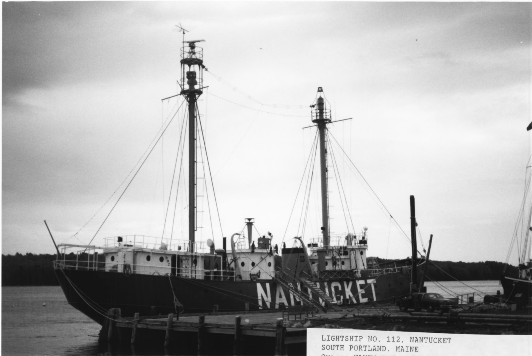
LIGHTSHIP NO. 112, NANTUCKET SOUTH PORTLAND, MAINE Owner: NANTUCKET LIGHTSHIP PRESERVATION LIGHTSHIP NO. 112 AS SHE APPEARS TODAY, VIEW OF THE STARBOARD AFTER QUARTER. Photo #3 by JAMES P. DELGADO, 1989 Courtesy of: NATIONAL PARK SERVICE