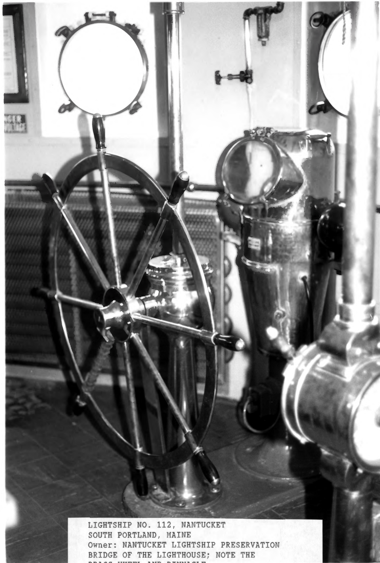
LIGHTSHIP NO. 112, NANTUCKET SOUTH PORTLAND, MAINE Owner: NANTUCKET LIGHTSHIP PRESERVATION BRIDGE OF THE LIGHTHOUSE; NOTE THE BRASS WHEEL AND BINNACLE.