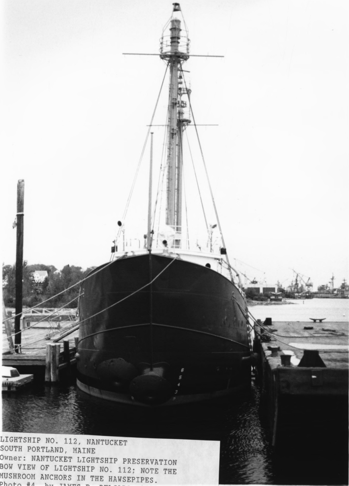
LIGHTSHIP NO. 112, NANTUCKET SOUTH PORTLAND, MAINE Owner: NANTUCKET LIGHTSHIP PRESERVATION BOW VIEW OF LIGHTSHIP NO. 112; NOTE THE MUSHROOM ANCHORS IN THE HAWSEPIPES. Photo #4 by JAMES P. DELGADO, 1989 Courtesy of: NATIONAL PARK SERVICE