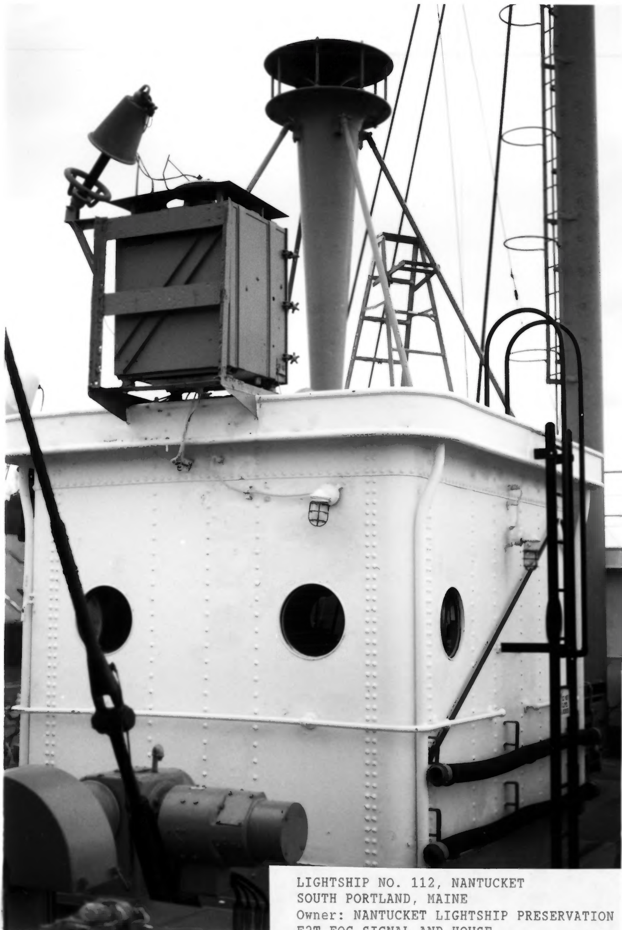
LIGHTSHIP NO. 112, NANTUCKET SOUTH PORTLAND, MAINE Owner: NANTUCKET LIGHTSHIP PRESERVATION F2T FOG SIGNAL AND HOUSE. Photo #7 by JAMES P. DELGADO, 1989 Courtesy of: NATIONAL PARK SERVICE