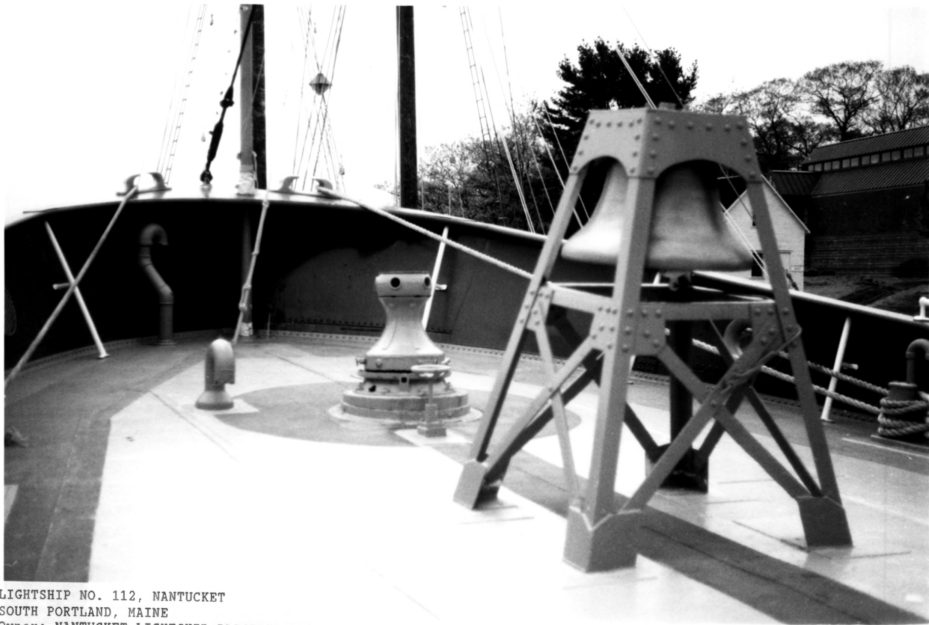
LIGHTSHIP NO. 112, NANTUCKET SOUTH PORTLAND, MAINE Owner: NANTUCKET LIGHTSHIP PRESERVATION FOG BELL AND CAPSTAN ON THE FORECASTLE DECK.