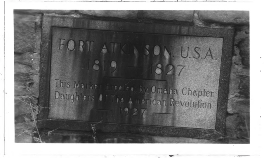
Photo No. 8. Tablet placed in flagpole base by Omaha Chapter Daughters of American Revolution at fort site.