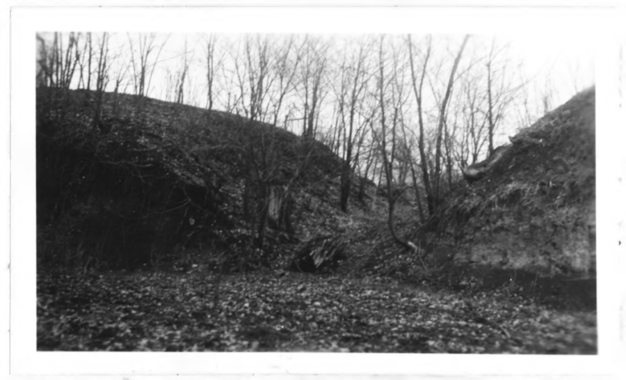
Photo No. 6. View of remains of sld road scar leading to fort site from mouth of Hook's Hollow.