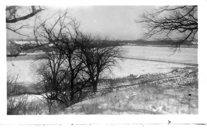
Photo No. 2. View southeast toward Missouri River from the fort's location on the bluff. County road visible in distance.