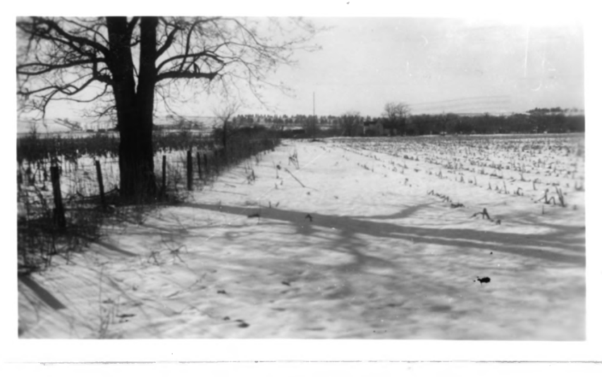
Photo No. 3. View of fort site. Fence marks north boundary of Lot No. 15. Memorial flag pole and buildings on Lots 13 and 14 visible.