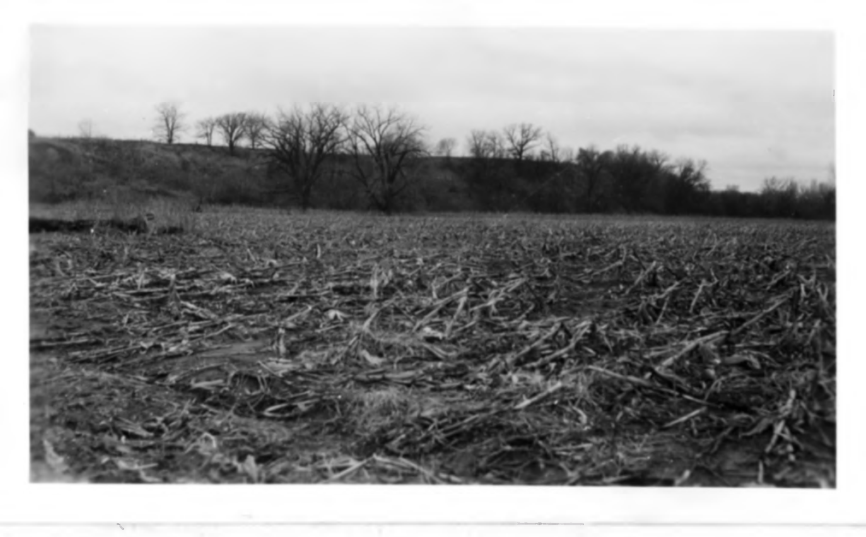
Photo No. 1. View to northwest from county road, looking towards bluff where Fort Atkinson was situated. Missouri River bottom land in foreground.