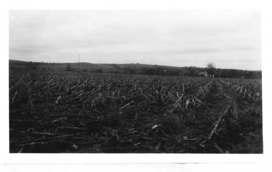
Photo No. 4. View of cornfield on fort site showing flagpole at left and farmstead on right.