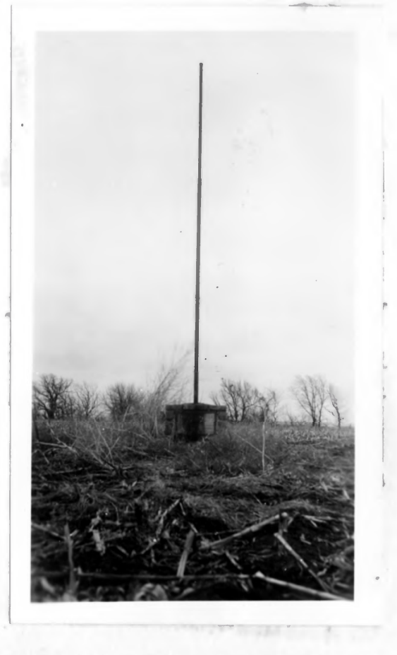
Photo No. 5. View of marker and flagpole placed by Omaha Chapter Daughters of American Revolution - 1927.