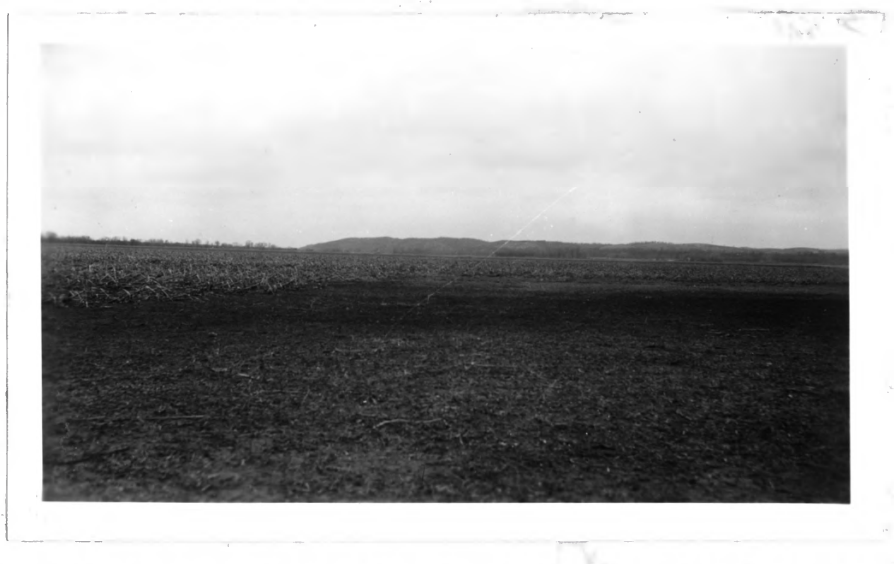
Photo No. 7. The bluff seen can be identified as the Council Bluff of Lewis and Clark. Below it were important fur trading posts. A short distance above it Camp Missouri was established in 1819. The following year, some miles to the northwest, the more permanent post known as Fort Atkinson was established.