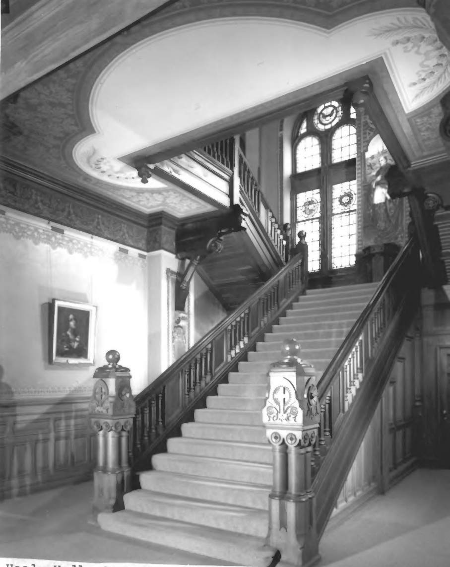
Healy Hall, Georgetown University Washington, DC Detail: Main stair, north pavilion