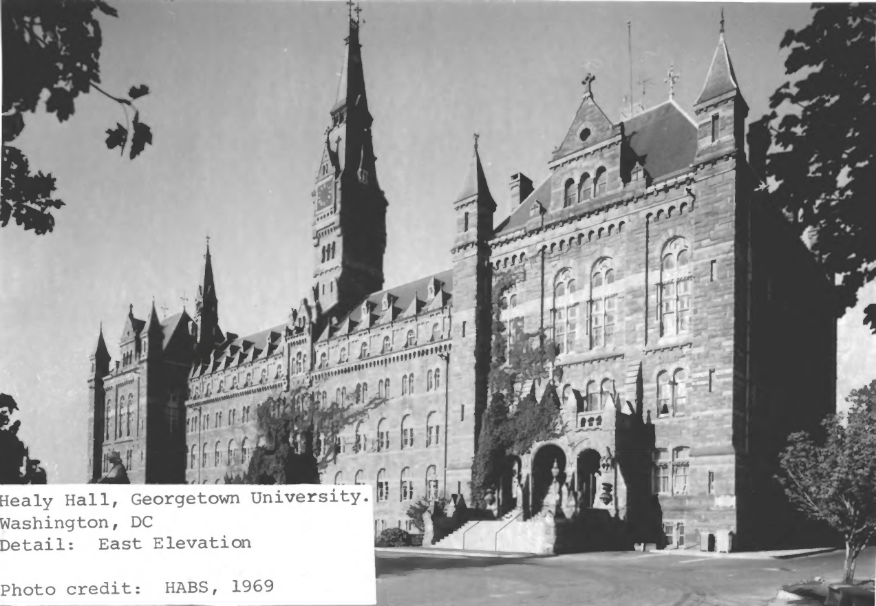
Healy Hall, Georgetown University. Washington, DC Detail: East Elevation