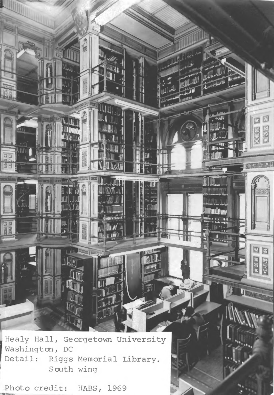
Healy Hall, Georgetown University Washington, DC Detail: Riggs Memorial Library. South wing