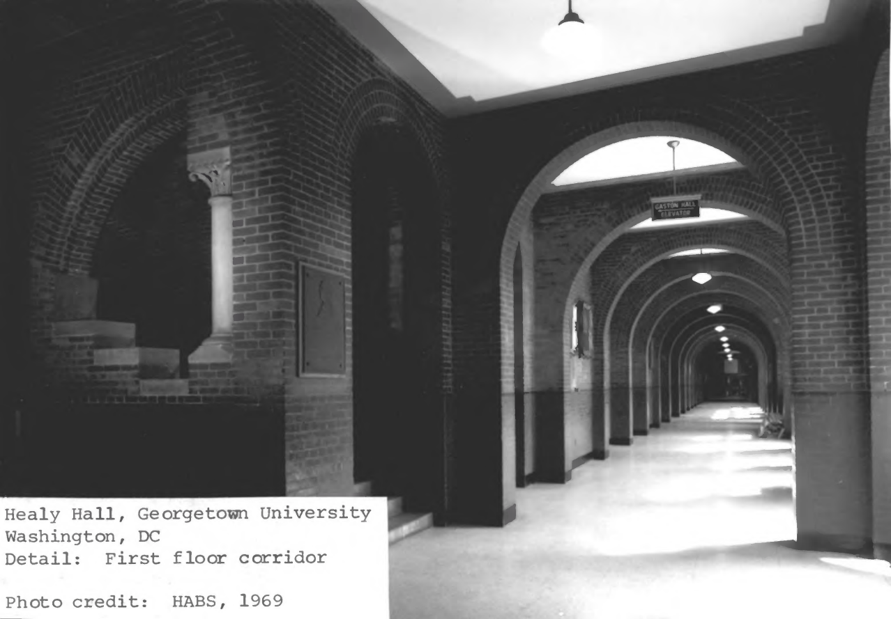
Healy Hall, Georgetown University Washington, DC Detail: First floor corridor