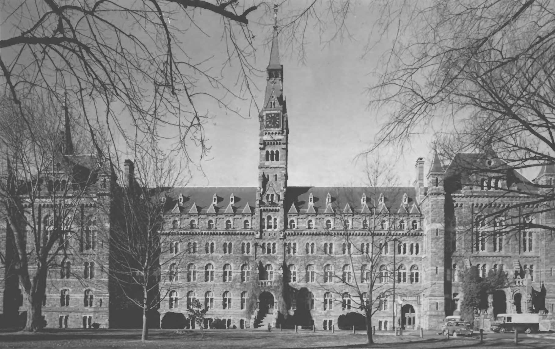
Healy Hall, Georgetown University. Washington, DC Detail: East Facade