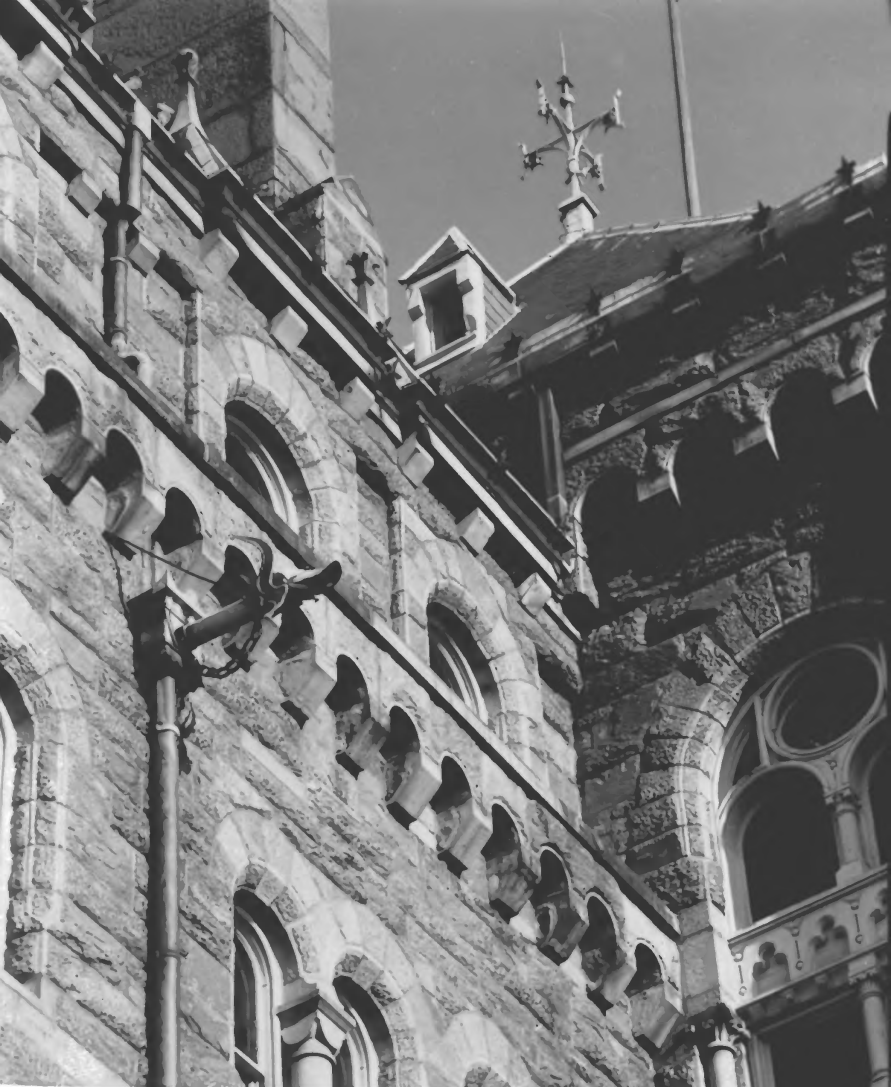
Healy Hall, Georgetown University Washington, DC Detail: East facade