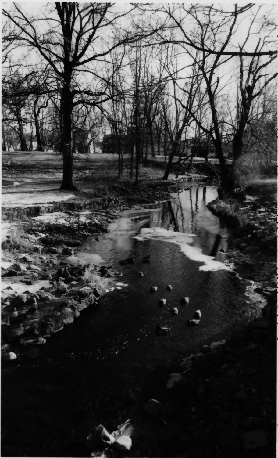
SOFFLE BROOK PARK, PASSAIC COUNTY, HAWTHORNE, N.J.