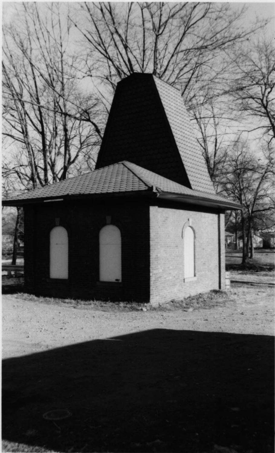
GOFFLE BROOK PARK, PASSAIC COUNTY, HAWTHORNE, N.J.