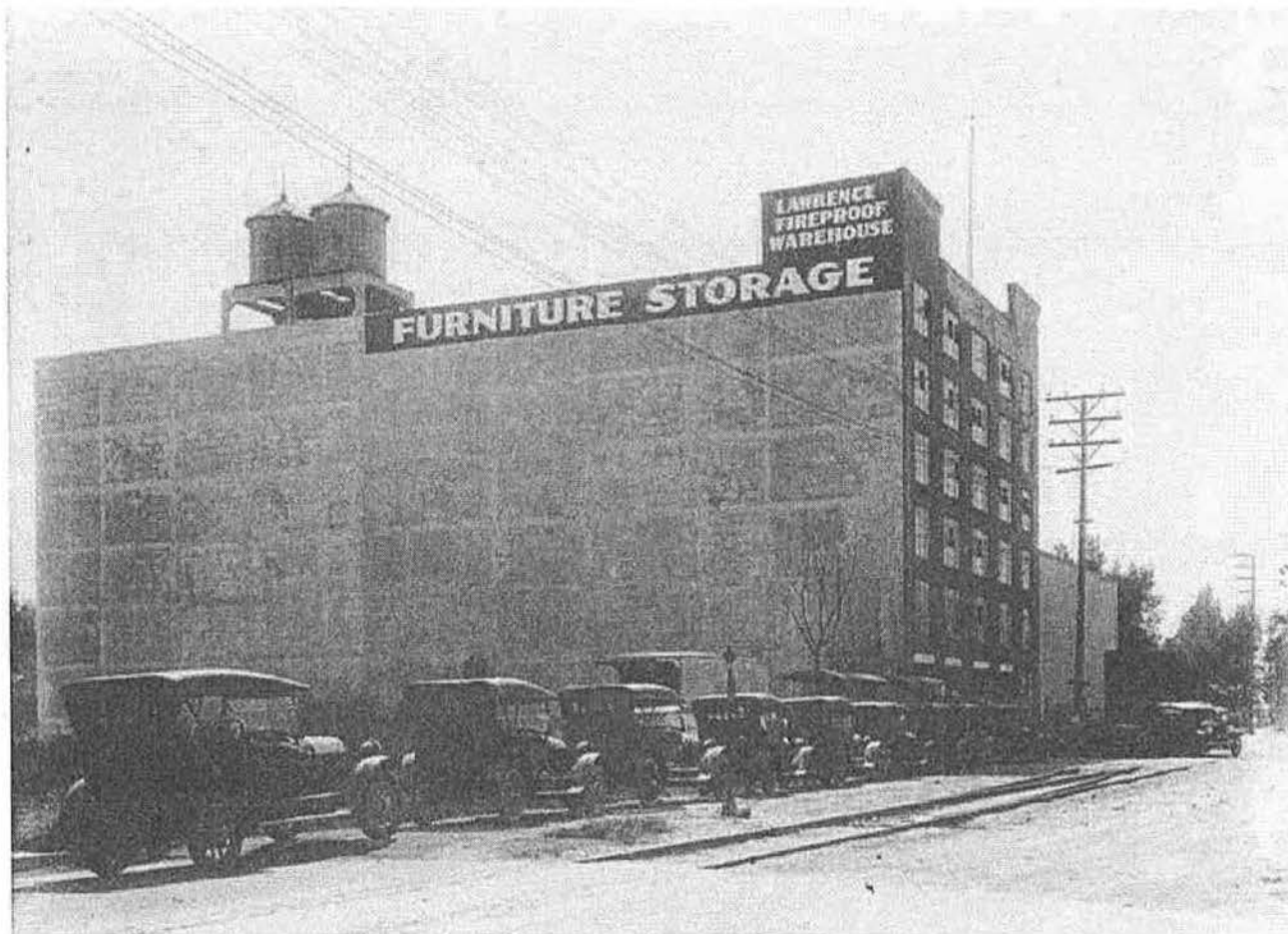
Figure 1: Historic photo of Lawrence Warehouse