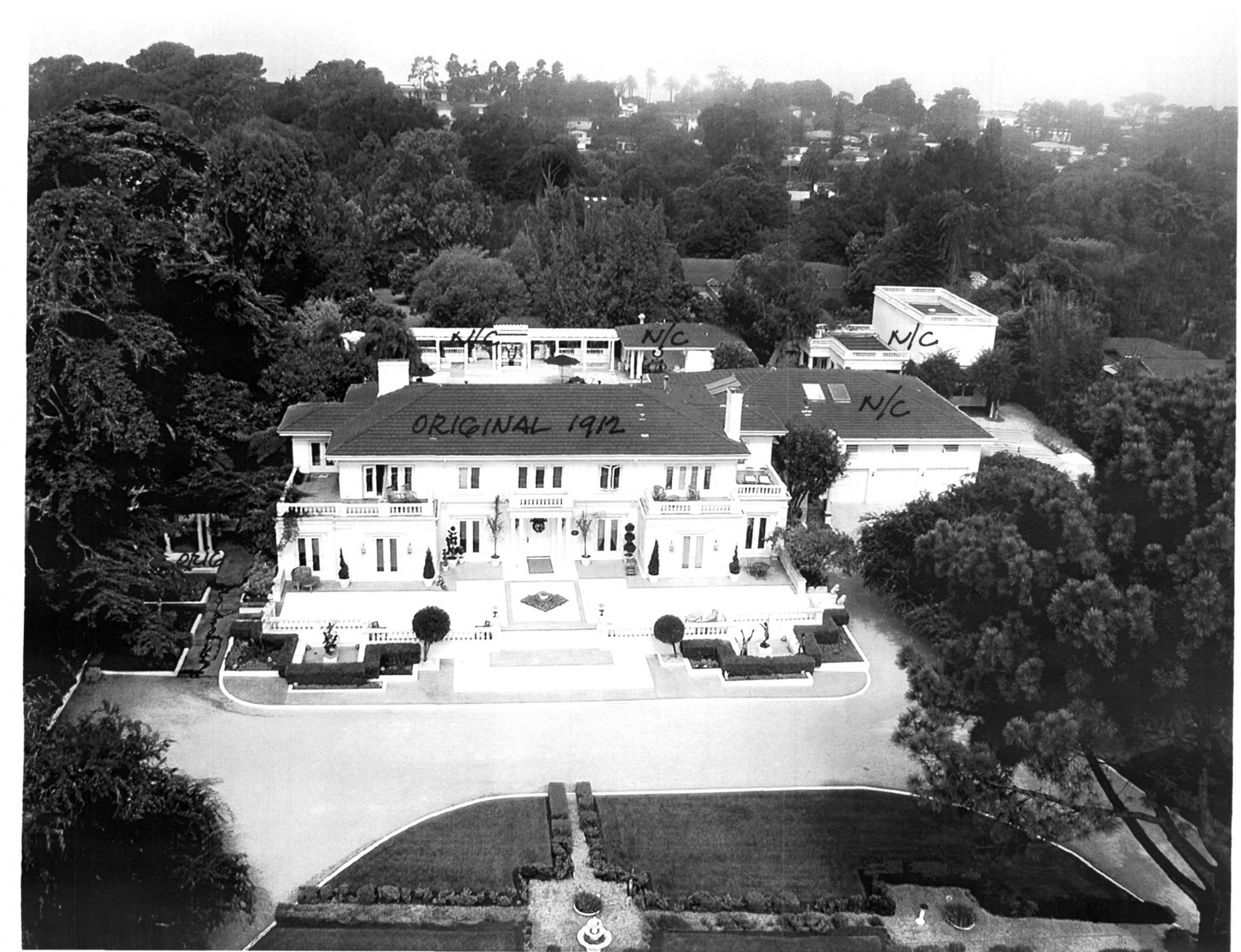
Rosecraft, San Diego Co., CA