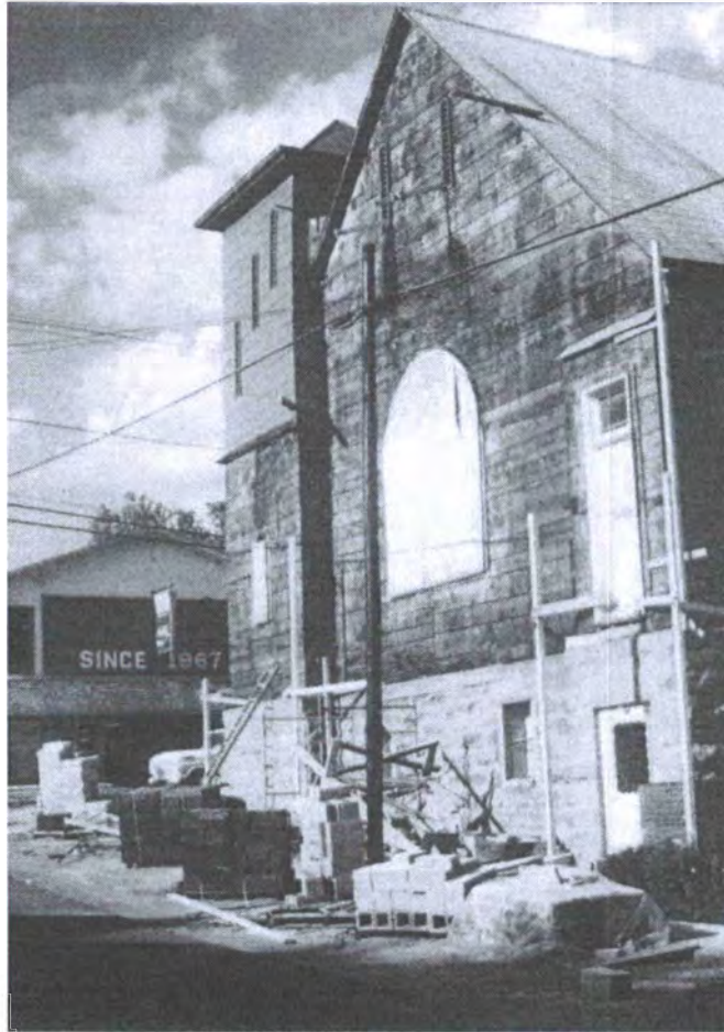
Figure 4: Church being re-bricked