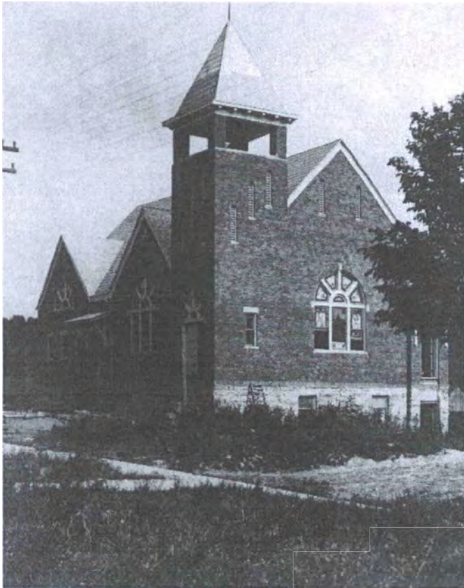
Figure 1: photo of church taken ca. 1910