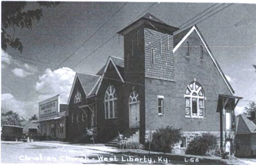
Figure 5: May Grocery, shown beyond (east of) the church