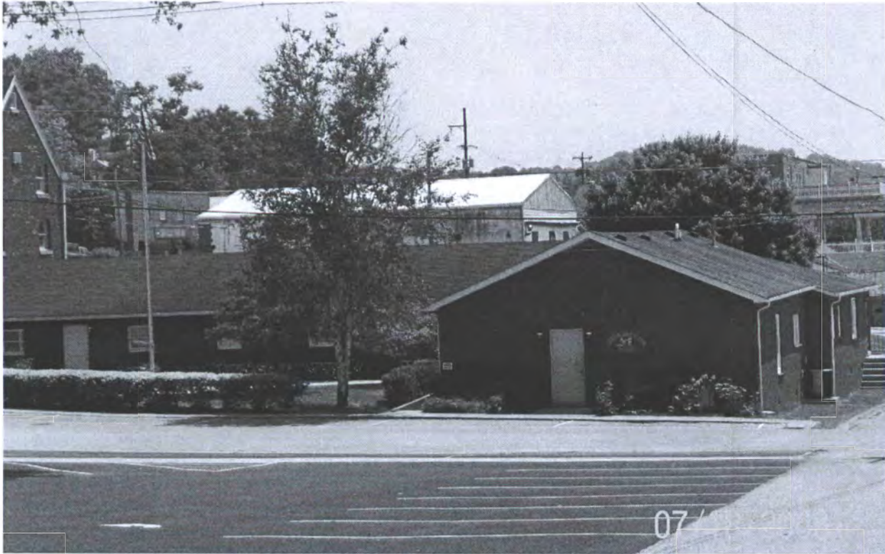
Figure 3: Church annex