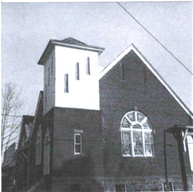
Figure 2: Two images of Modified bell tower