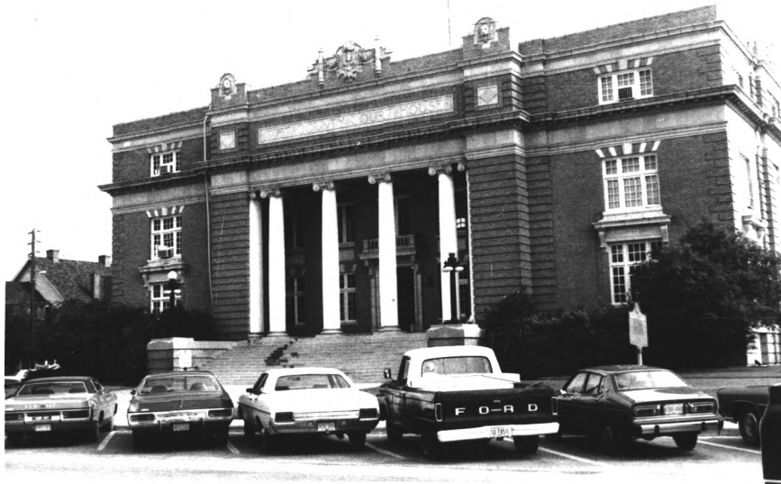
TIFT COUNTY COURTHOUSE