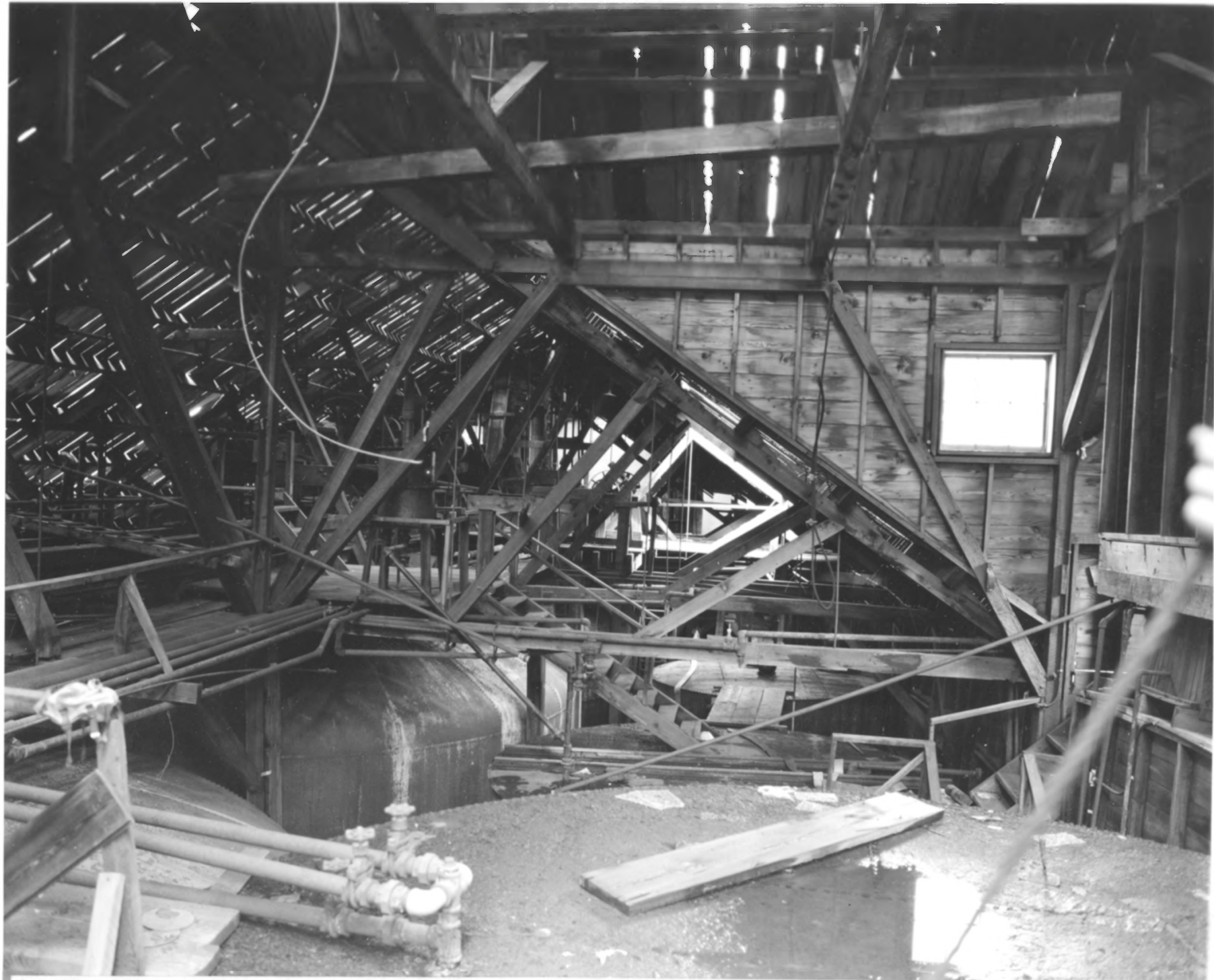
Kennecott Mines, leading plant, Cordova-McCarthy Div., Alaska,