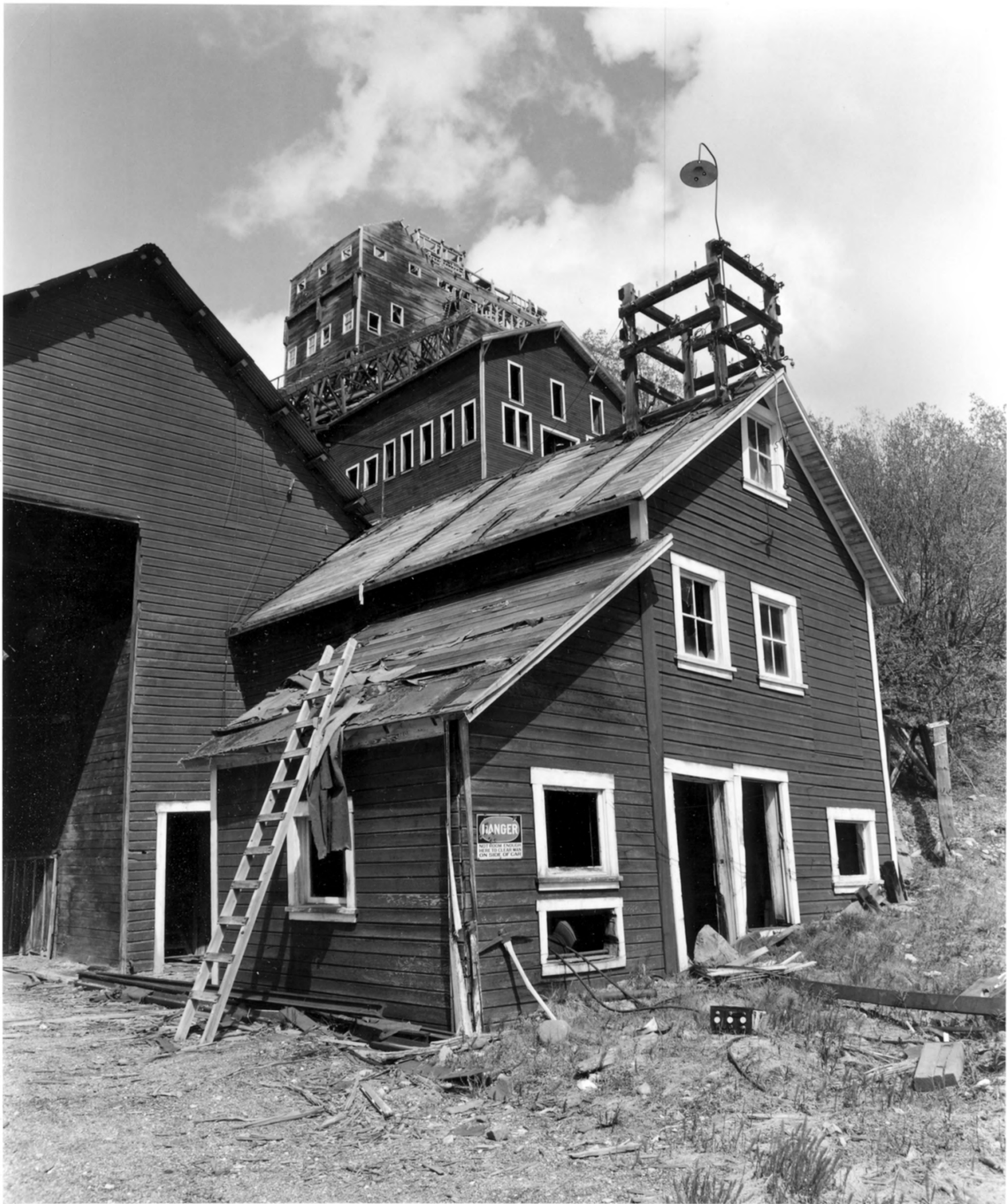
Kennecott Mines, Concentrator, Cordova-McCarthy Div., Alaska, U.S. Forest Service