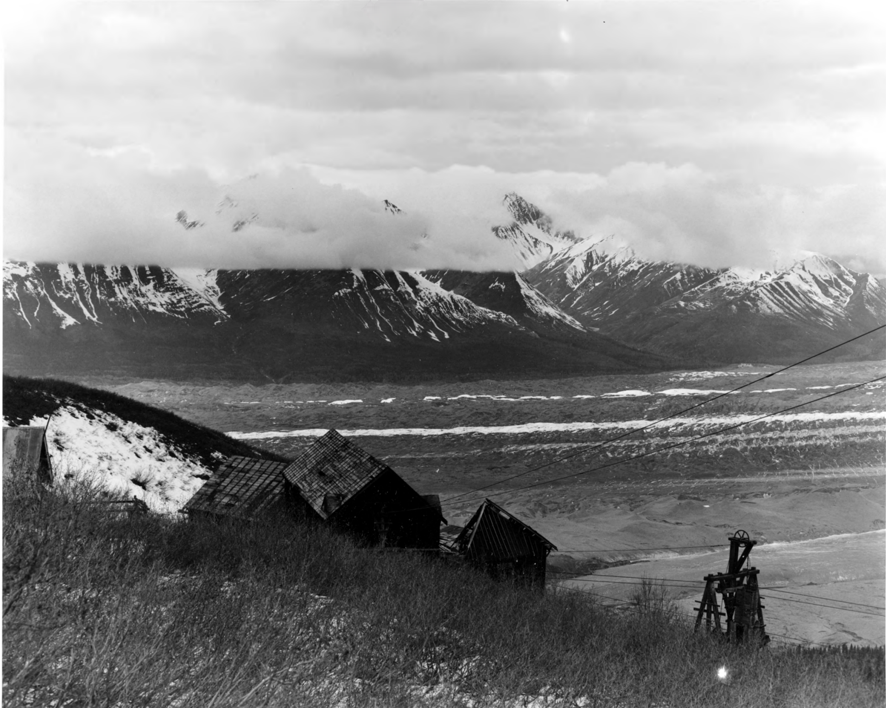
Kennecott Mines, mid-way tram buildings, Cordova-McCarthy Div., Alaska