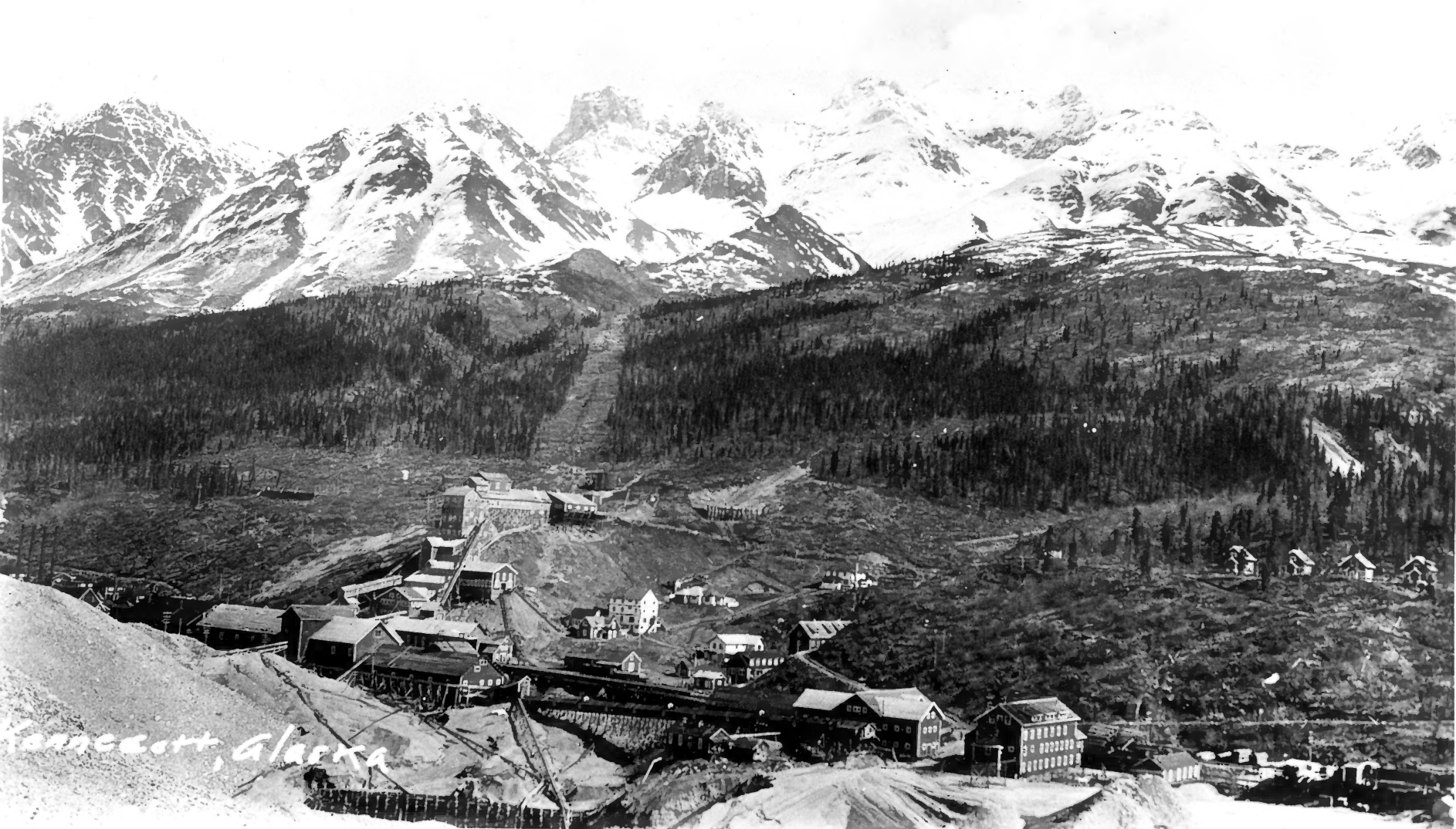
Kennecott ca. 1925 (concentration mill at center, company cottages at right center) Courtesy Anchorage Historical and Fine Arts Museum, B72.32.1