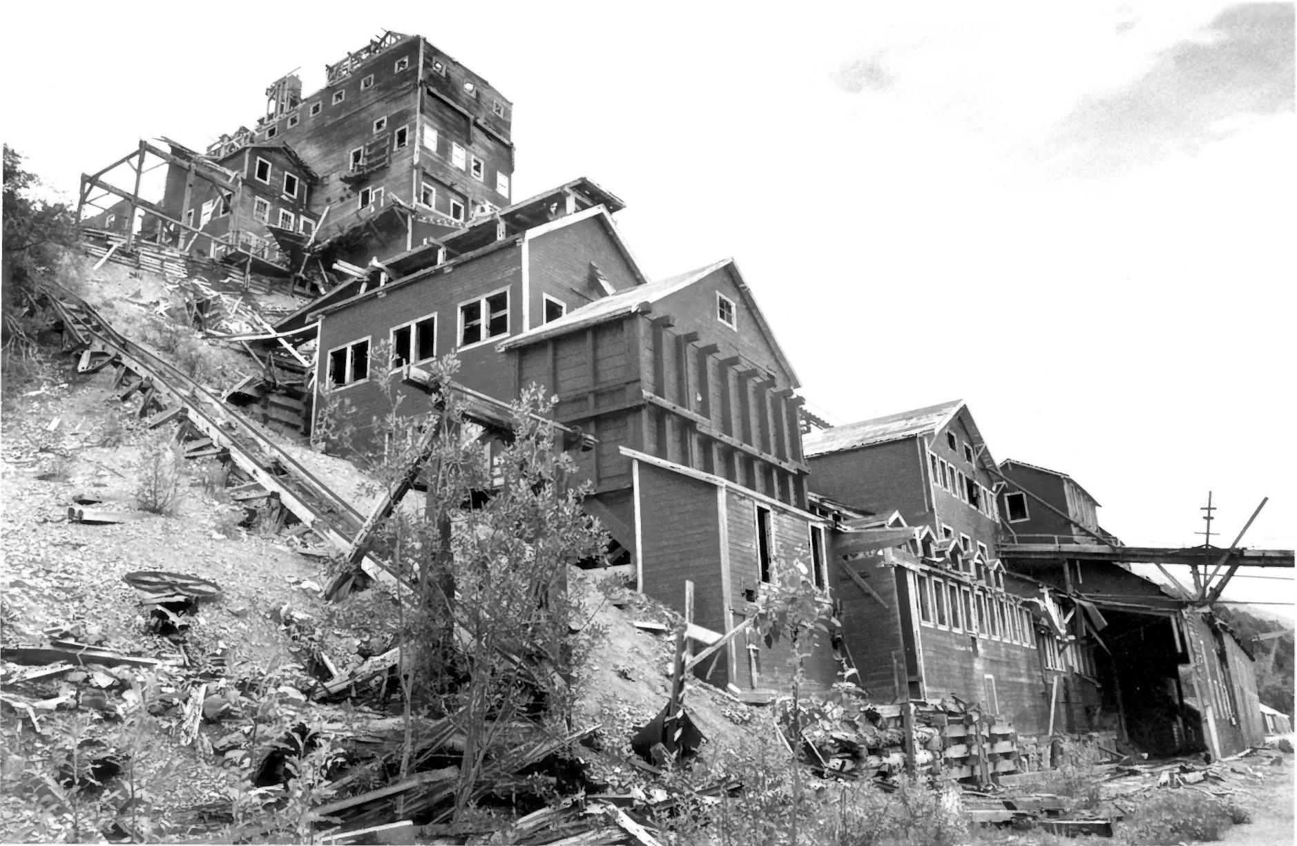
Kennebec concentration mill, July 1983