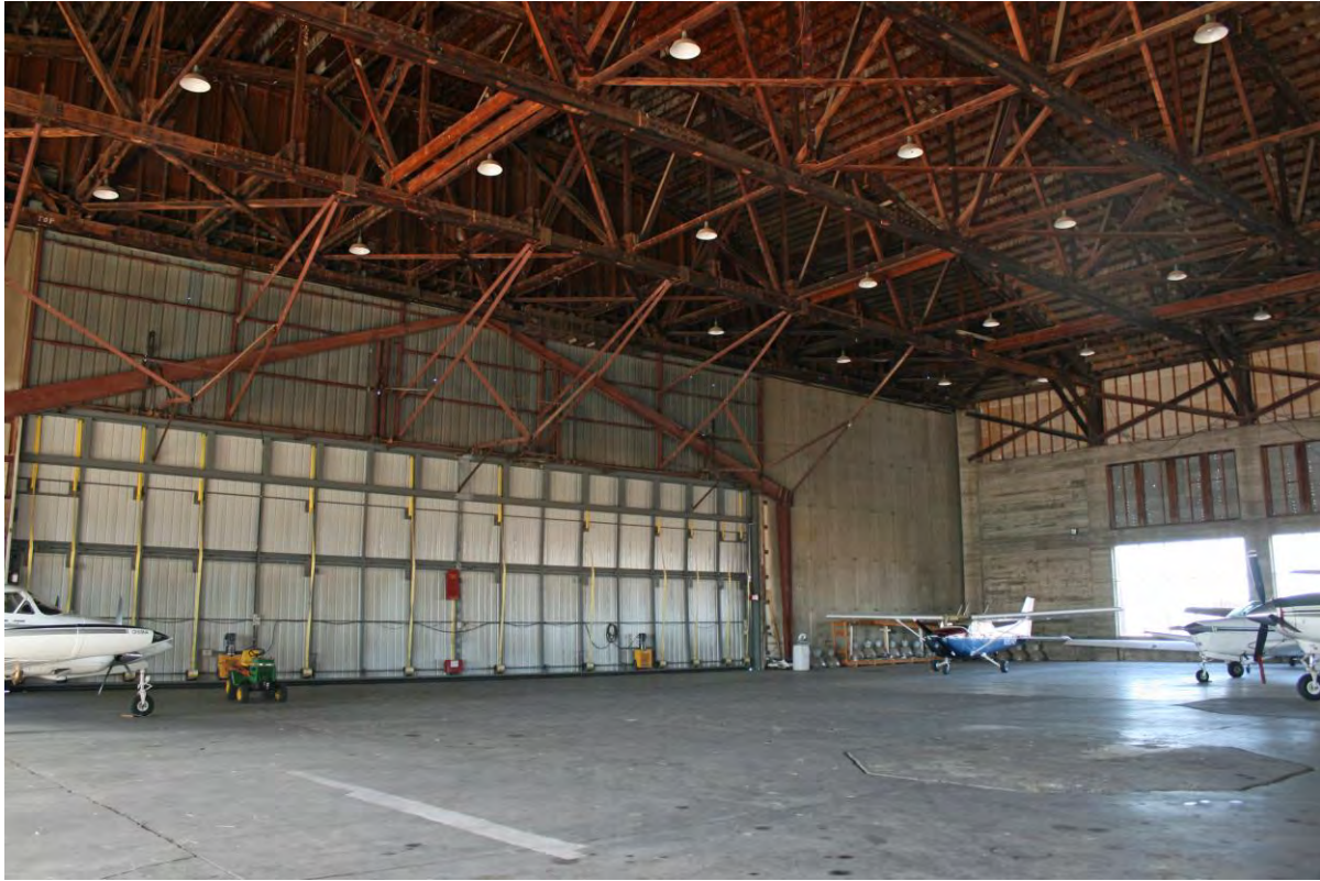
Photograph 6. Interior; camera facing northwest.