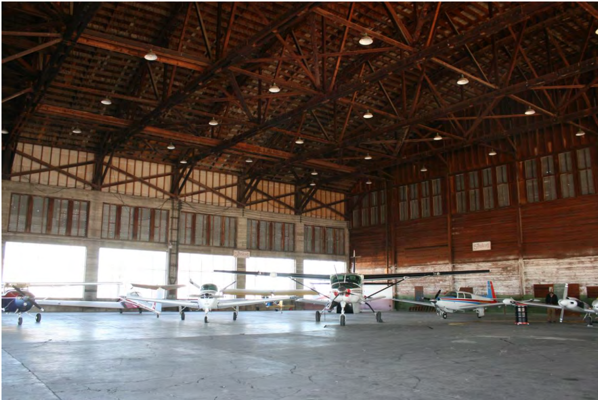
Photograph 5. Interior; camera facing northeast.