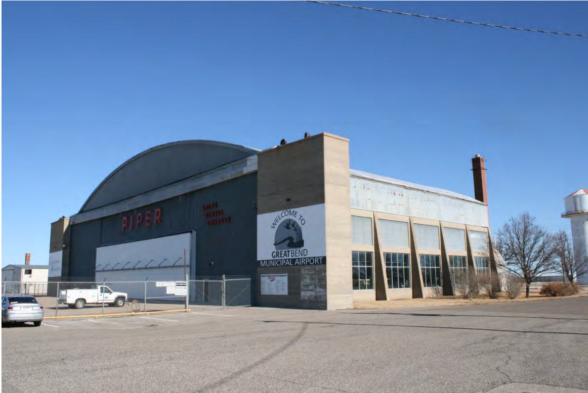
Photograph 2. Southwest elevation; camera facing northeast.