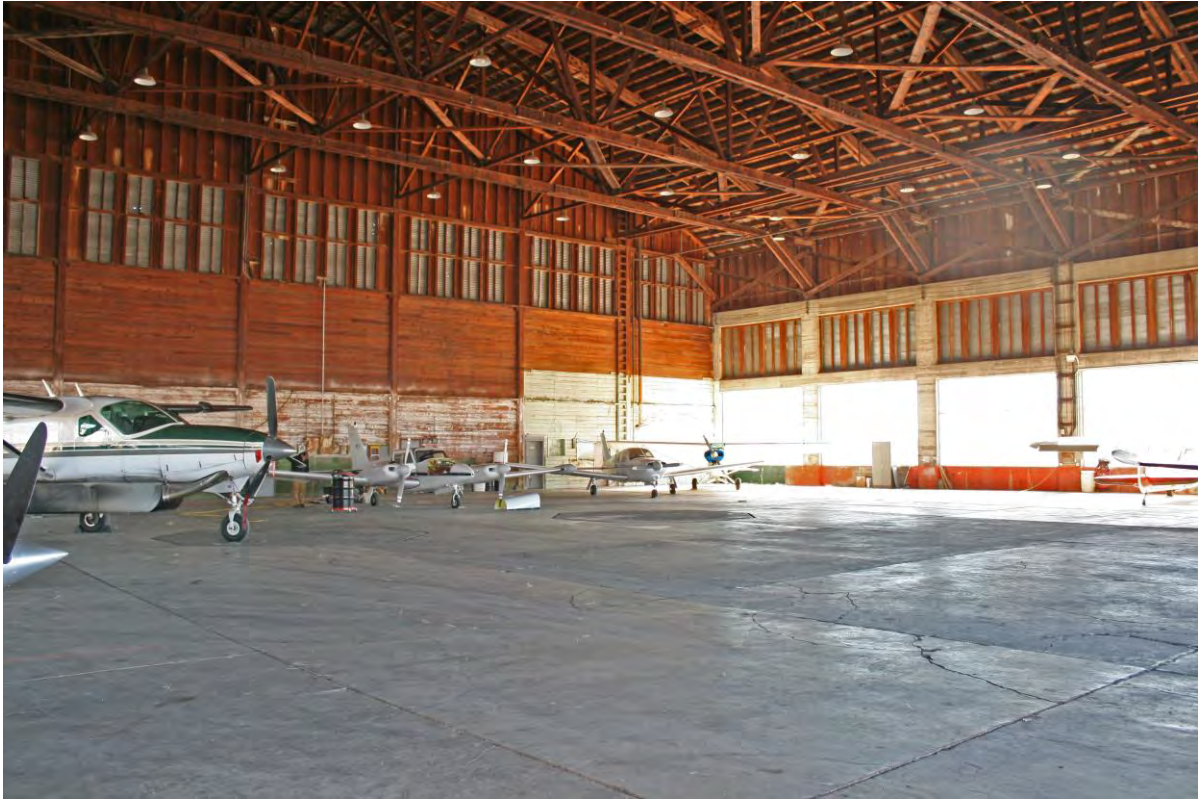
Photograph 4. Interior; camera facing southeast.