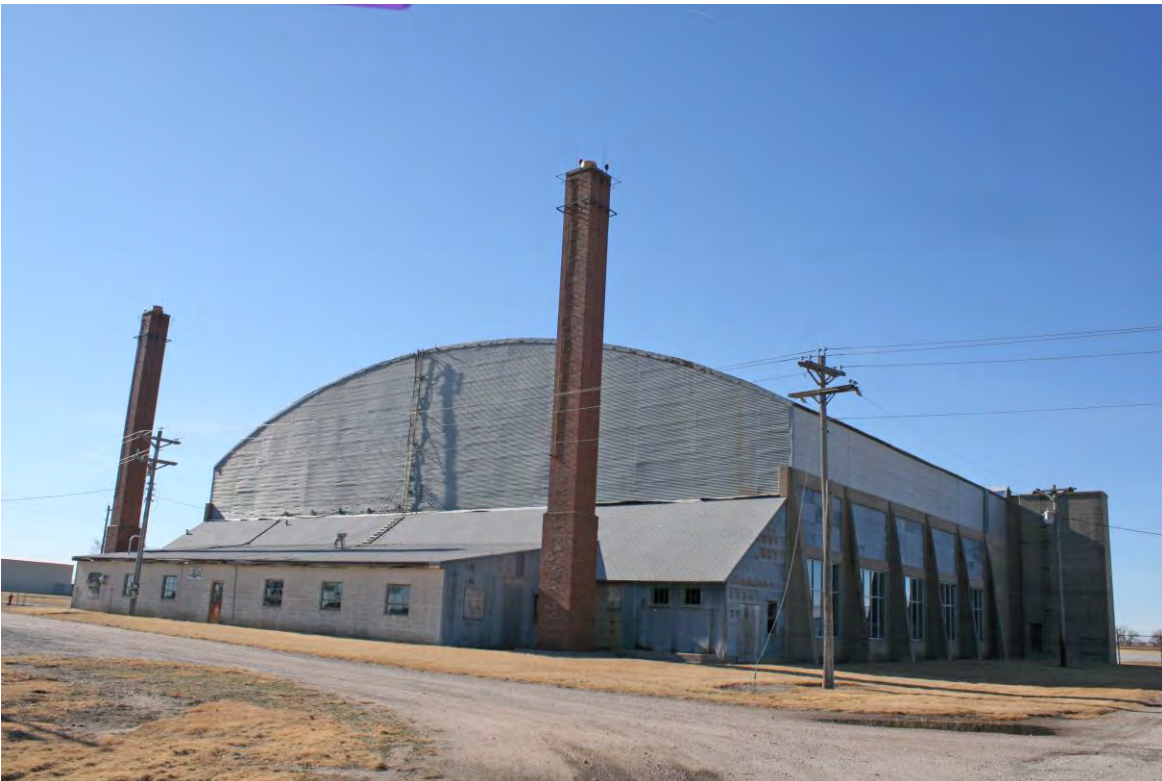
Photograph 3. Northeast elevation; camera facing southwest.