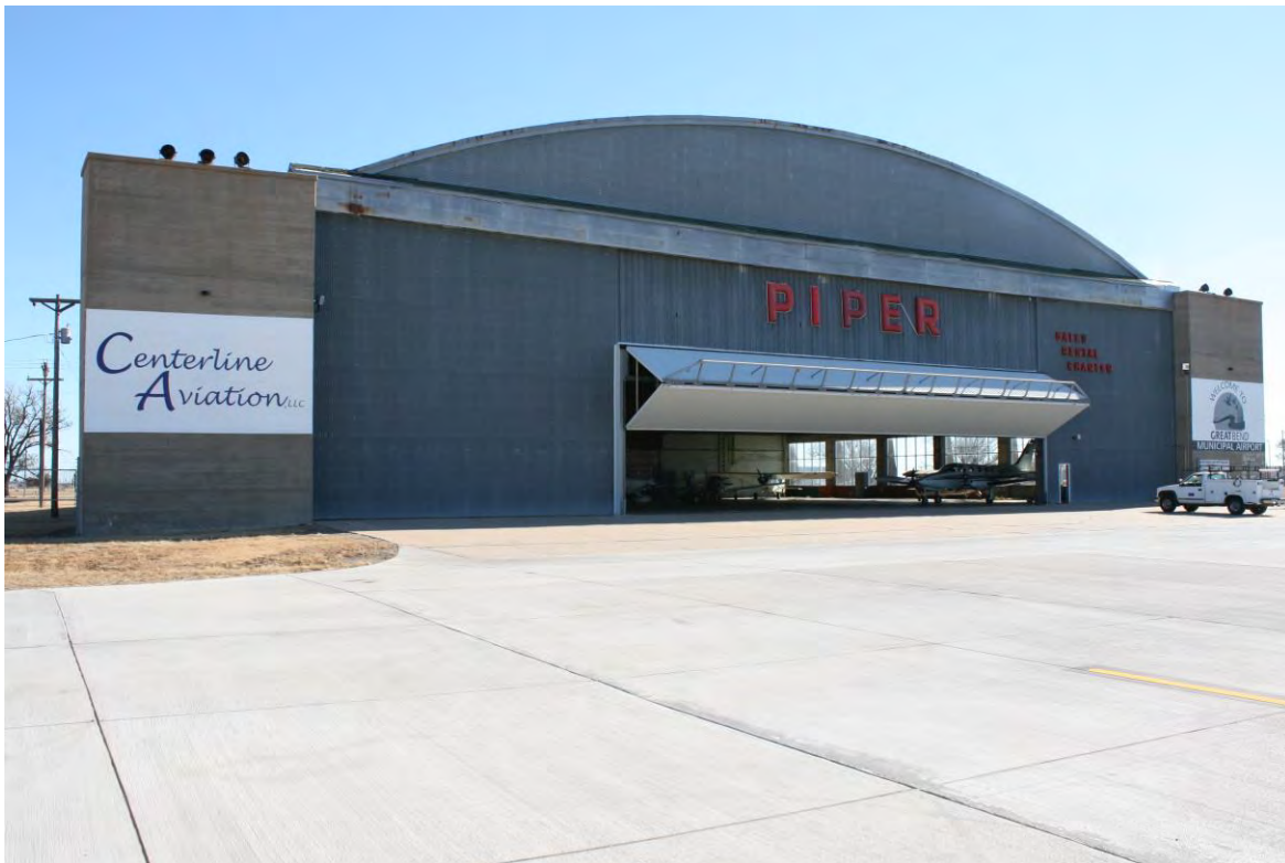
Photograph 1. West façade of hangar; camera facing southeast.