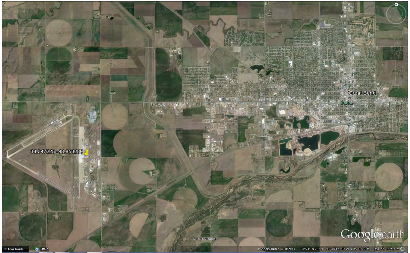
Figure 1: Contextual Aerial Image.