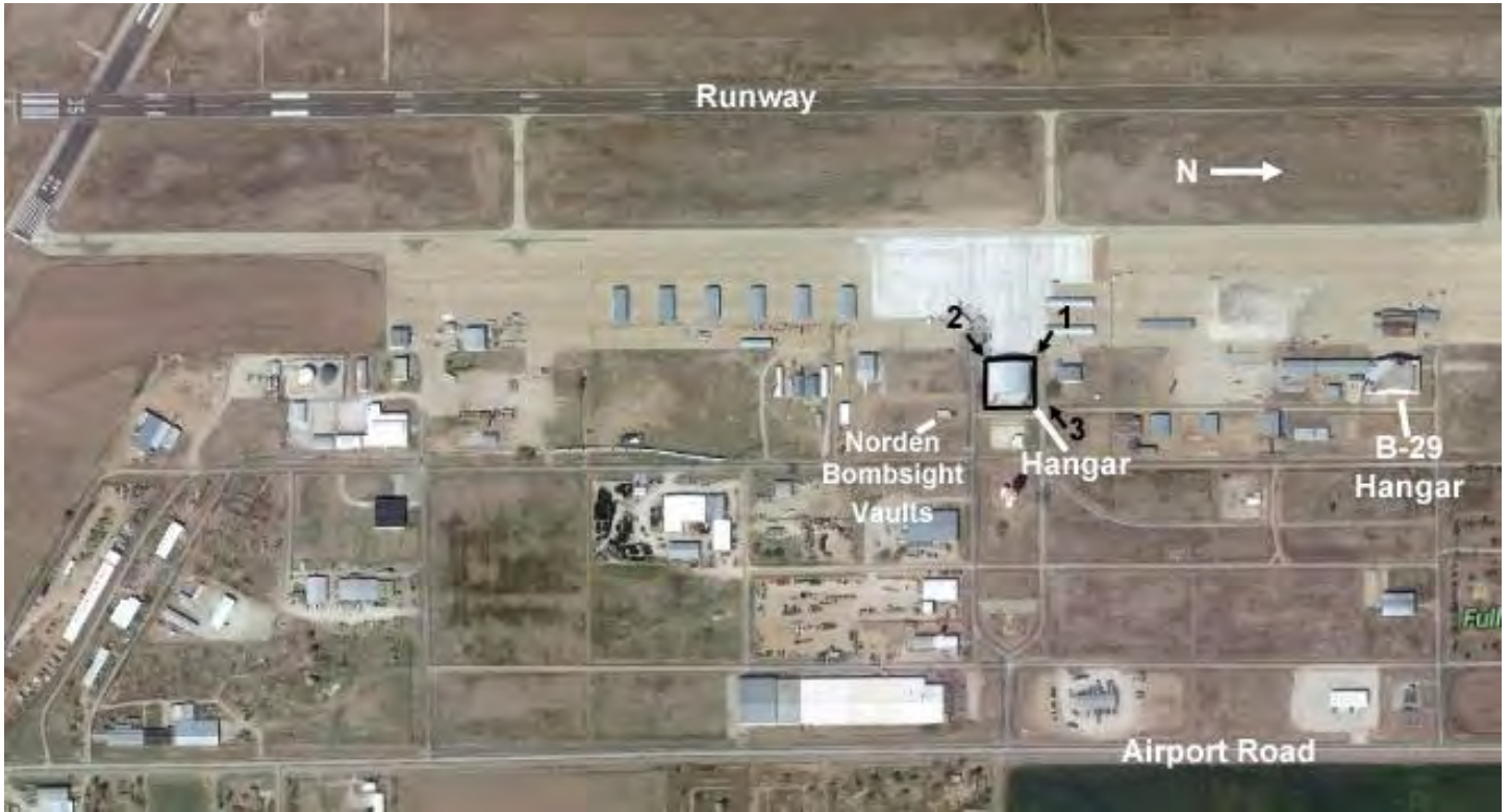
Figure 2. Close-in Aerial Image with photo locations. Photos 4, 5 & 6 are interior shots. (Google Maps accessed January 2015; coordinates 38.347223, -98.853280.)