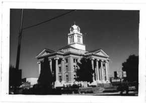
UPSON COUNTY COURTHOUSE