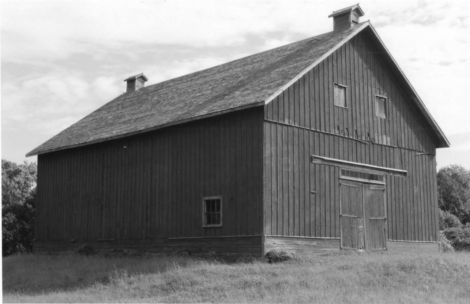
DAIRY BUILDING, GRANARY/ROOT CELLAR and auxiliary buildings, NORTH OAKS FARM.