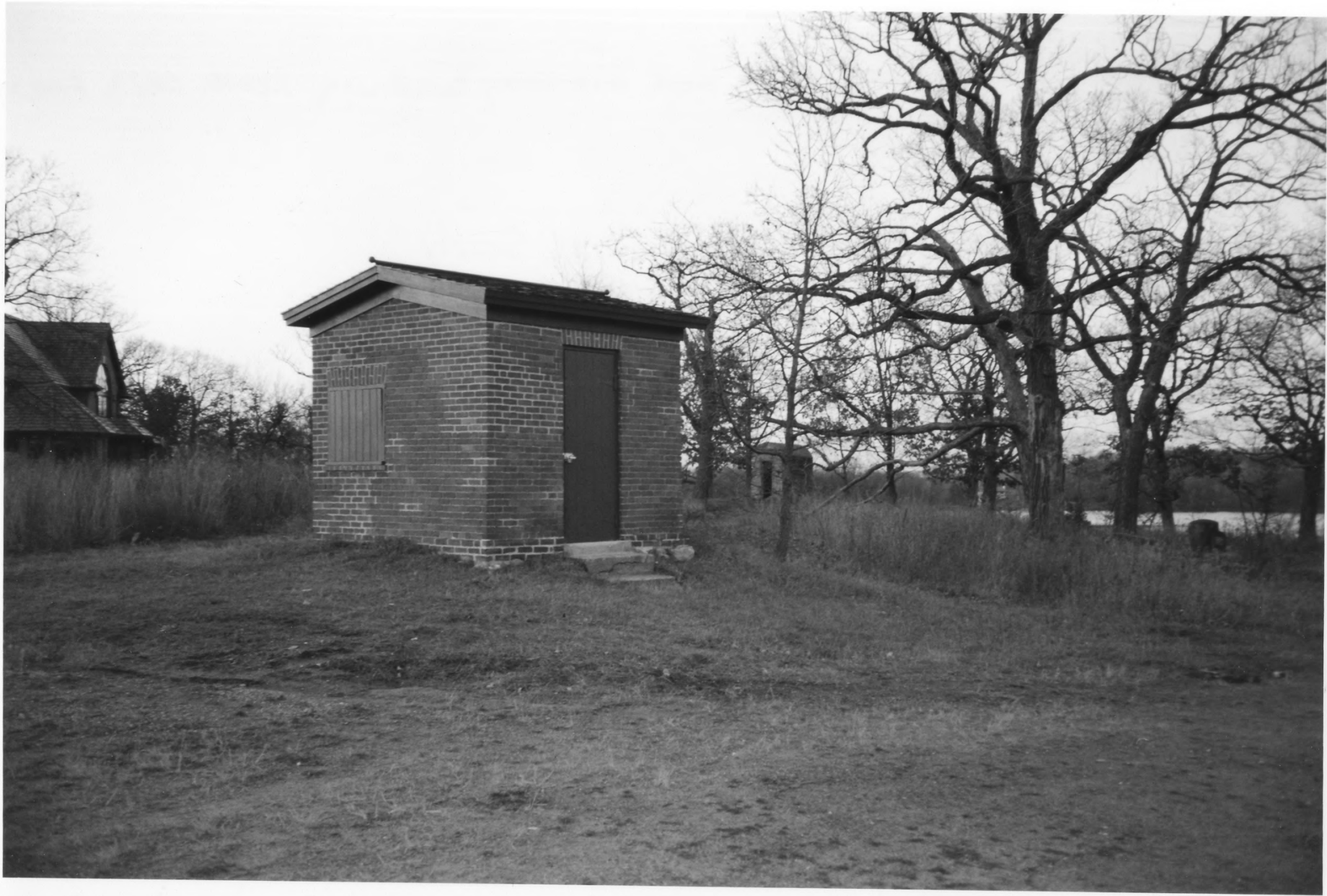
DAIRY BUILDING, GRANARY/ROOT CELLAR and auxiliary buildings, NORTH OAKS FARM