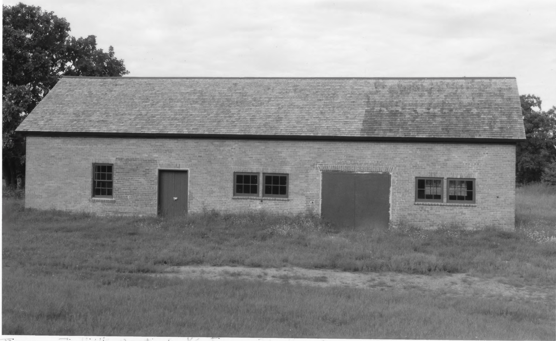
DAIRY BUILDING, GRANARY/ROOT CELLAR and auxiliary buildings, NORTH OAKS FARM