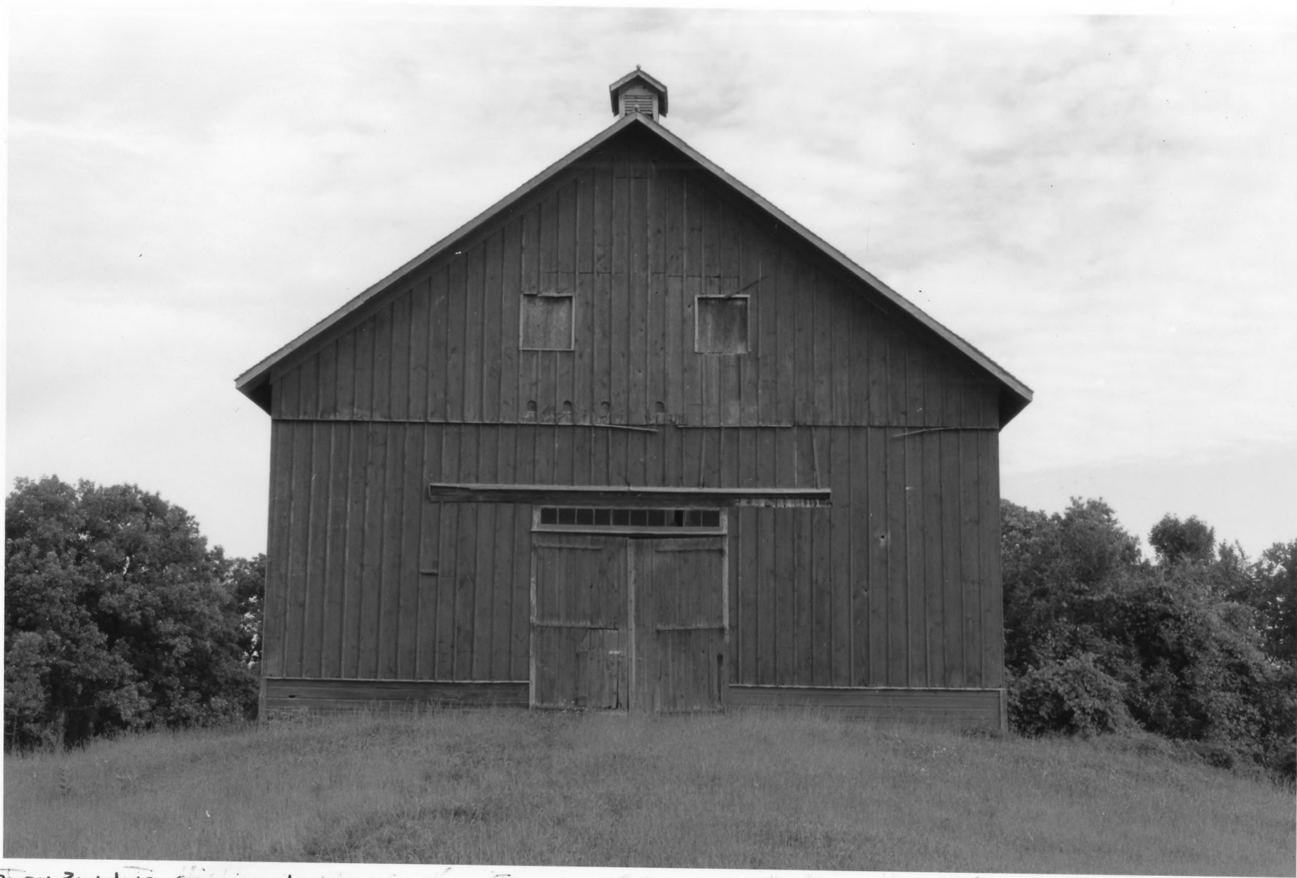
Dairy Building, Granary/Root Cellar and auxiliary buildings, North Oakes Farm