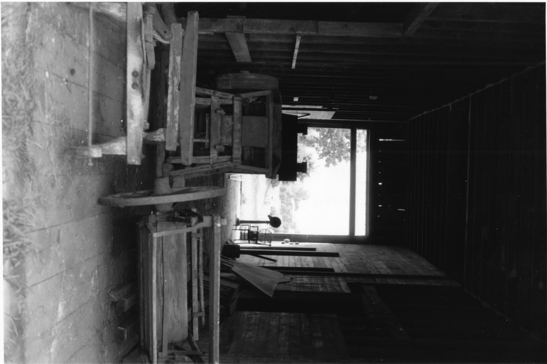
DAIRY BUILDING, GRANARY/Root Cellar and auxiliary buildings, North OAKS FARM Cellar