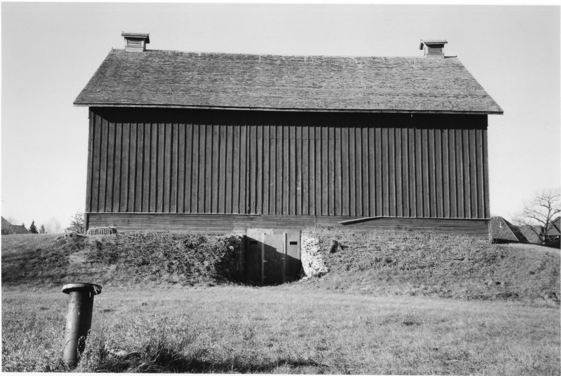
DAIRY Building, GRANARY/Root Cellar and auxiliary buildings, NORTH OAKS FARM NORTH OAKS RAMSEY CO., MN