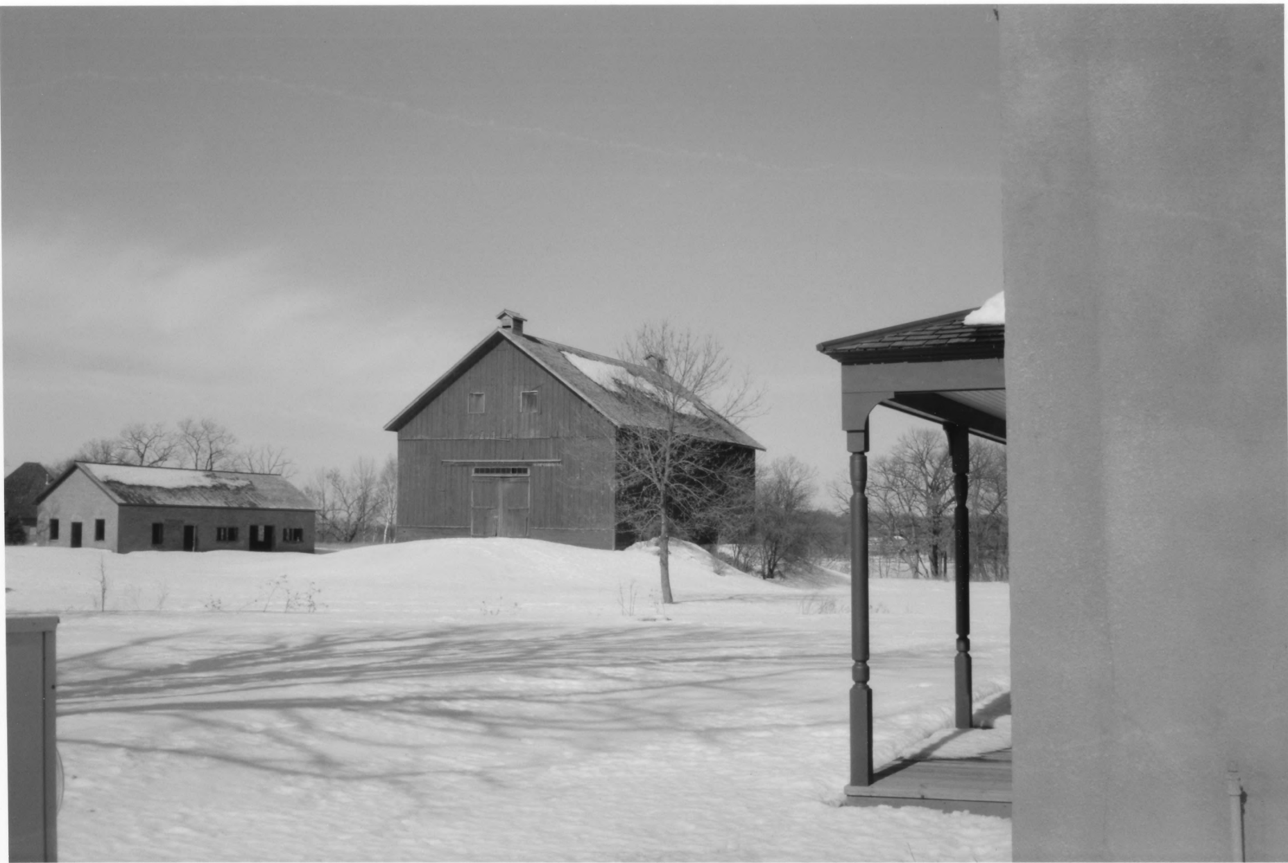
DAIRY BUILDING, GRANARY/ROOT CELLAR and auxiliary buildings, NORTH OAKS FARM NORTH OAKS RAMSEY CO., MN