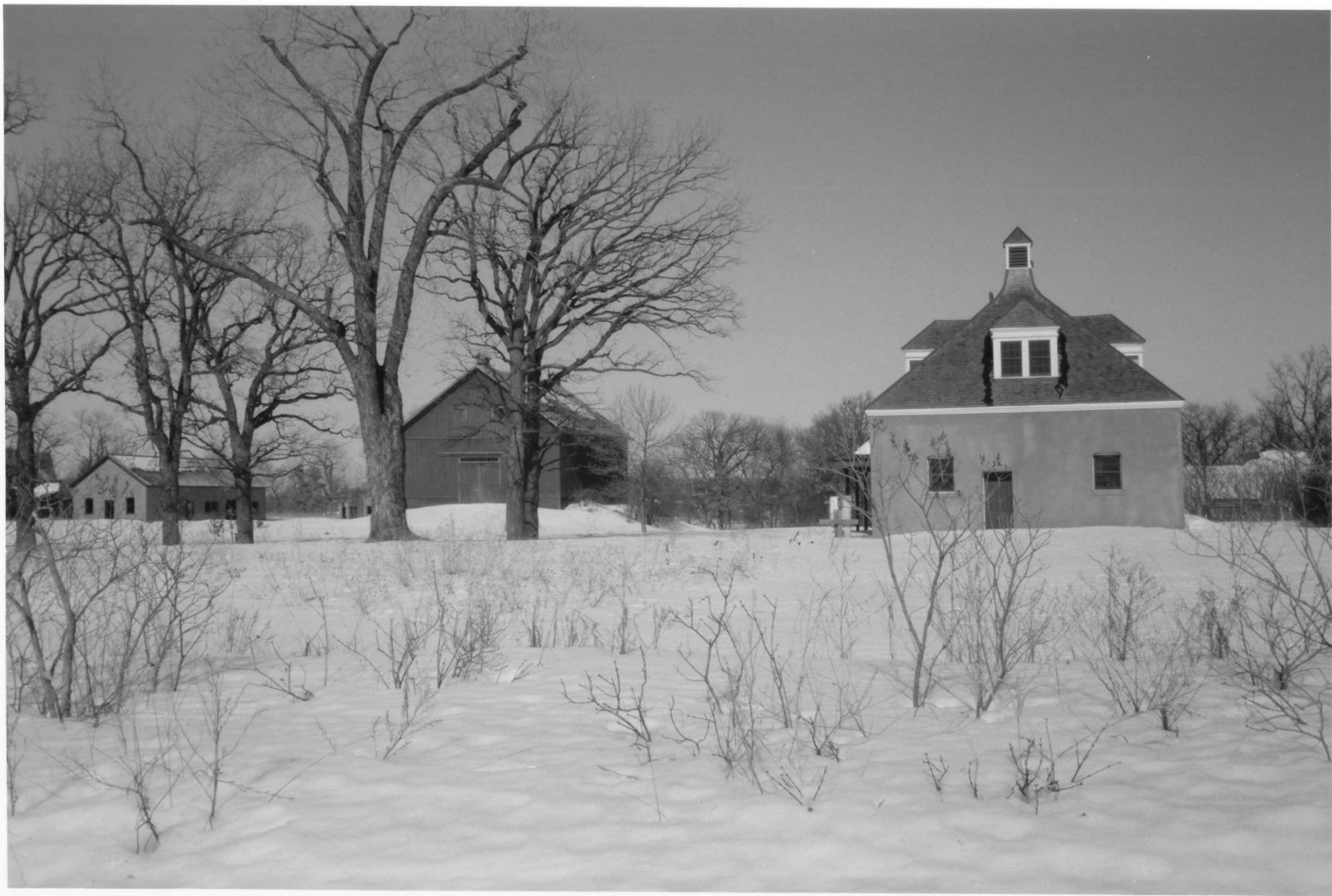
DAIRY BUILDING, GRANARY/ROOT CELLAR and auxiliary buildings, NORTH OAKS FARM NORTH OAKS Ramsey Co., MN