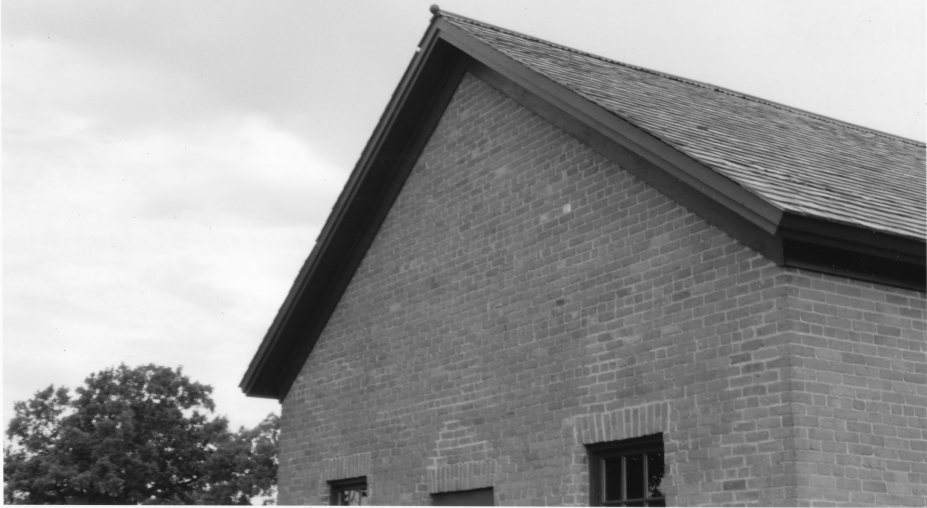
DAIRY BUILDING, GRANARY/Root Cellar and auxiliary buildings, North OAKS FARM and Shop