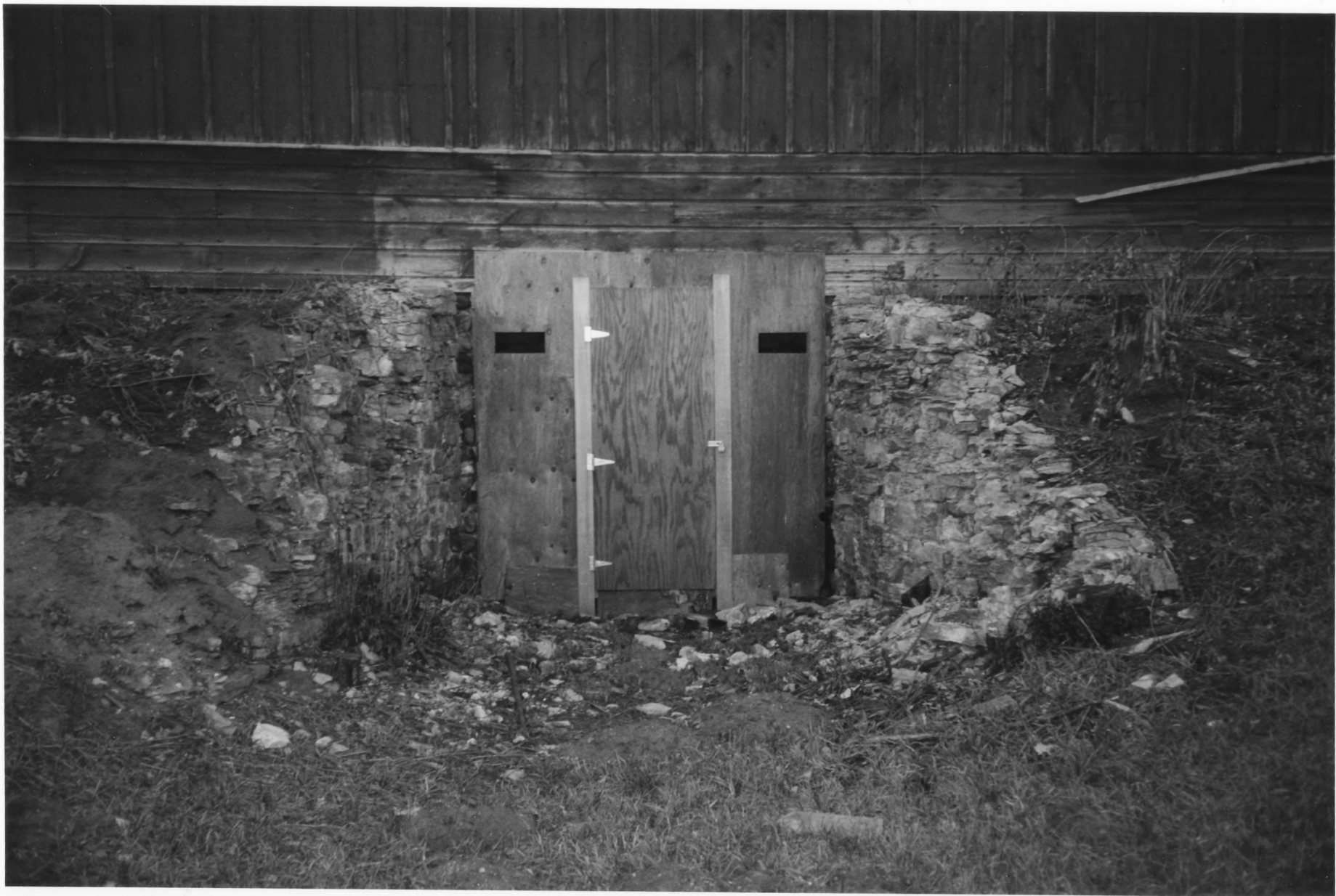
DAIRY BUILDING, GRANARY/ROOT CELLAR and auxiliary buildings, NORTH OAKS FARM NORTH OAKS RAMSEY CO., MN