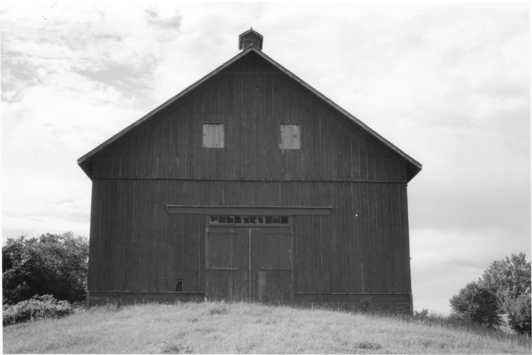
DAIRY BUILDING, GRANARY, ROOT CELLAR and auxiliary buildings, NORTH OAKS FARM