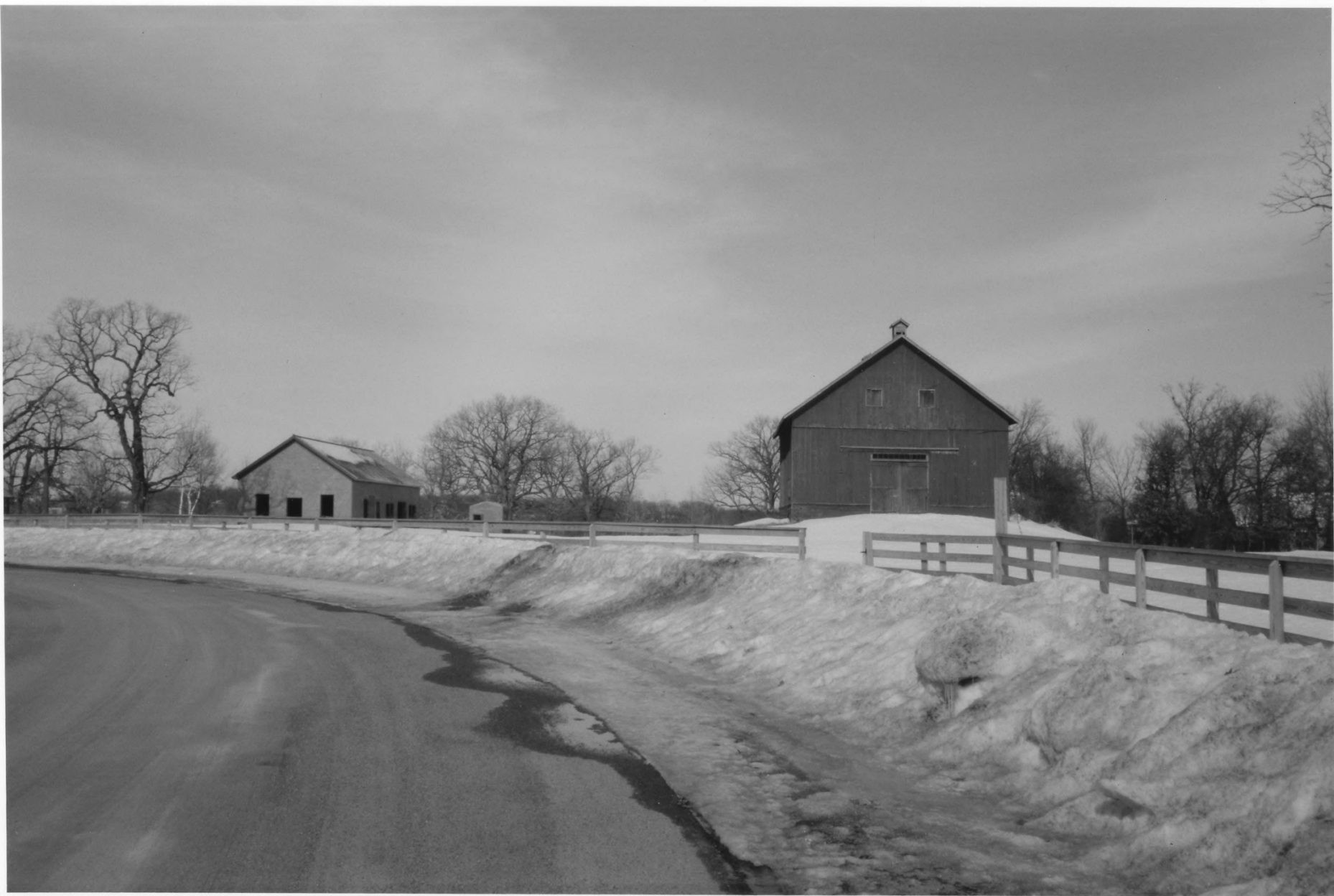
DAIRY BUILDING, GRANARY/ROOT CELLAR and auxiliary buildings, NORTH OAKS FARM