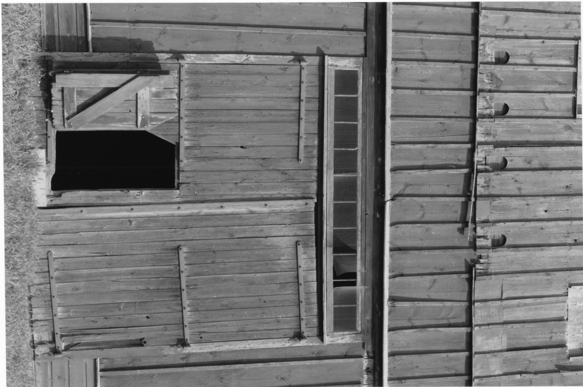
Dairy Building, GRANARY/Root Cellar and auxiliary buildings, NORTH OAKS FARM