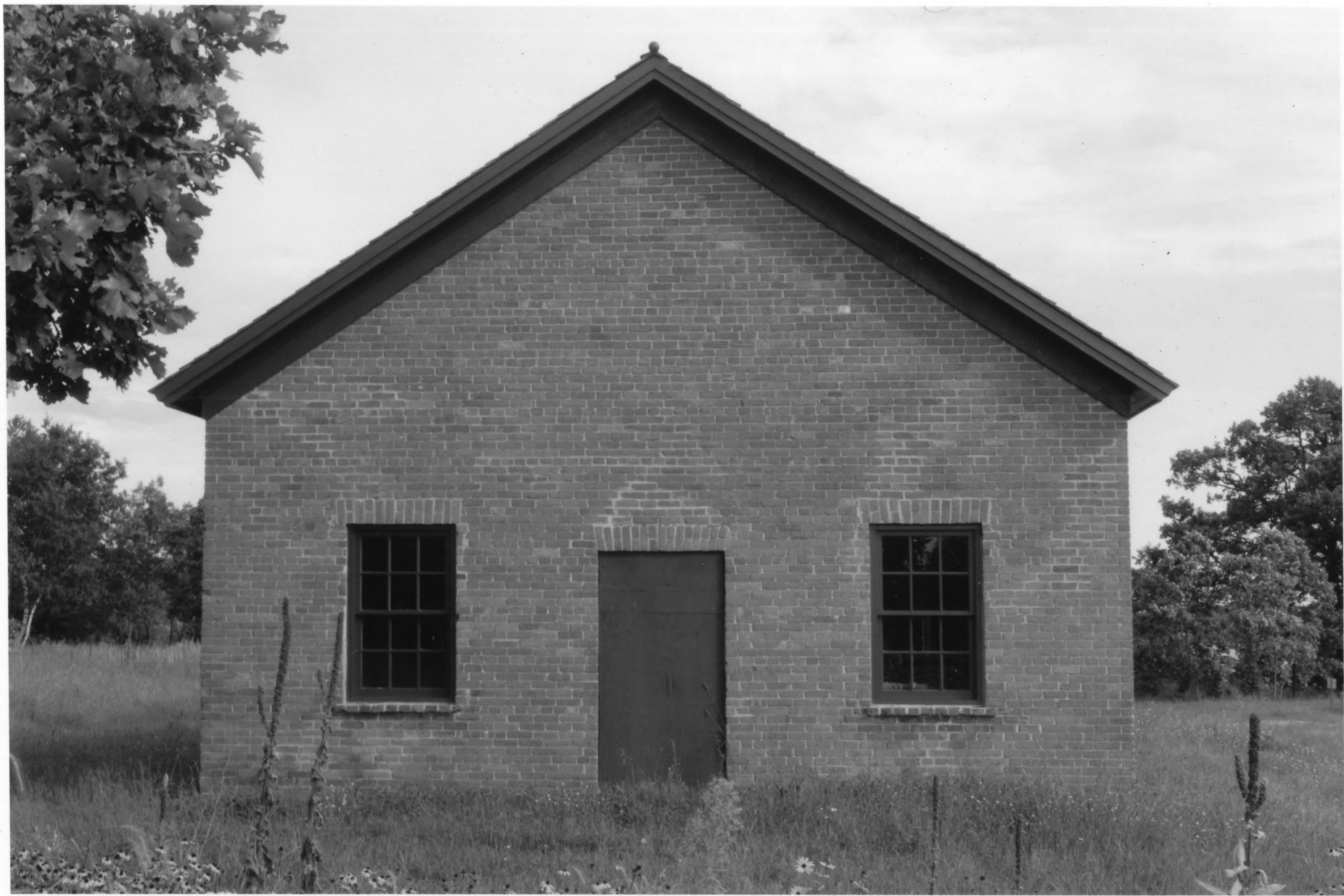
DAIRY Building, GRANARY, Root Cellar and auxiliary buildings, NORTH OAKS FARM, NORTH OAKS Ramsey CO., MN 013270-12