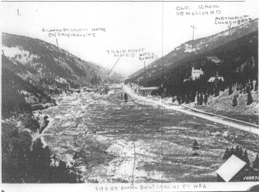
Historic Neihart, undated