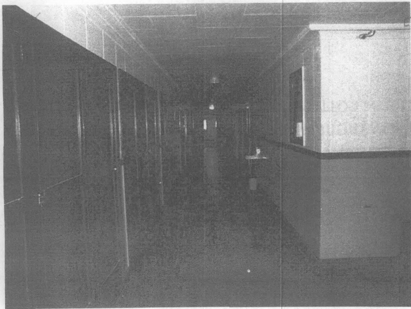
Interior Hall, 2002