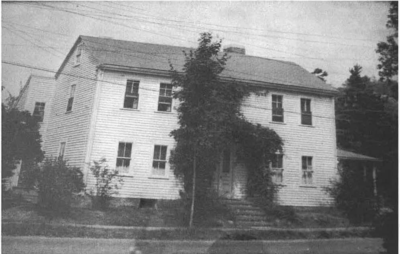
Figure 1 Oliver House, ca. 1900

Paperwork Reduction Act Statement: This information is being collected for applications to the National Register of Historic Places to nominate properties for listing or determine eligibility for listing, to list properties, and to amend existing listings. Response to this request is required to obtain a benefit in accordance with the National Historic Preservation Act, as amended (16 U.S.C. 460 et seq.).