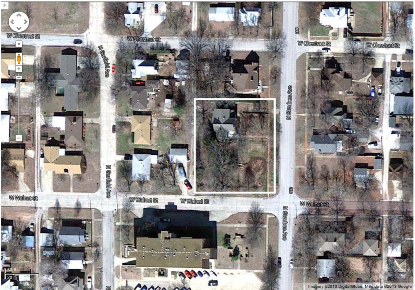
Figure 2: Aerial Image, Google.com (2013)

Truitt House 305 North Steuben Avenue Chanute, Neosho County, KS Latitude / Longitude: 37.684647 / -95.456855 Datum: WGS84