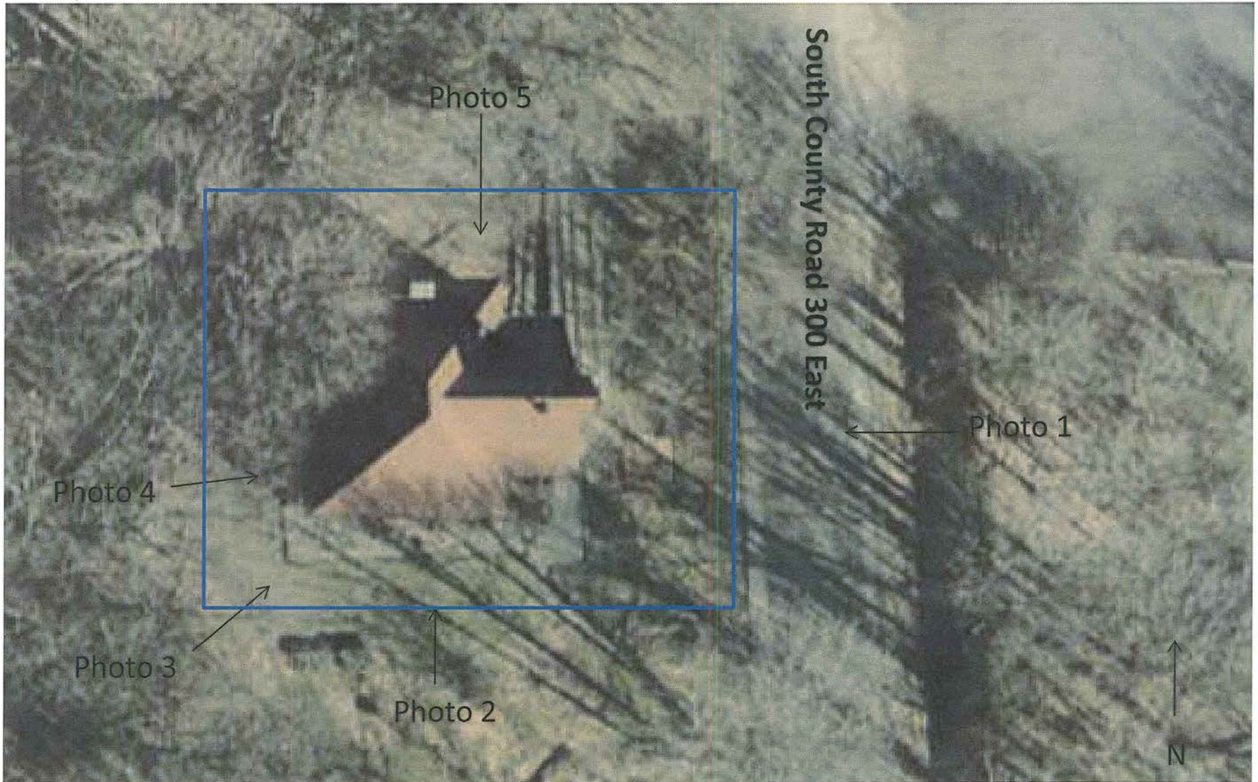
Stanley Schoolhouse Albion, Noble County, Indiana