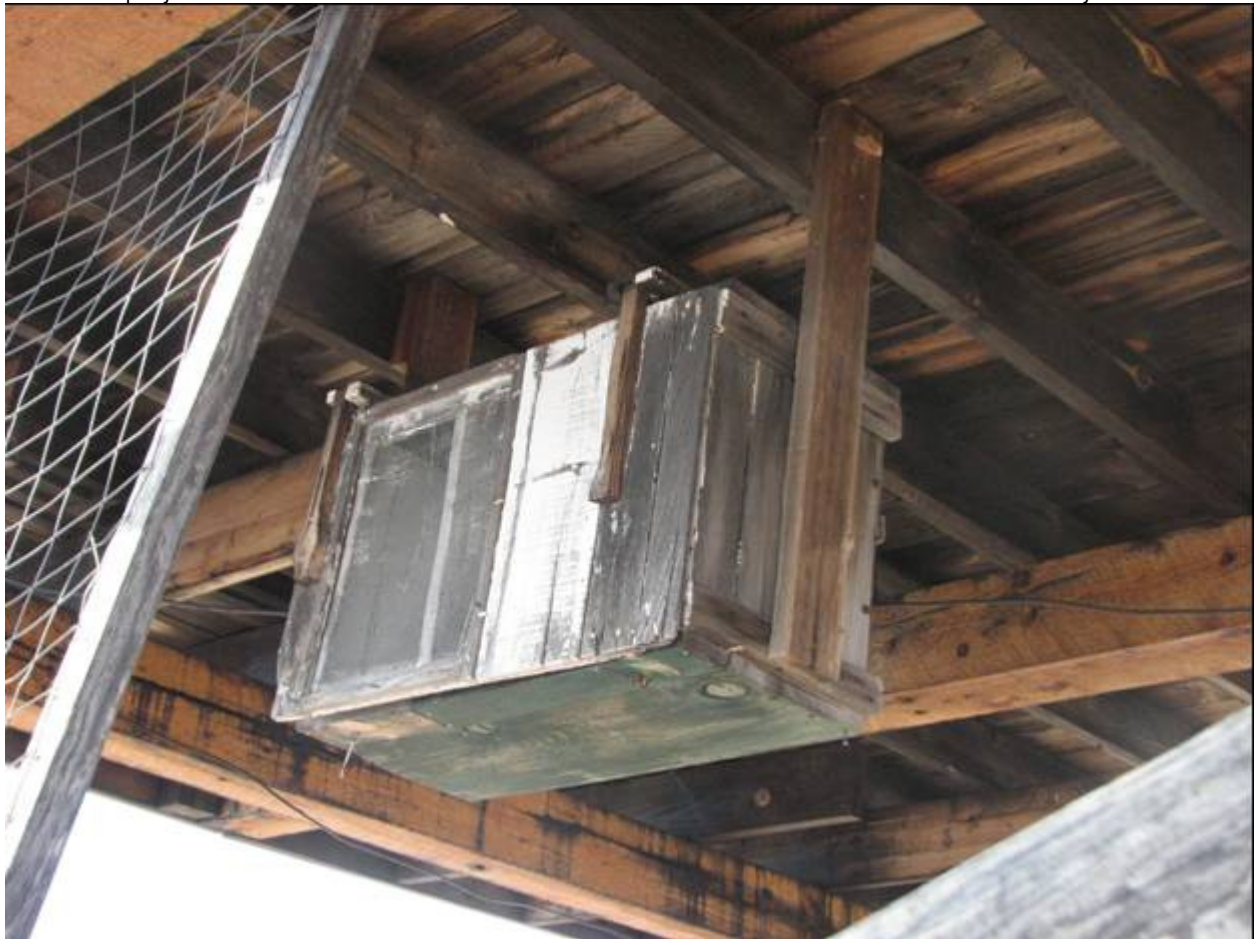
MT_RavalliCounty_GirdPointLookout_0005. Wood storage box suspended from the base of the lookout.

Ravalli County, Montana County and State