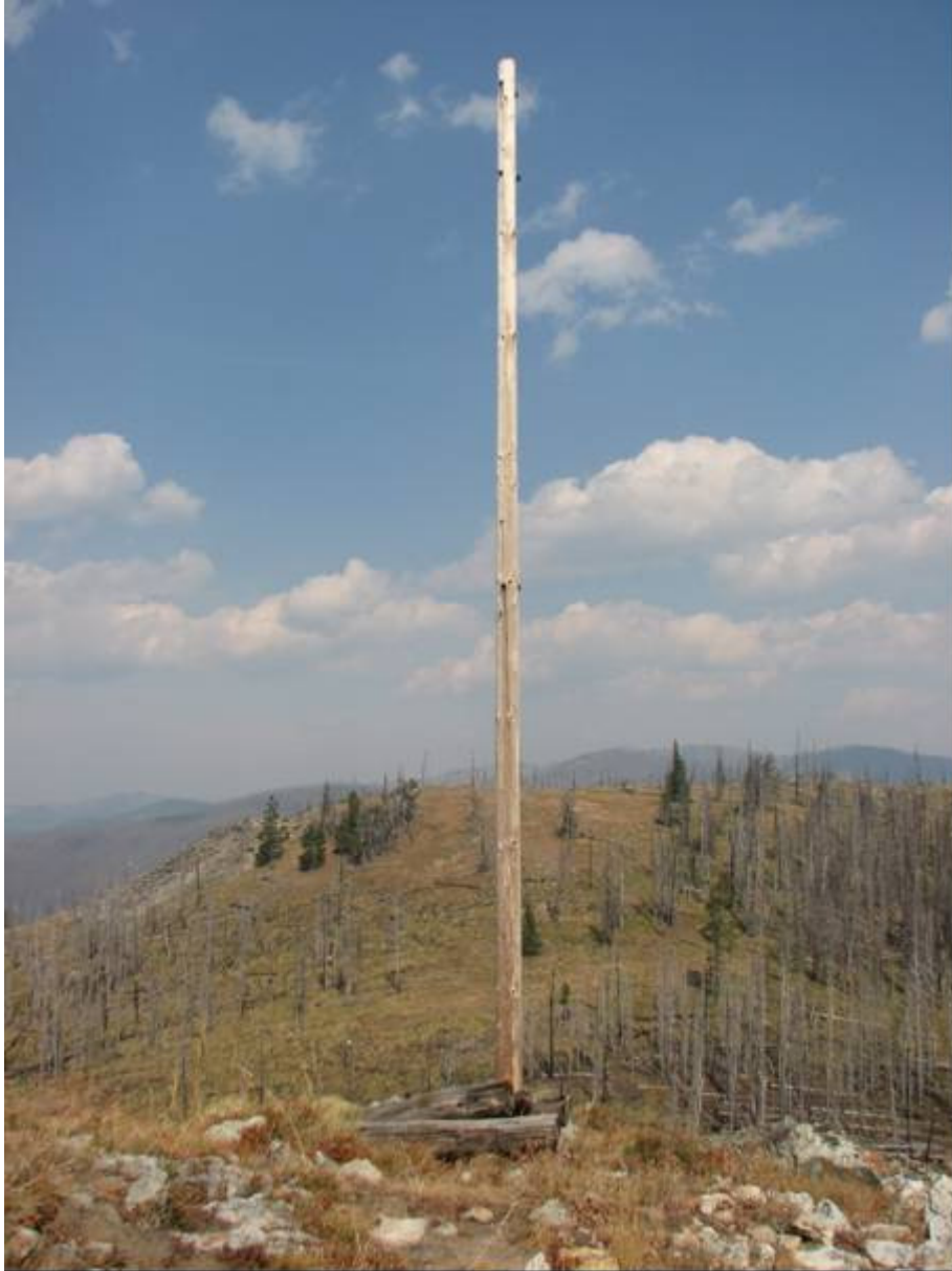
MT_RavalliCounty_GirdPointLookout_0011. Looking northeast to the communications pole.

Ravalli County, Montana County and State