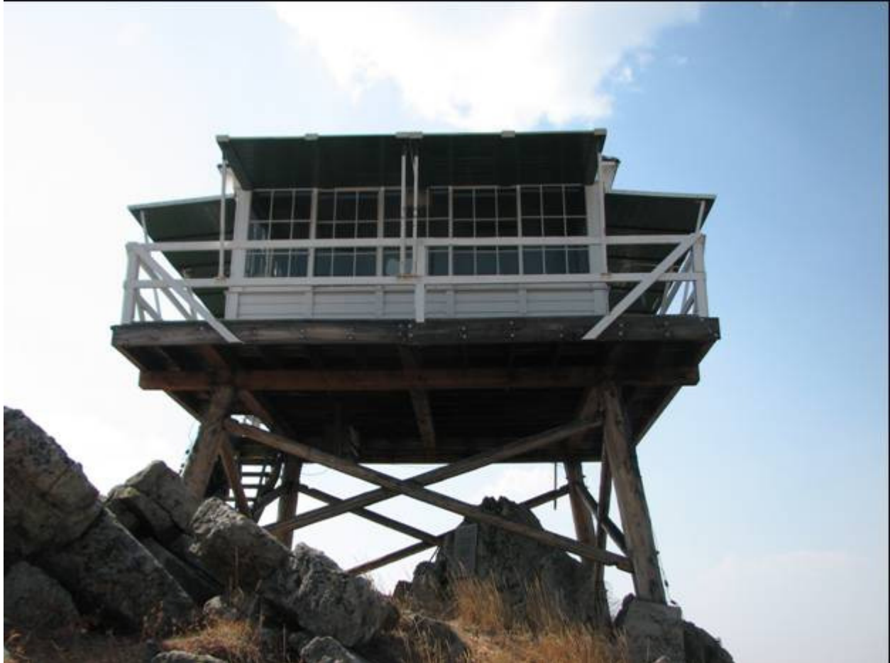
MT_RavalliCounty_GirdPointLookout_0002. Looking southwest to the northeast wall of the lookout.

Ravalli County, Montana County and State