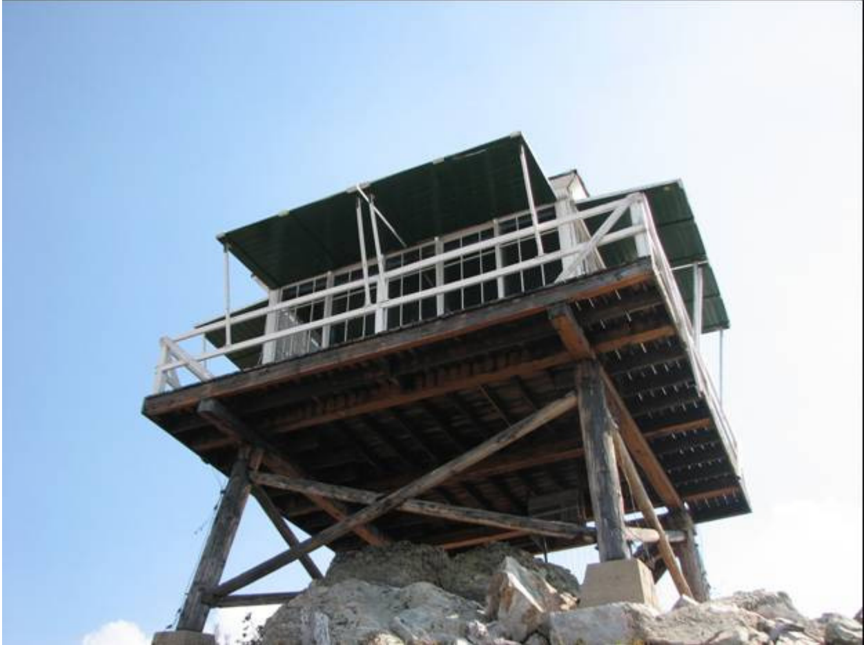
MT_RavalliCounty_GirdPointLookout_0003. Looking southeast at the northwest wall of the lookout.

Ravalli County, Montana County and State