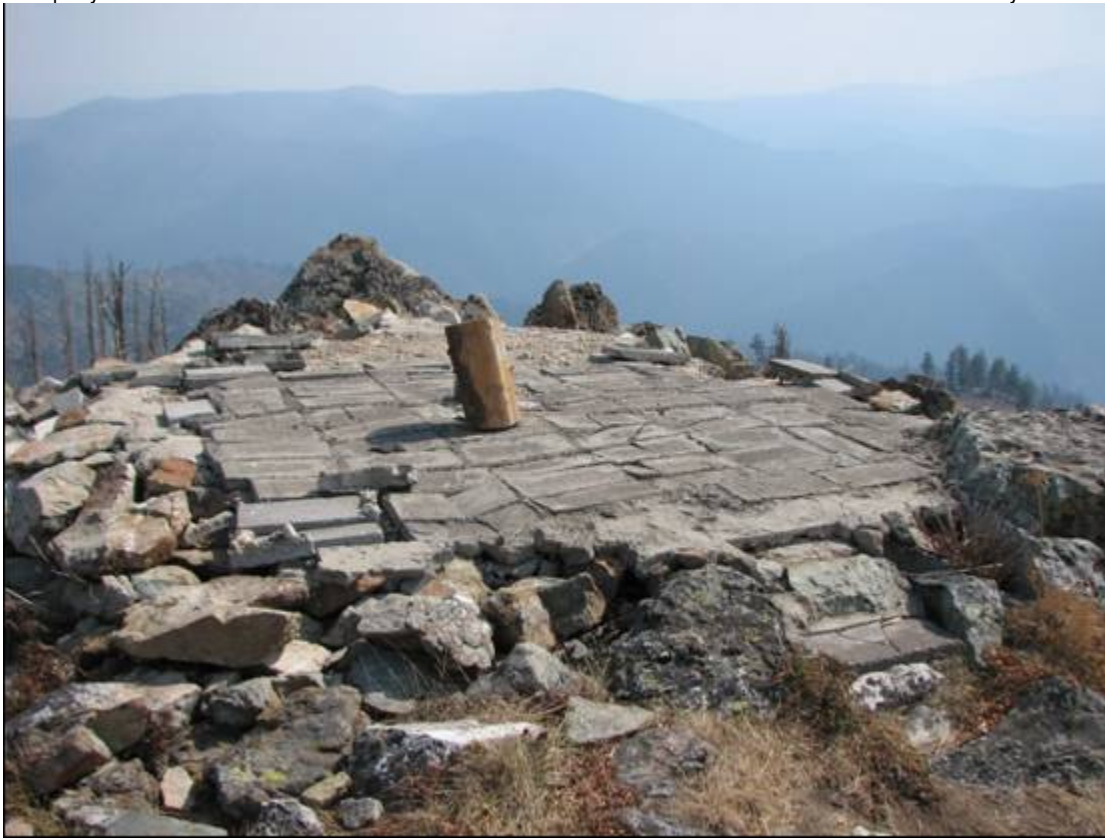
MT_RavalliCounty_GirdPointLookout_0012. Looking southeast over the helipad.

Ravalli County, Montana County and State