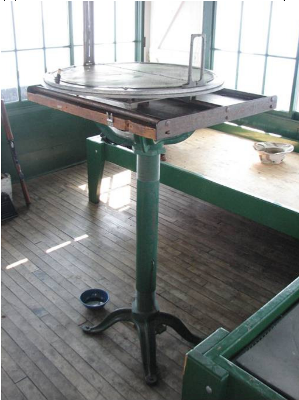
MT_RavalliCounty_GirdPointLookout_0008. Interior showing platform bed frames and fire-finder stand.

Ravalli County, Montana County and State