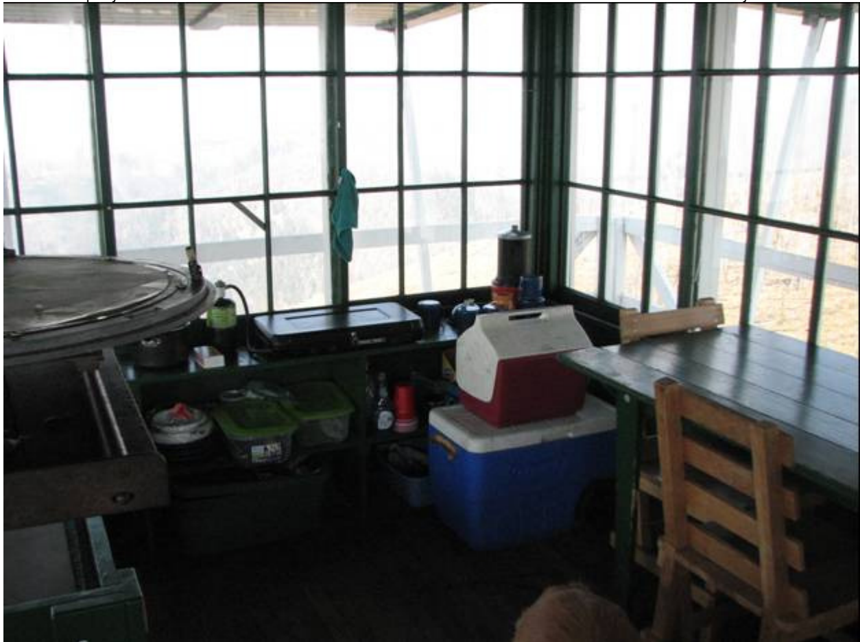
MT_RavalliCounty_GirdPointLookout_0007. Interior, showing table and shelves.

Ravalli County, Montana County and State