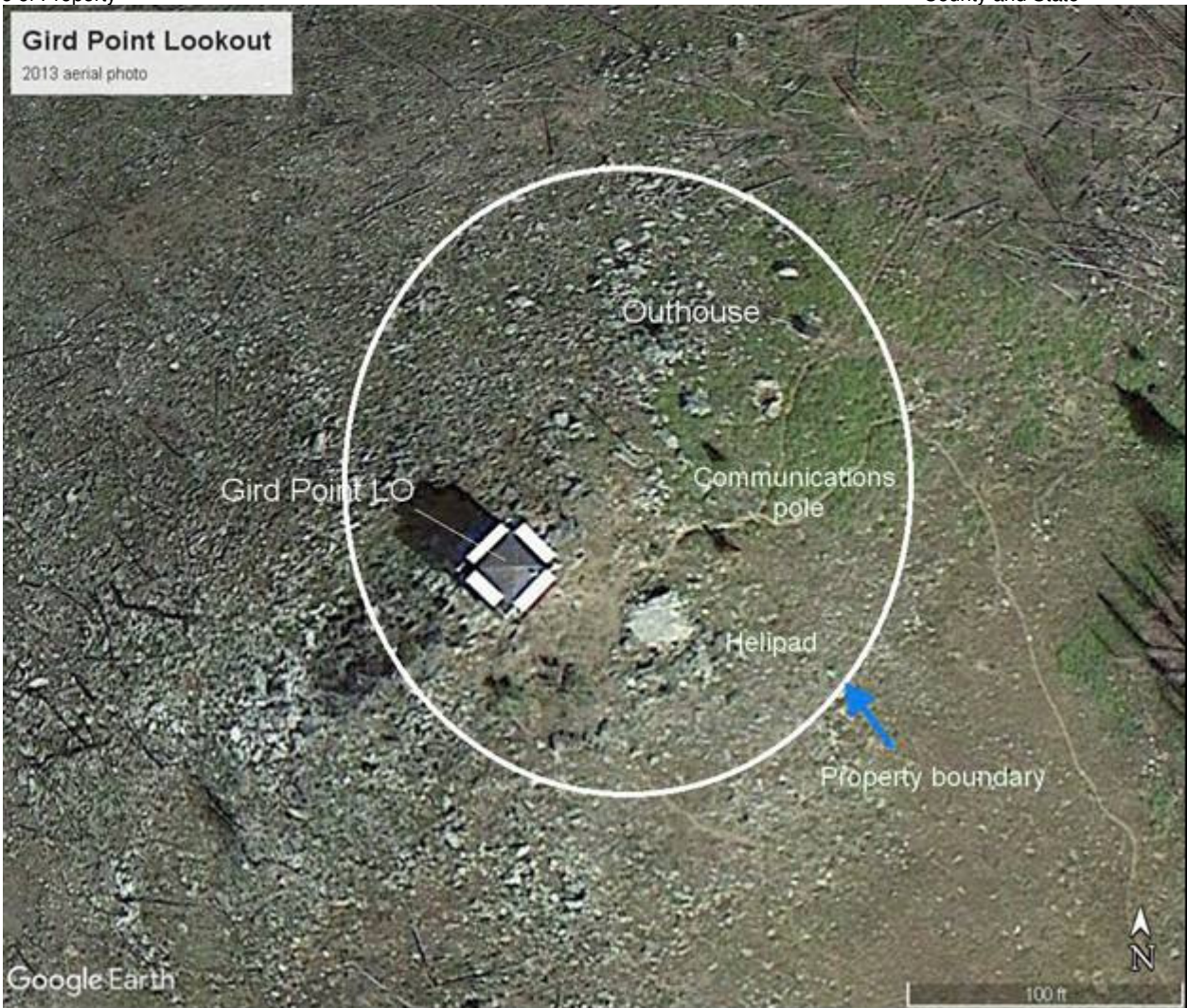
Gird Point Lookout site plan, 2013 aerial photo.

Ravalli County, Montana County and State