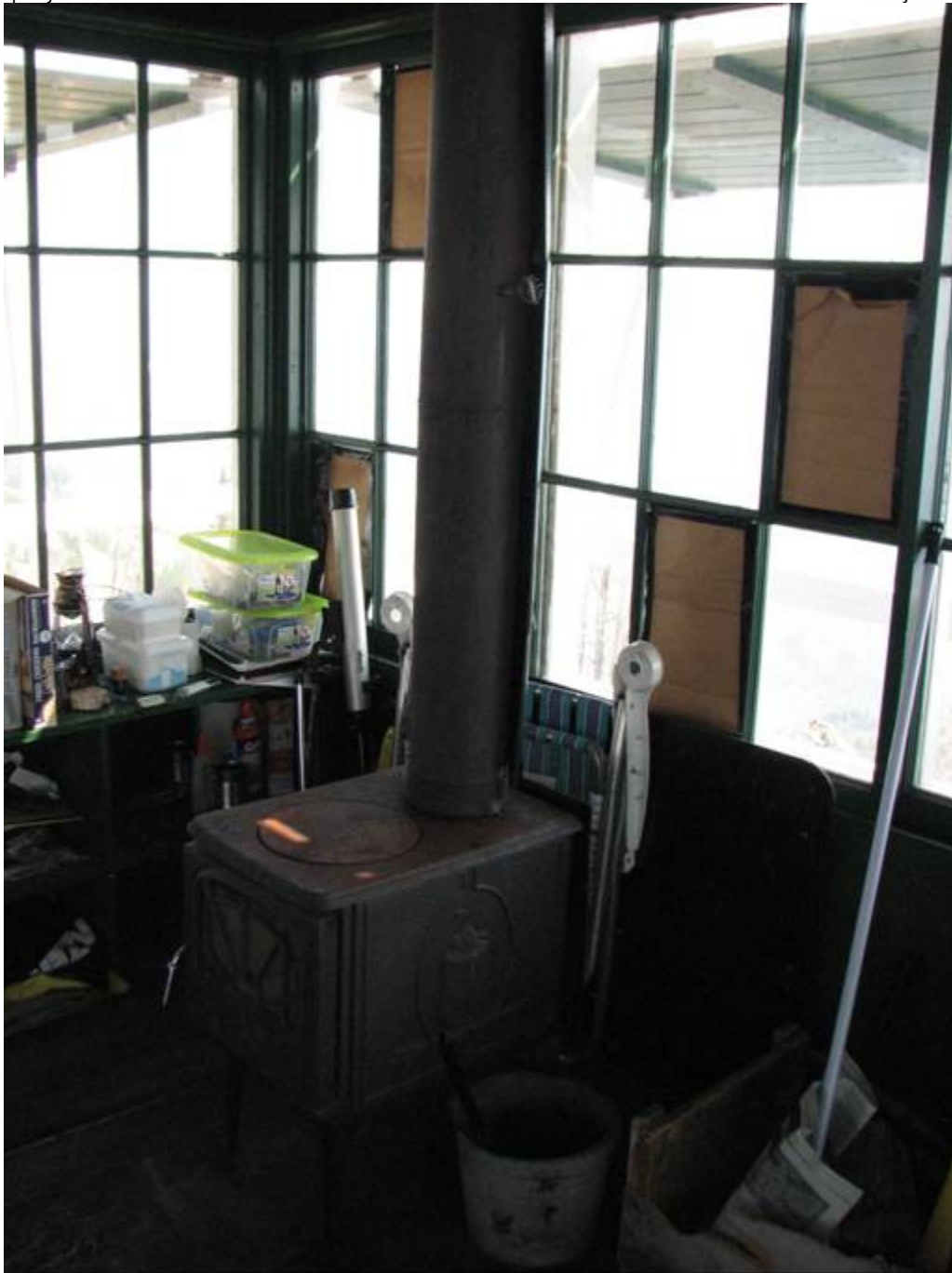
MT_RavalliCounty_GirdPointLookout_0009. Interior: wood stove.

Ravalli County, Montana County and State