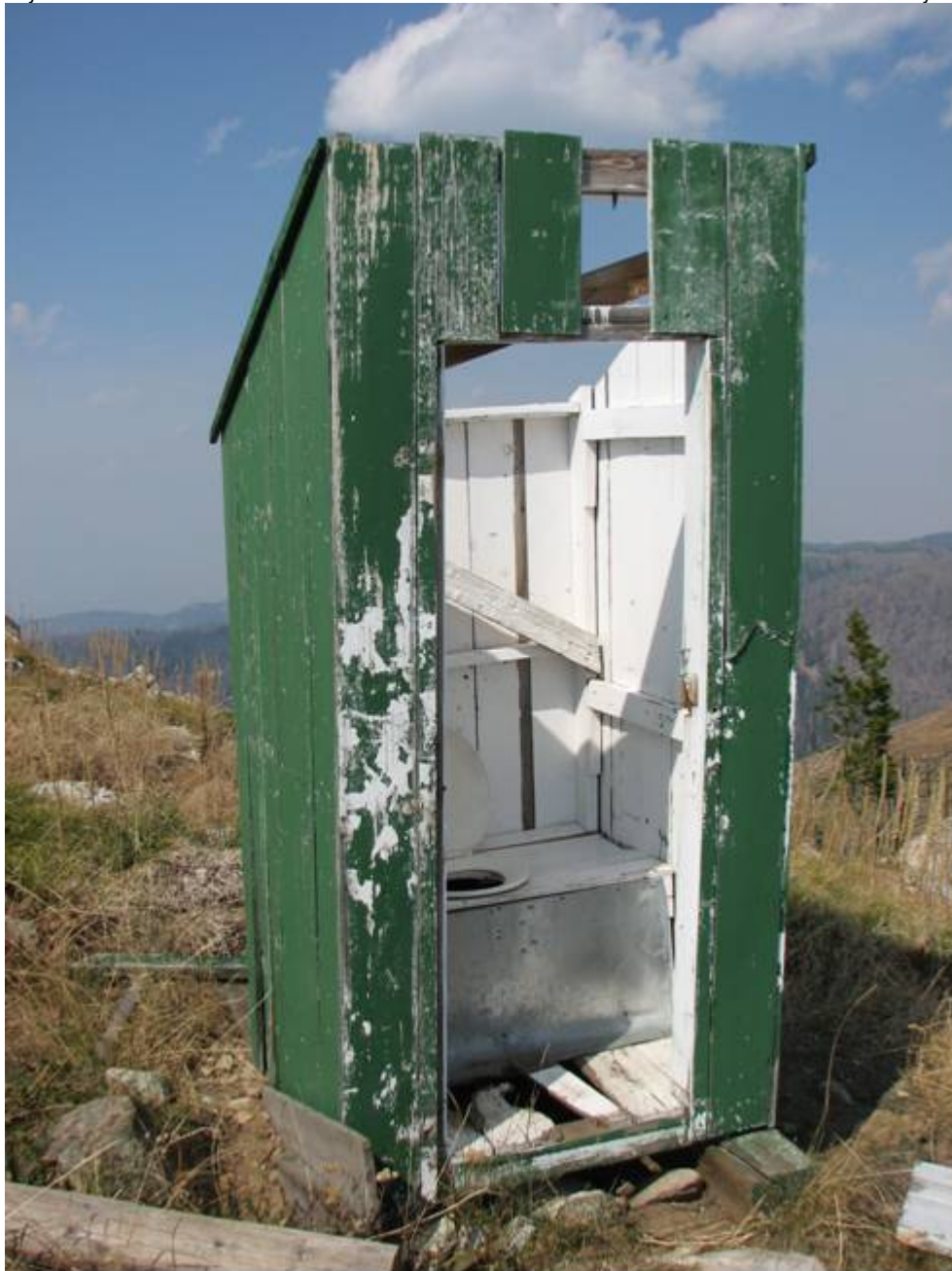
MT_RavalliCounty_GirdPointLookout_0010. Looking west to the south and east sides of the outhouse.

Ravalli County, Montana County and State