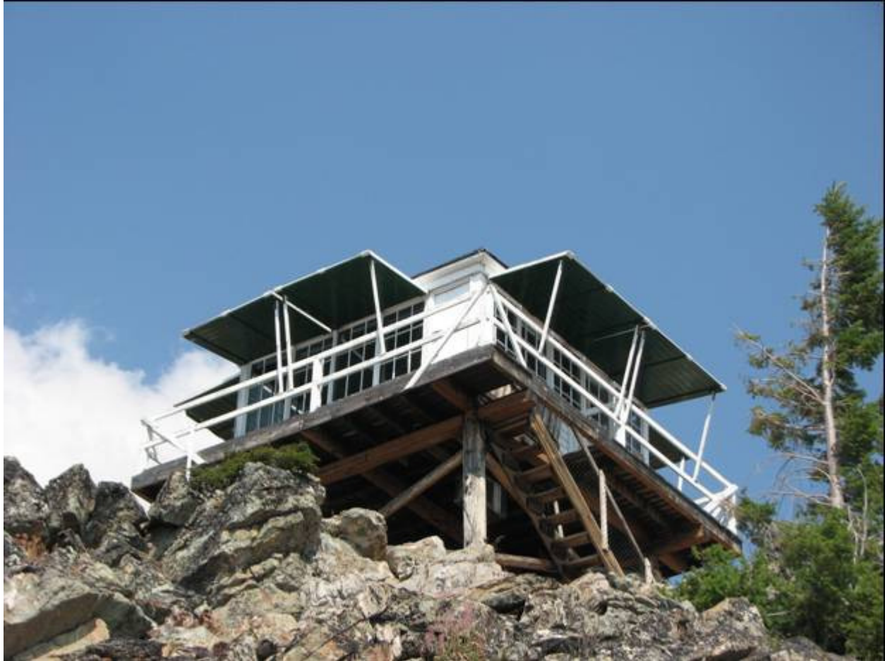
MT_RavalliCounty_GirdPointLookout_0001. Looking north to the southwest (front) and southeast sides of Gird Point Lookout.

Ravalli County, Montana County and State