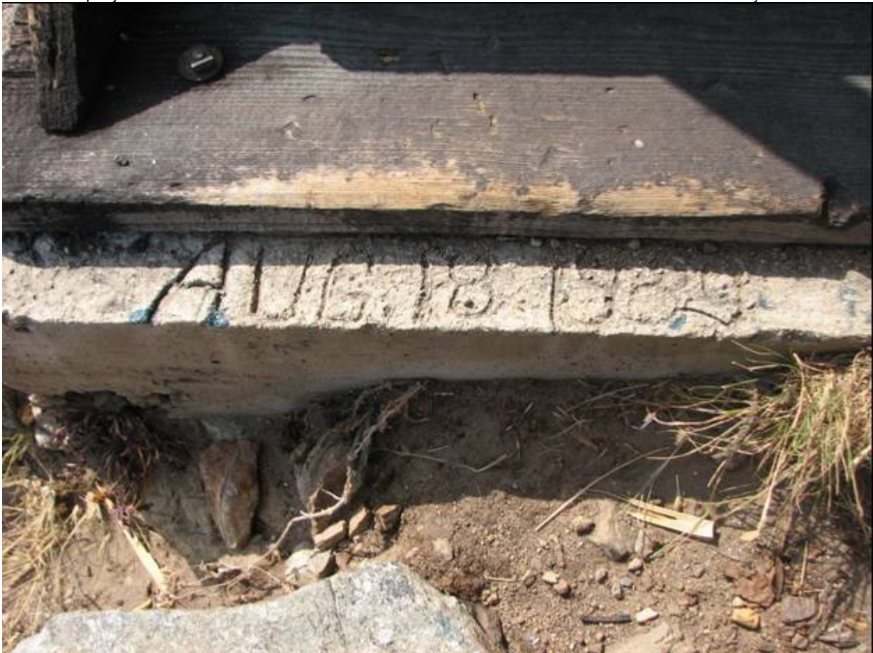
MT_RavalliCounty_GirdPointLookout_0004. Detail of the concrete footing for the stair etched with "Aug. 18 1939."

Ravalli County, Montana County and State