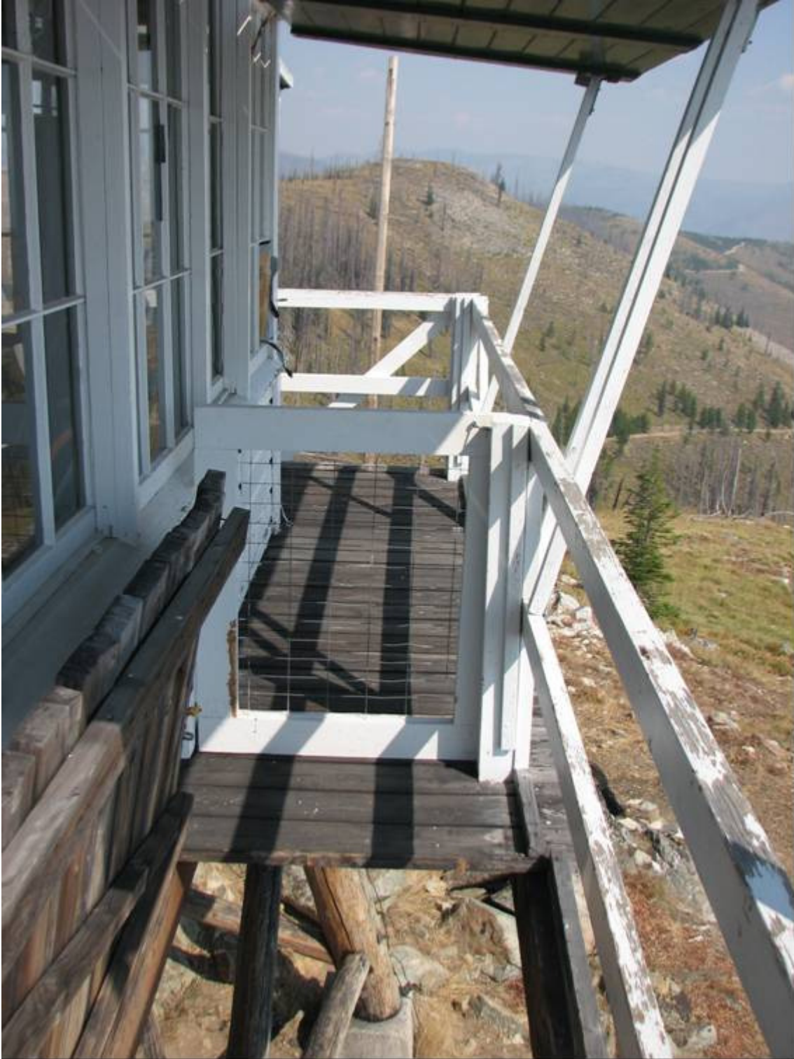
MT_RavalliCounty_GirdPointLookout_0006. Looking northeast to the spring-loaded safety gate at the edge of the trap door in the northeast side of the catwalk.

Ravalli County, Montana County and State