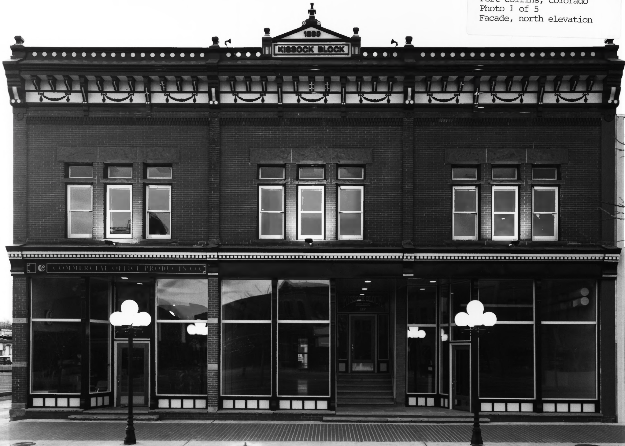
KISSOCK BLOCK BUILDING Fort Collins, Colorado Photo 1 of 5 Facade, north elevation