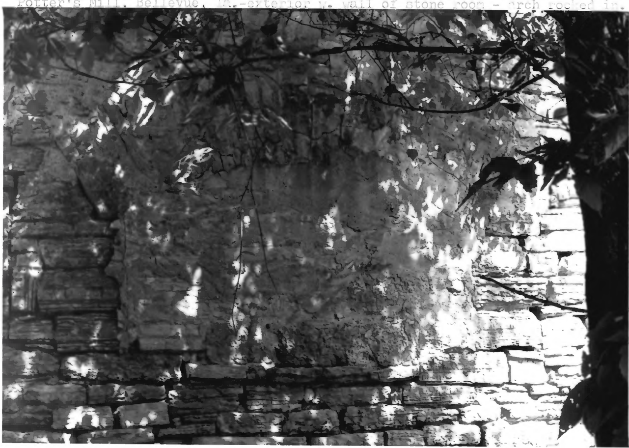
Potter's Mill, Beavercreek, MA.-exterior wall of stone room - arch rock'd in.