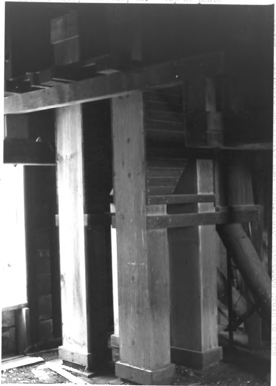
cupola-- elevators and chutes that distributed processed grain to bins