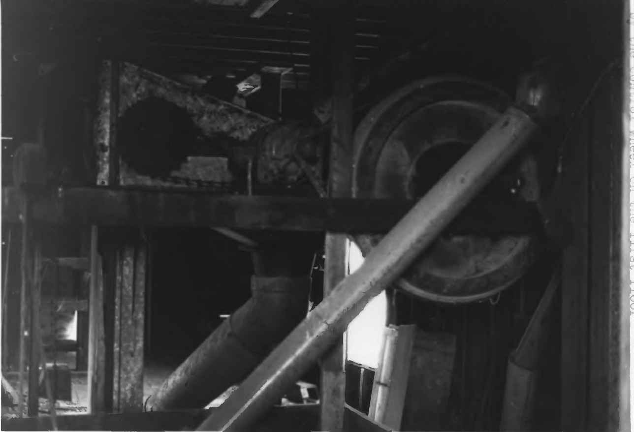
by the control wheel on the first floor