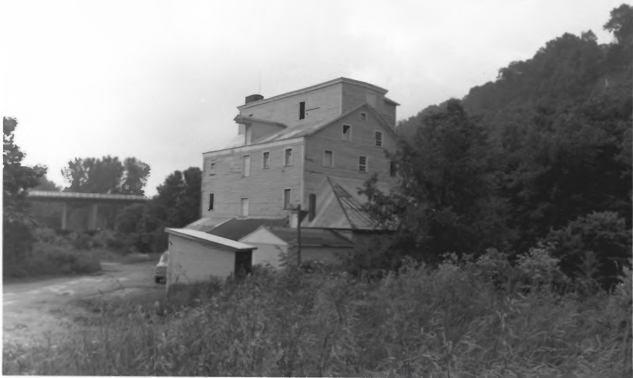
Potter's Mill, Bellevue, Iowa: Viewed from the Northwest