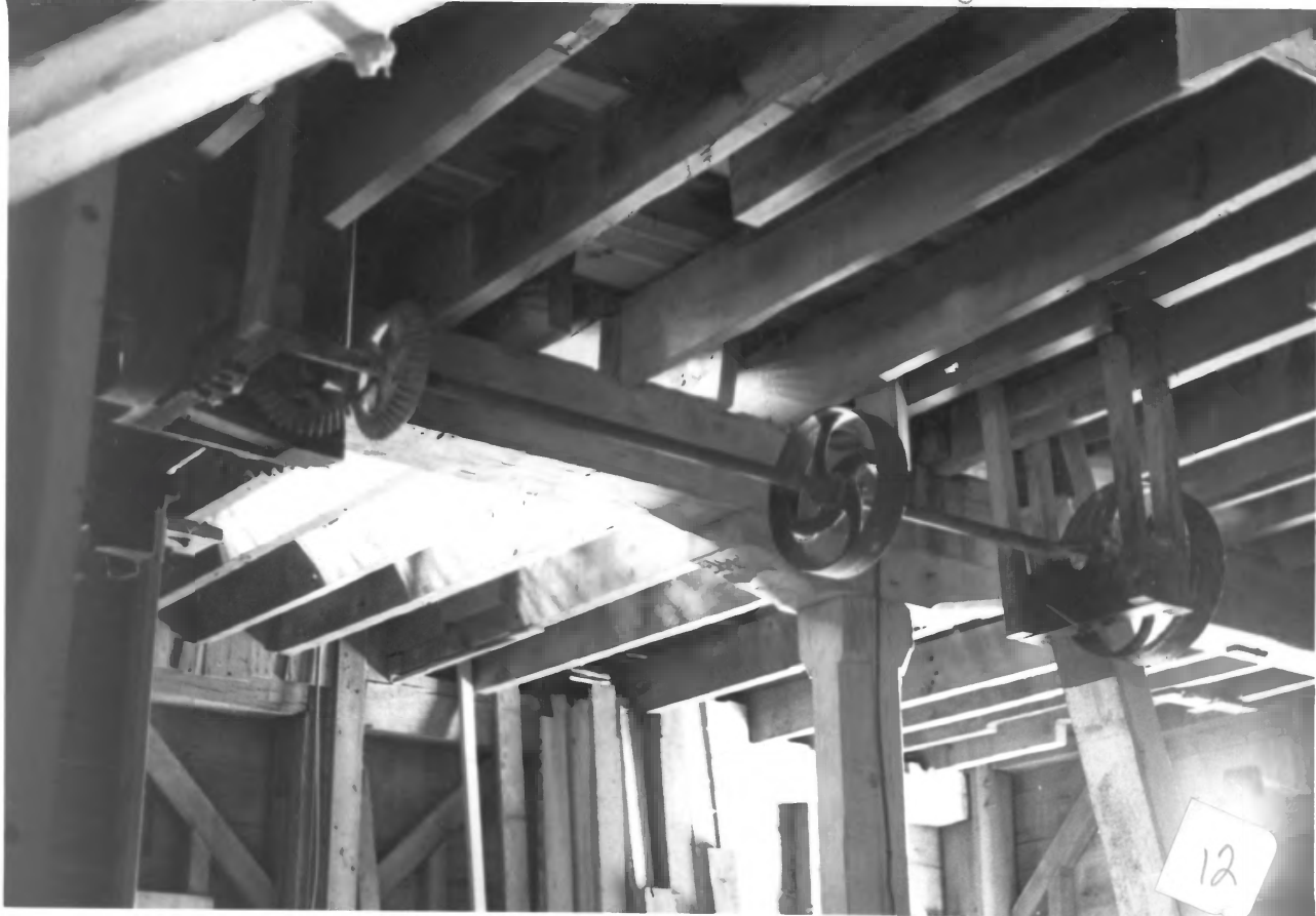
Dotter's Mill, Bellevue Ia. "Jack-shaft" beneath ceiling on second floor