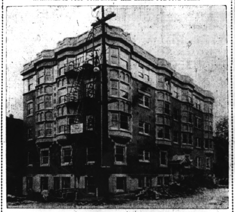
E. PITTLEKAU BUILDING AT PARK AND TAYLOR TO BE KNOWN AS THE WHEALDON.