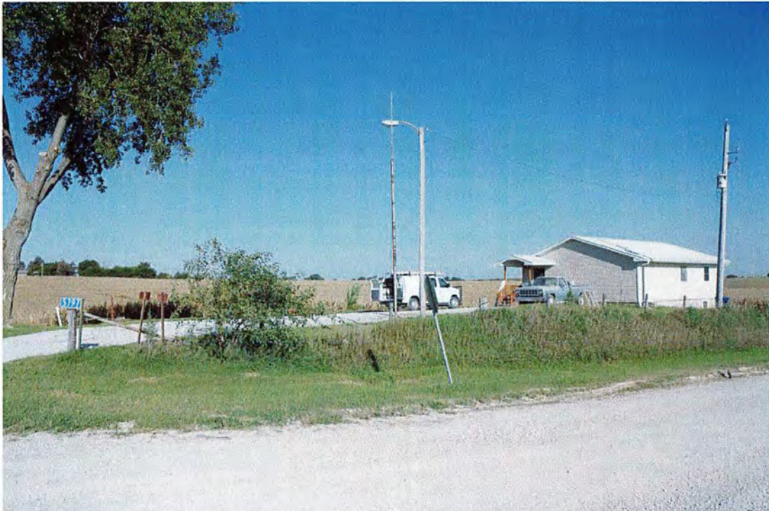
Image 1: View of noncontributing building remaining on former site of McCartney School; view northwest.