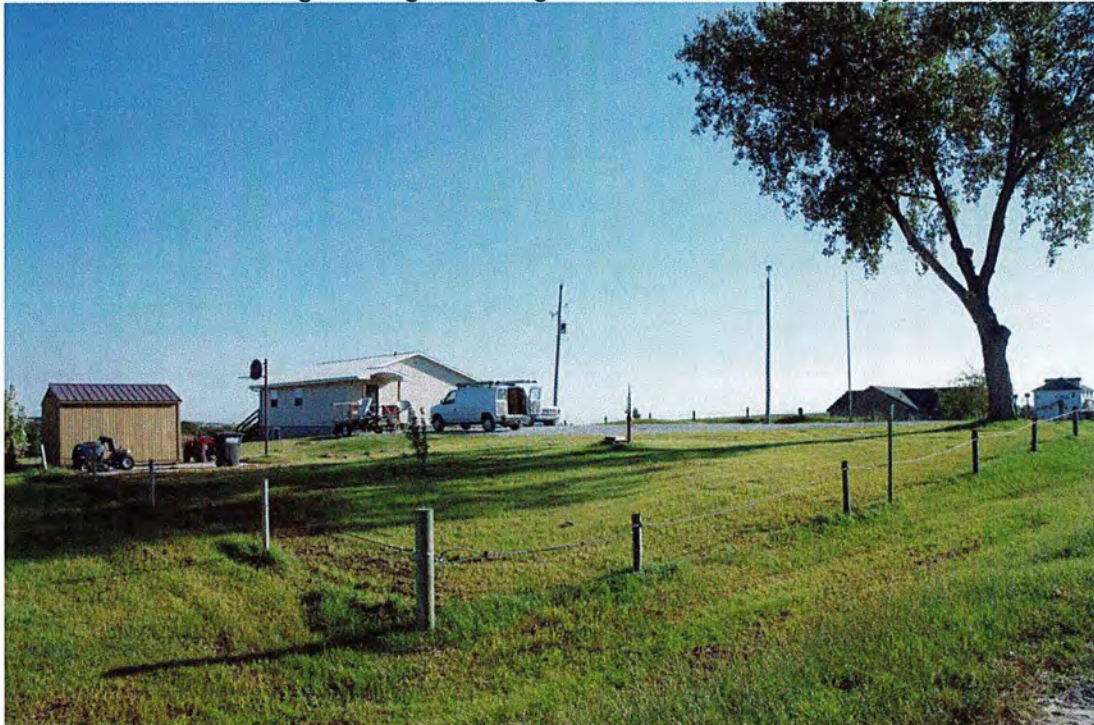
Image 2: View of noncontributing building remaining on former site of McCartney School; view northeast.