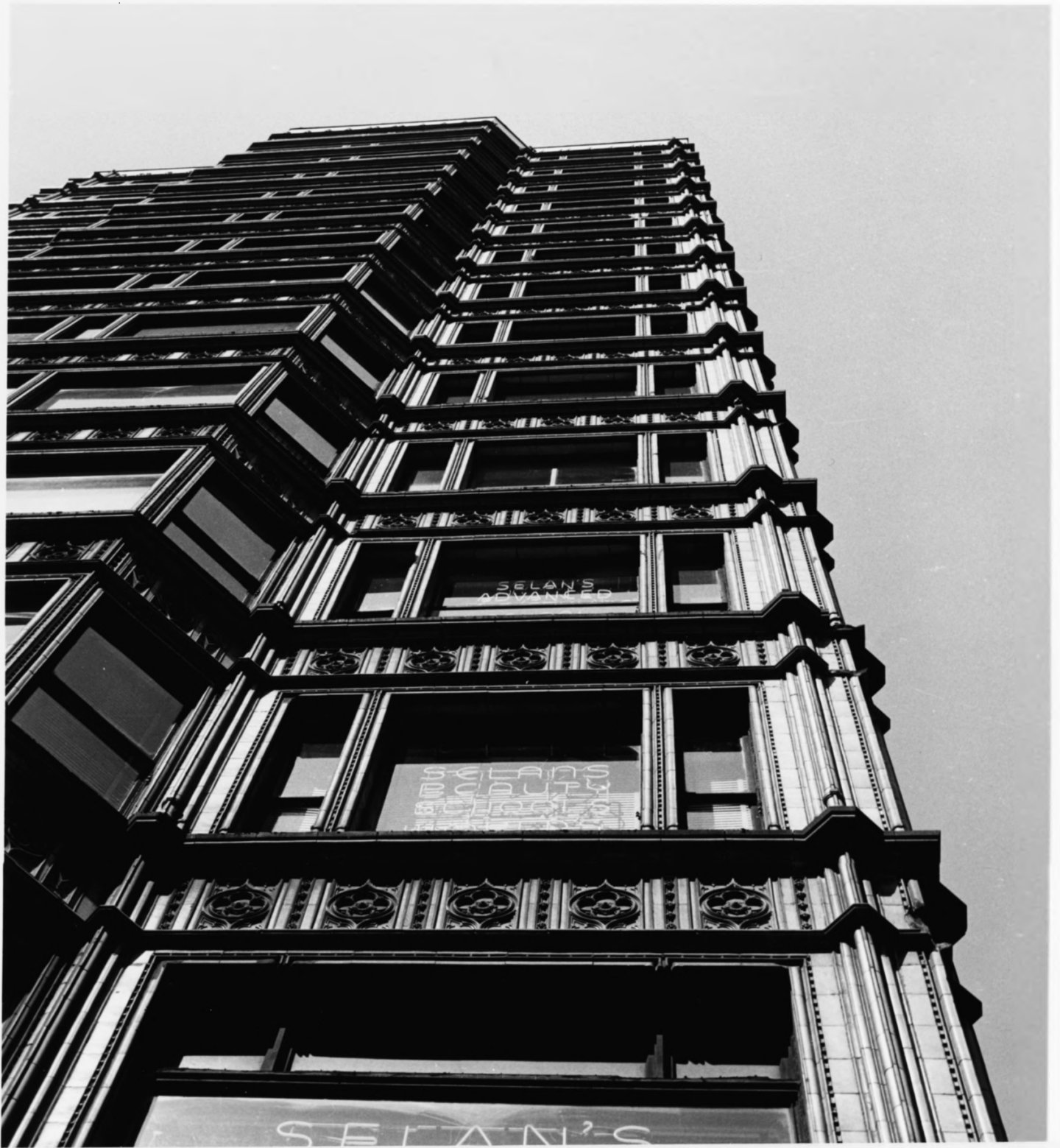
Reliance Building, Chicago, Illinois (Detail Facade) (East)