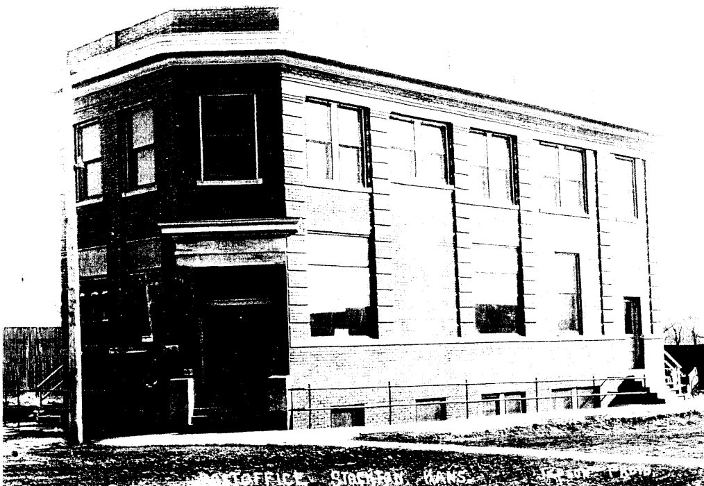
Rooks County Record Building, constructed 1911 as Post Office