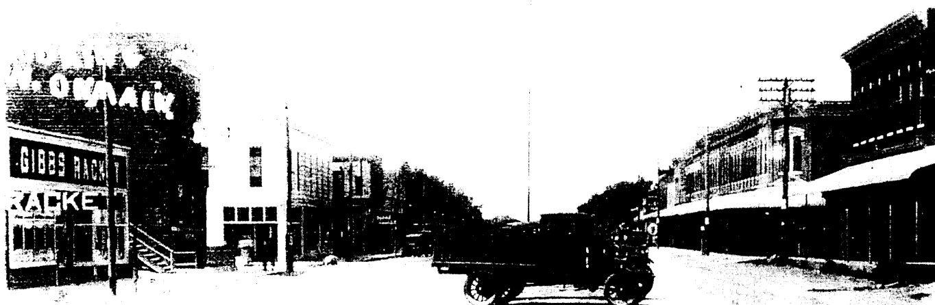
Looking West on Main Street, Stockton, 1925 – Record Building on left with Telephone Company sign on 2 nd floor.

Rooks County Record Building Stockton, Rooks County, Kansas