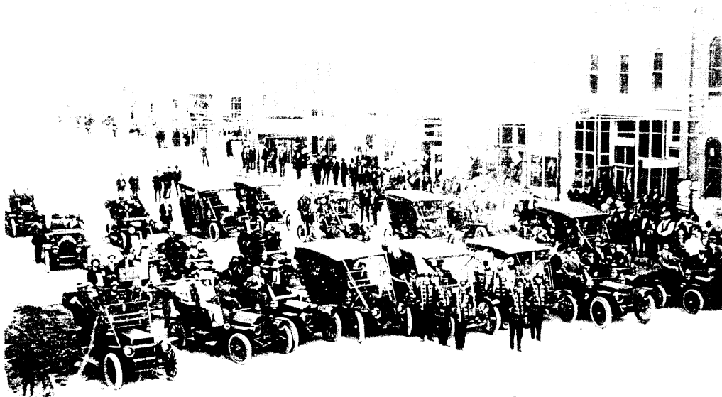
Woodman Day in downtown Stockton, 1910 - Record Office located on 2 nd floor over Abstract/Real Estate office on Main Street; Current Record Building Site (at end of block - far left) is location of bandstand.

Rooks County Record Building Stockton, Rooks County, Kansas