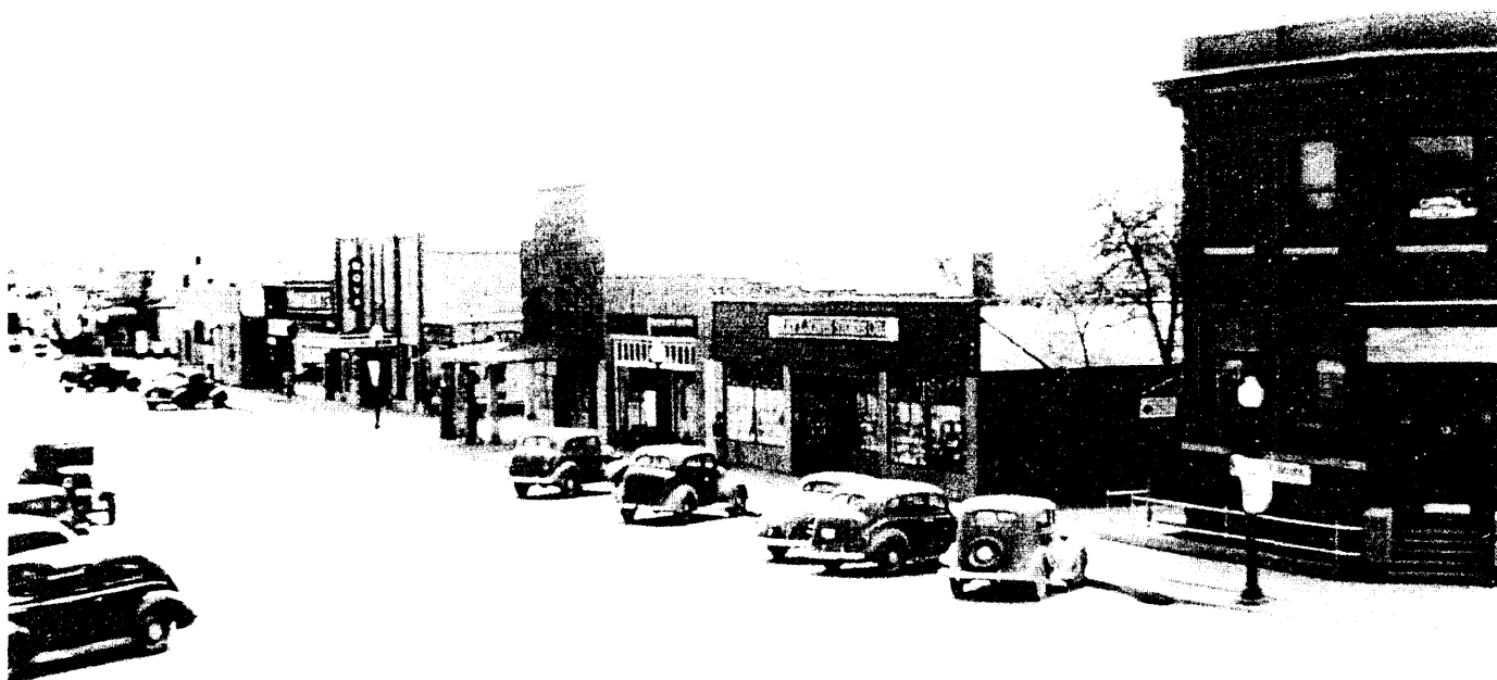
Looking East on Main Street, Record Building on right. Telephone Company has moved to ground floor, beauty shop on 2 nd floor, and The Record in the basement. (no date on photo, c.mid-1930s)