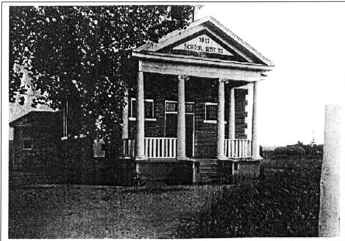
Date unknown. Notice balustrade on porch and hipped roof storage room on the left.