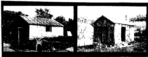
stone smokehouse and braced frame shed