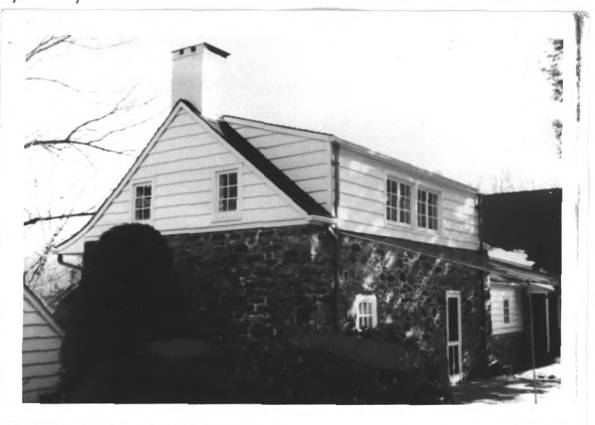
Southwest (rear) and west sides.