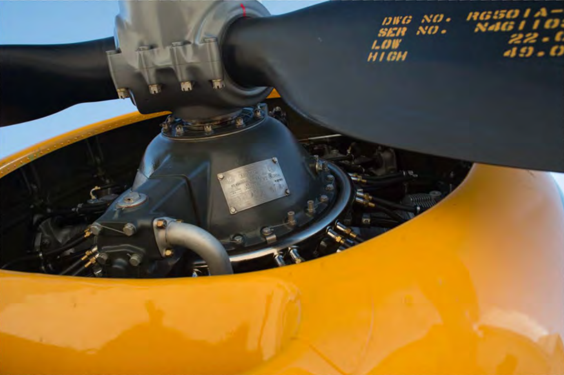
PLATE WITH SERIAL NUMBER AND IDENTIFICATION

DWG NO. R6501A- SER NO. N4G1103 LOW 22.0 HIGH 49.0