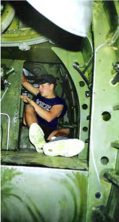
HP5. TBM N53503, interior of fuselage, undergoing safety inspection of structure, Grand Junction, Colorado, April, 2015, photograph by Kent Taylor.