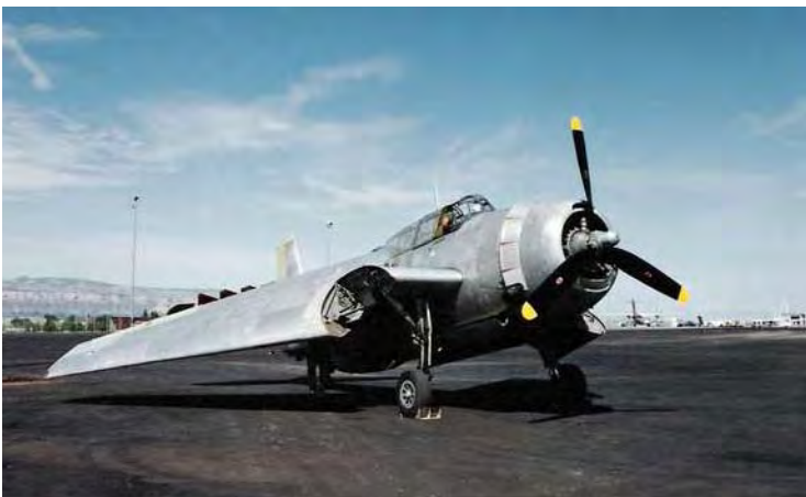
HP3. TBM N53503, aircraft exterior prior to restoration of exterior paint to World War II markings, Grand Junction,