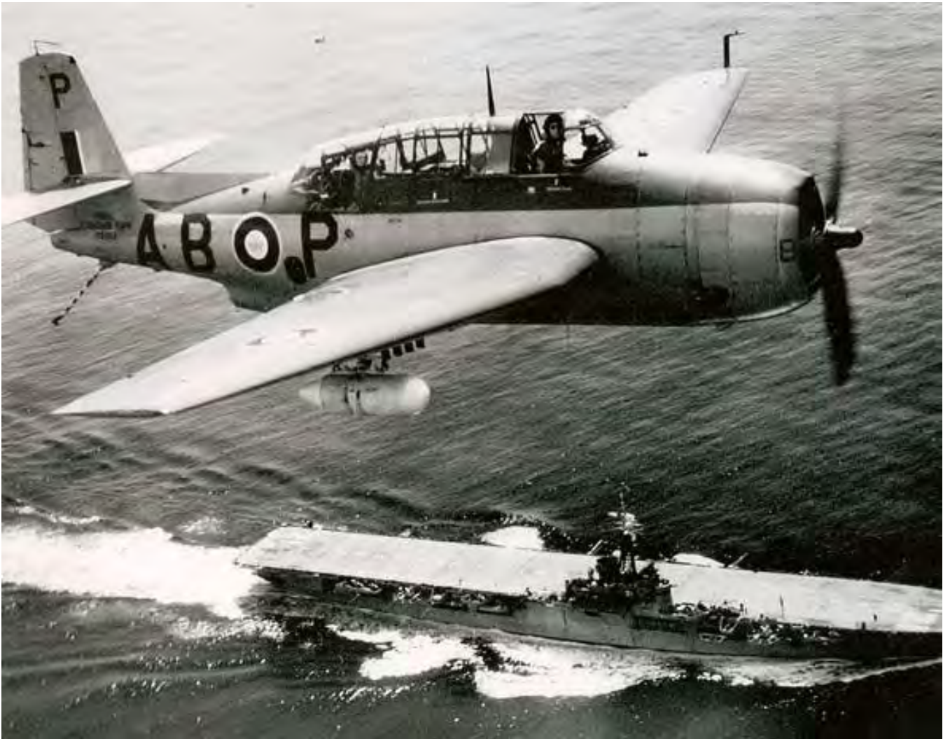
HP2. TBM N53503, flying over Her Majesty's Canadian Navy vessel HMCS Magnificent during Royal Fleet Review by newly coronated Queen Elizabeth, June 15, 1953.