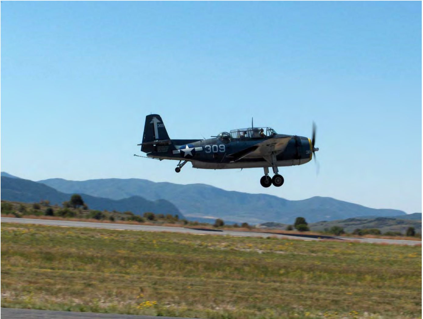
HP4. TBM N53503 taking off from Grand Junction Regional Airport, Grand Junction, Colorado, March, 2014

Colorado, 1989, photograph by Robert Duncan. Note wings in folded position.