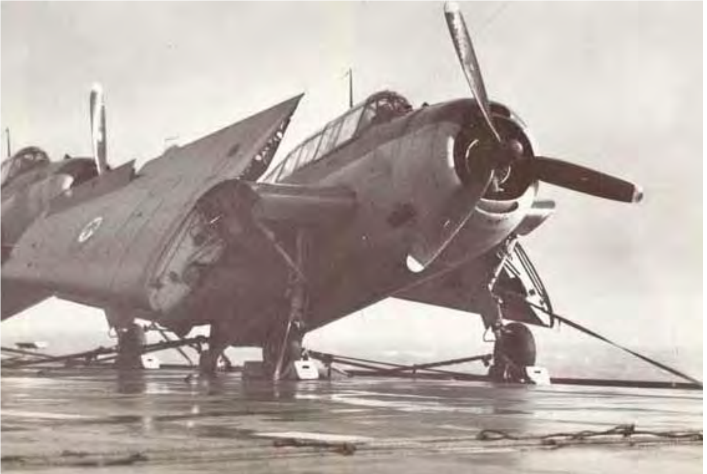
HP1. A TBM aboard aircraft carrier in 1945, photograph by United States Navy. Note wings in folded position. Original photo located in Still Picture Branch, (NNSP) records, Department of the Navy, Record Group 80, (RG80), National Archives of the United State, Washington, D.C.