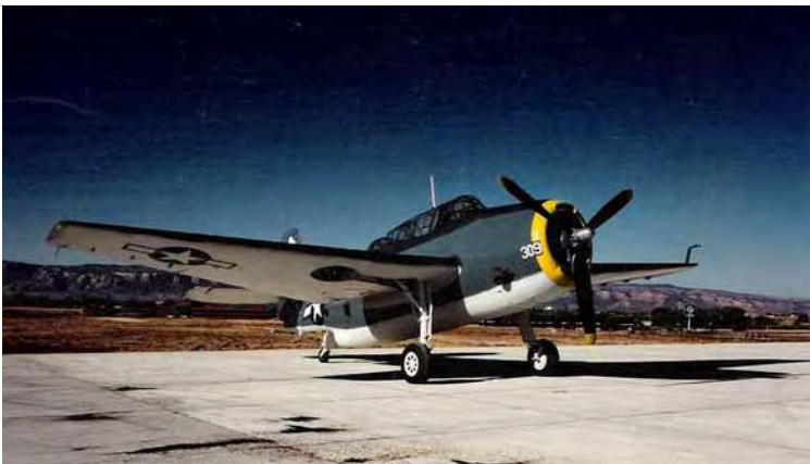
HP6. TBM N53503, after aircraft was painted to match World War II paint scheme of VT-84 squadron, assigned to U.S.S. Bunker Hill.

Paperwork Reduction Act Statement: This information is being collected for applications to the National Register of Historic Places to nominate properties for listing or determine eligibility for listing, to list properties, and to amend existing listings. Response to this request is required to obtain a benefit in accordance with the National Historic Preservation Act, as amended (16 U.S.C.460 et seq.).