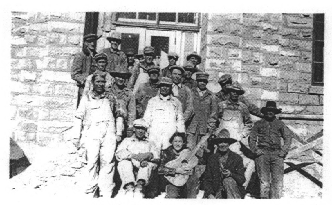
The WPA work crew, date unknown

Kim Schools Las Animas County, CO (New Deal Resources on Colorado's Eastern Plains MPS)