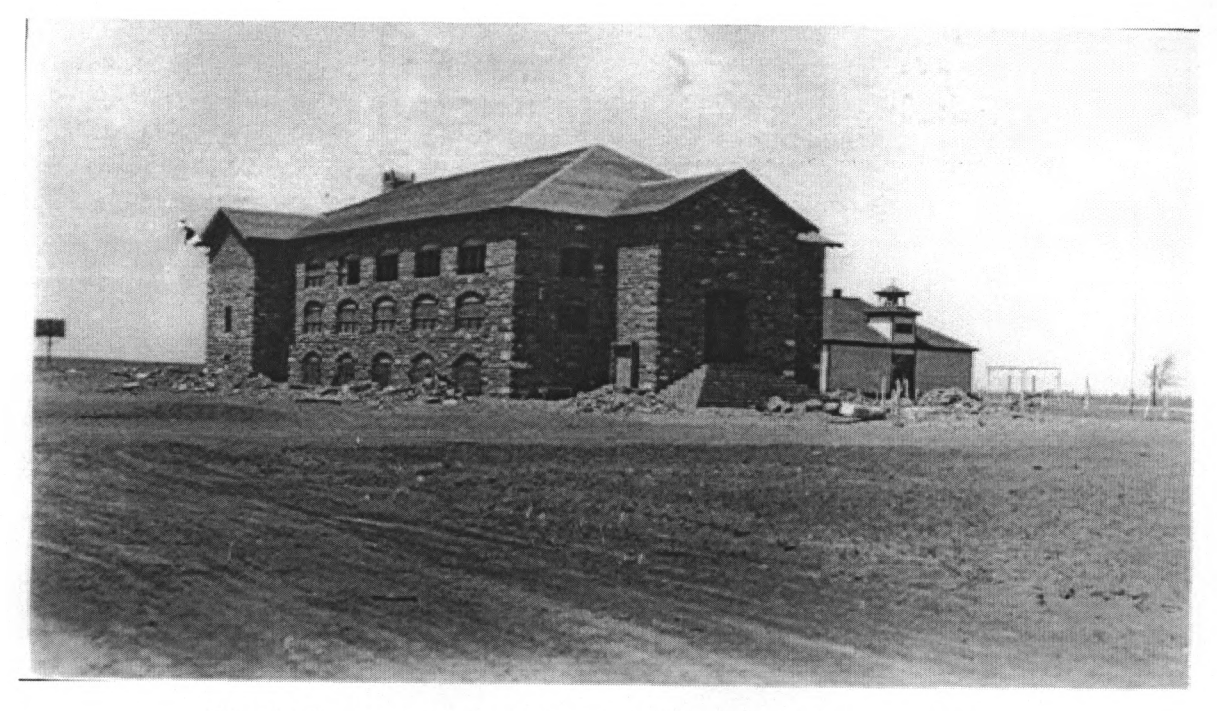
The 1935 yearbook included a photograph of the new gym.