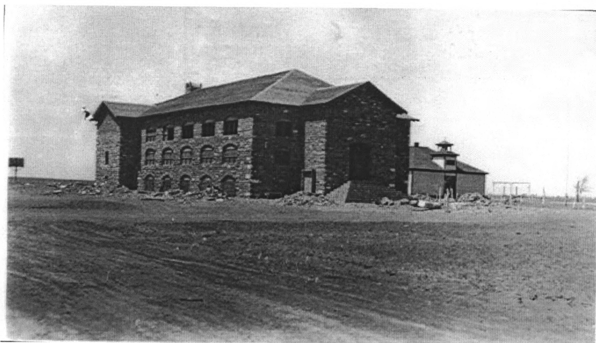
The 1935 yearbook included a photograph of the new gym.