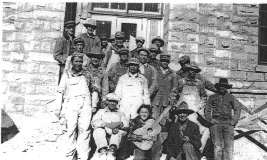
The WPA work crew, date unknown

(New Deal Resources on Colorado's Eastern Plains MPS)