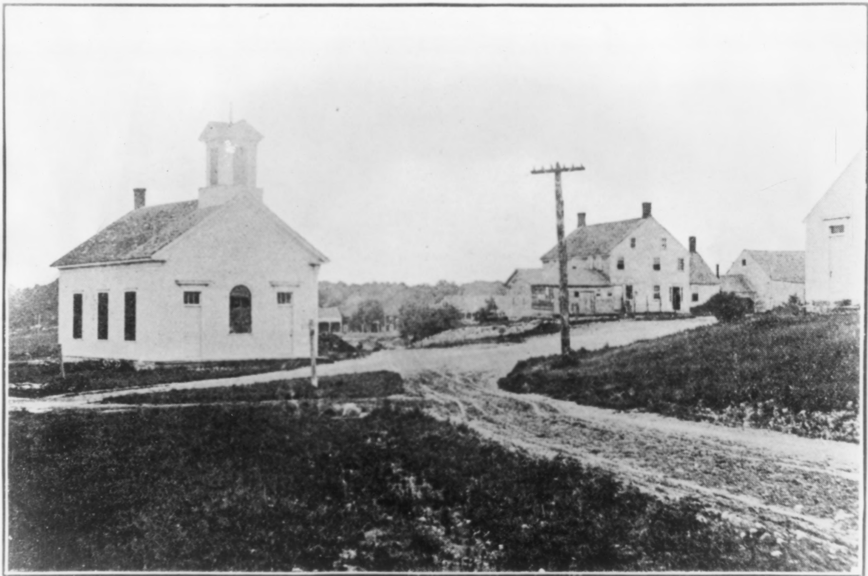
The Church and Store at Foster Centre