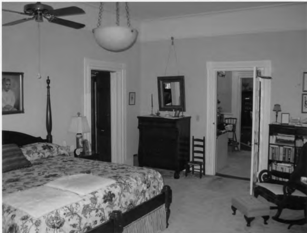
18. John Lawton House 118 Third Street, Estill Hampton County, S.C.

Rear Bedroom, Front Section, with Doors to Library and Center Room