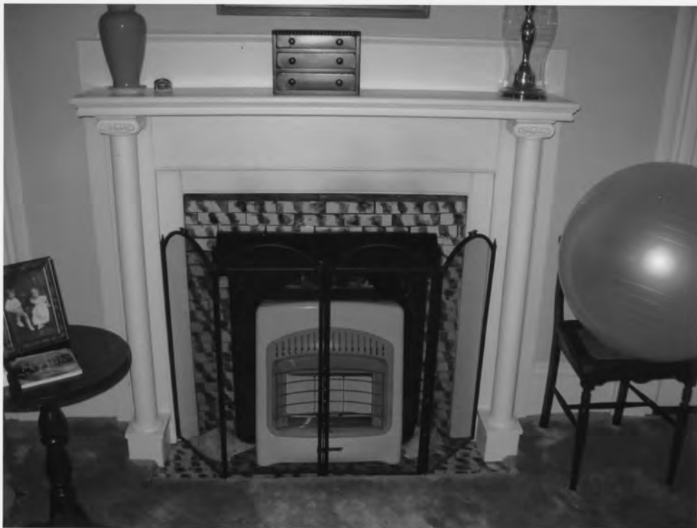
19. John Lawton House 118 Third Street, Estill Hampton County, S.C.

Hearth Detail, Rear Bedroom, Front Section