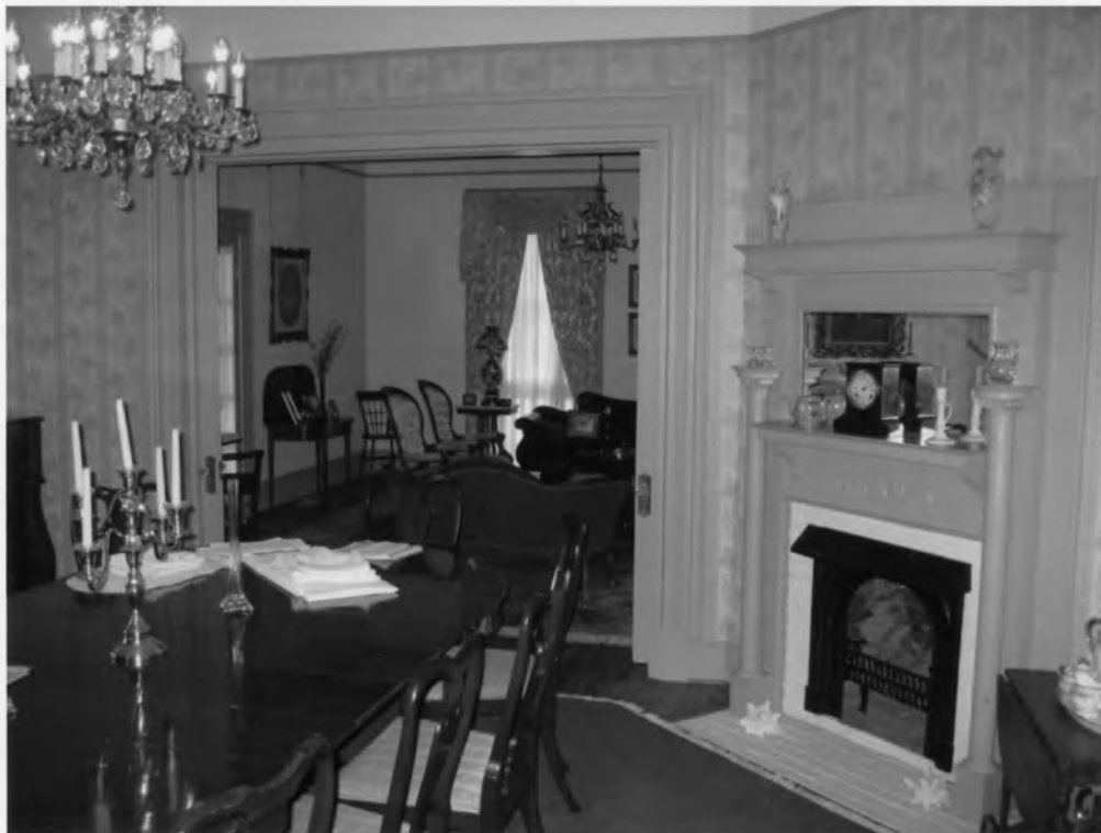
13. John Lawton House 118 Third Street, Estill Hampton County, S.C.

Dining Room, Looking Northwest Into Parlor