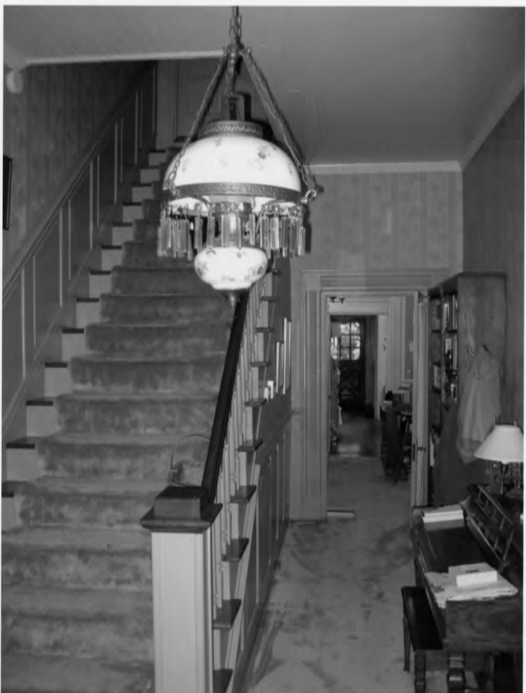
16. John Lawton House 118 Third Street, Estill Hampton County, S.C.