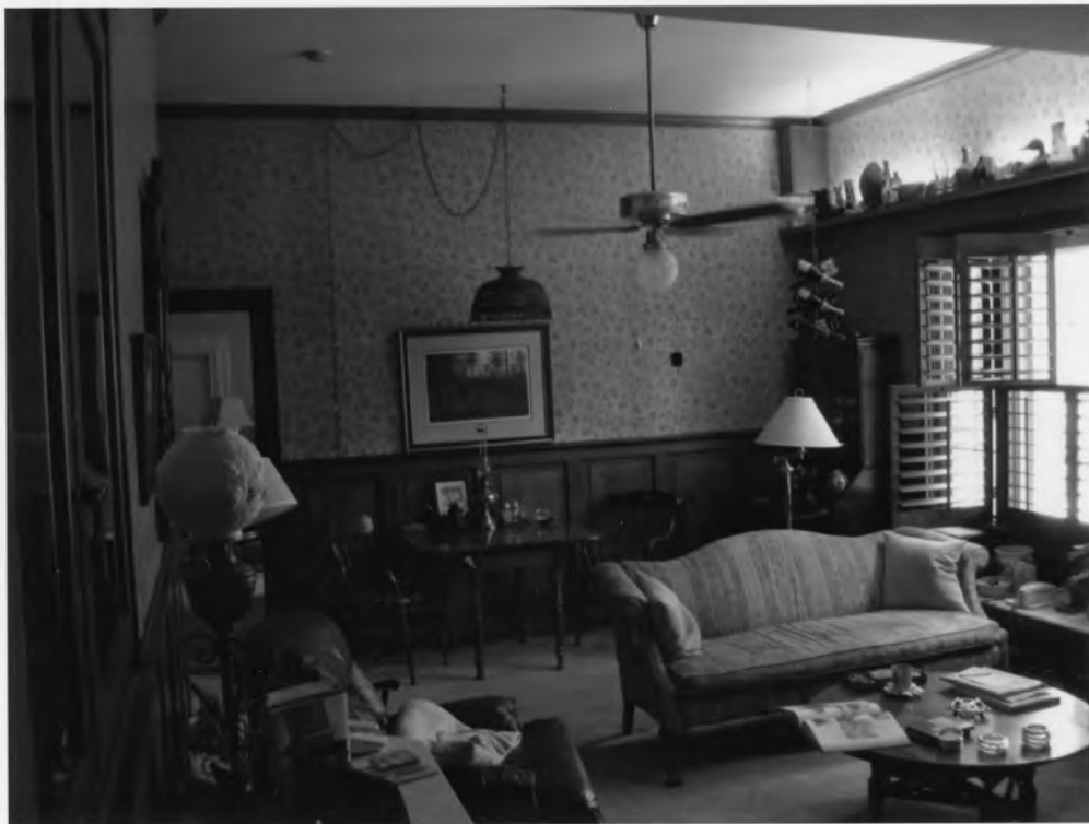
11. John Lawton House 118 Third Street, Estill Hampton County, S.C.