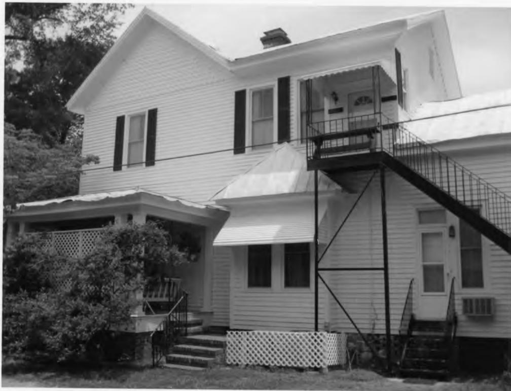
10. John Lawton House 118 Third Street, Estill Hampton County, S.C.

West Elevation, Front and Middle Sections