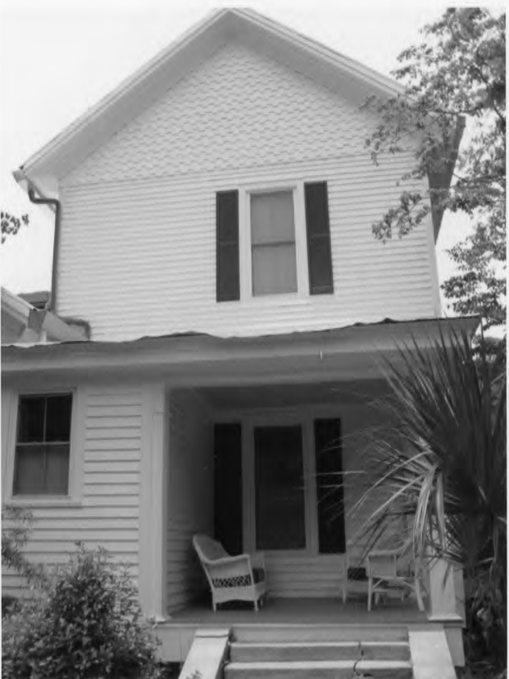
6. John Lawton House 118 Third Street, Estill Hampton County, S.C.

East Elevation, East Porch With Siding Detail