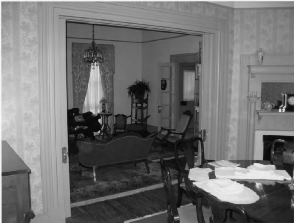
14. John Lawton House 118 Third Street, Estill Hampton County, S.C.

Dining Room, Pocket Doors to Parlor, Looking Northeast