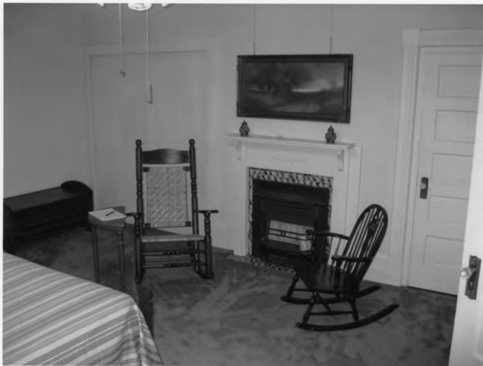
20. John Lawton House 118 Third Street, Estill Hampton County, S.C.