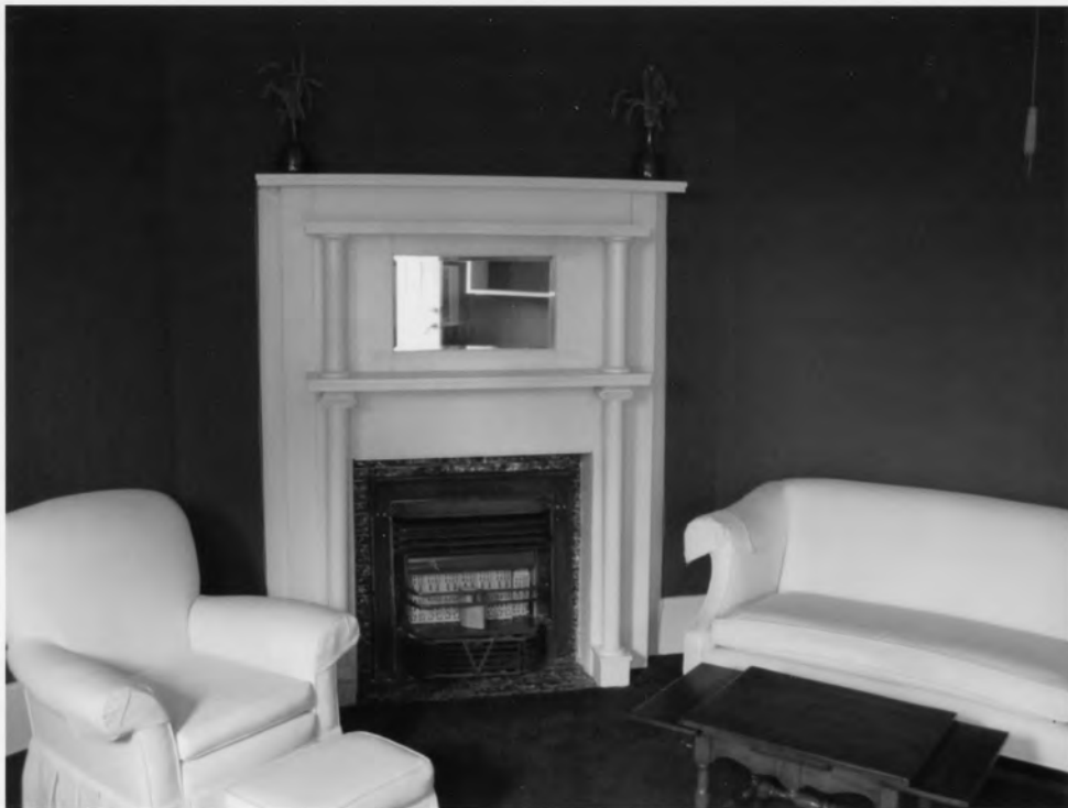
21. John Lawton House 118 Third Street, Estill Hampton County, S.C.