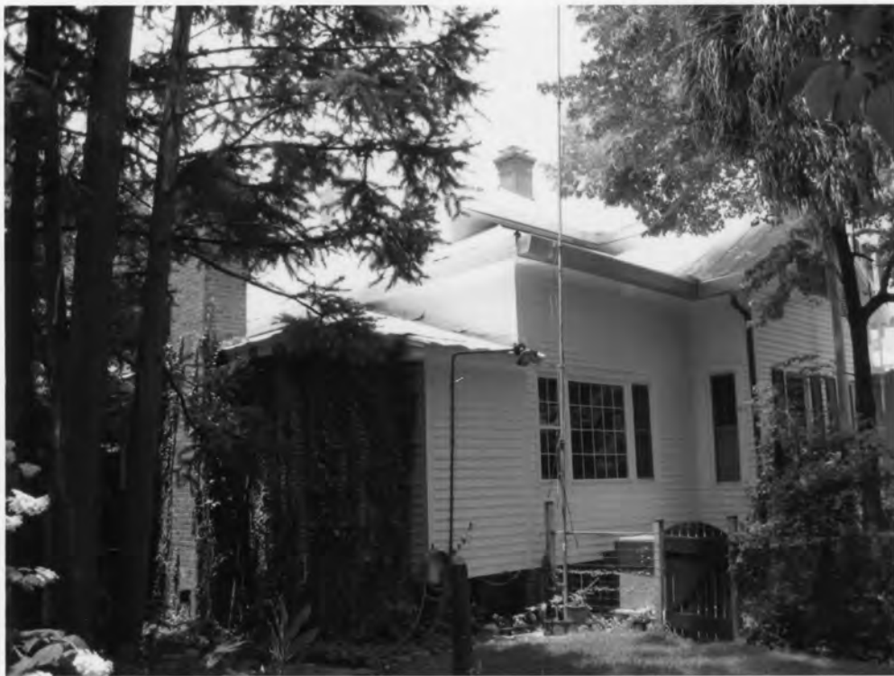
8. John Lawton House 118 Third Street, Estill Hampton County, S.C.

Southeast Oblique View with Roof Detail and East Elevation