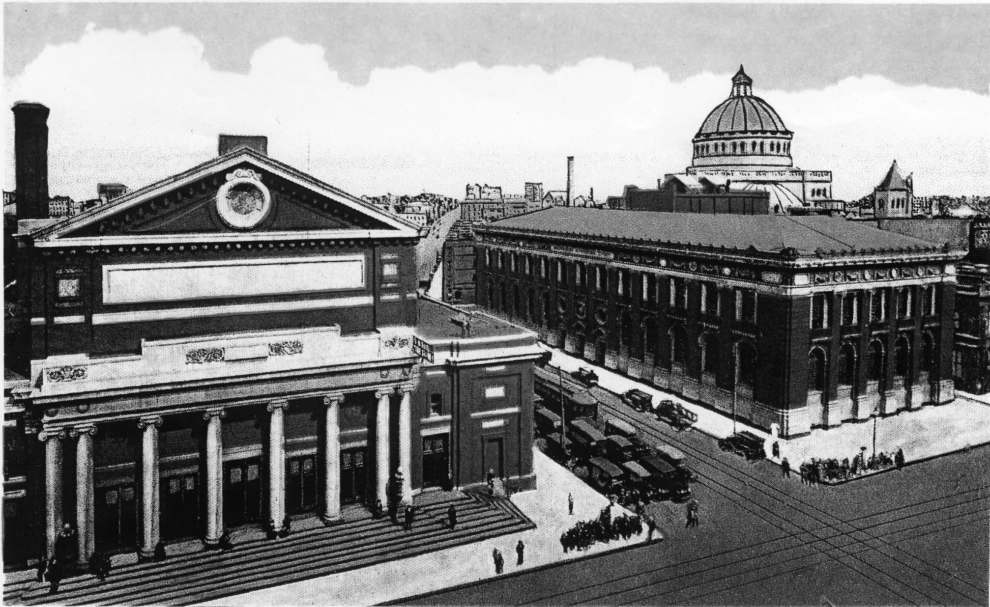
SYMPHONY HALL AND HORTICULTURAL HALL, MASSACHUSETTS AVENUE, BOSTON, MASS.