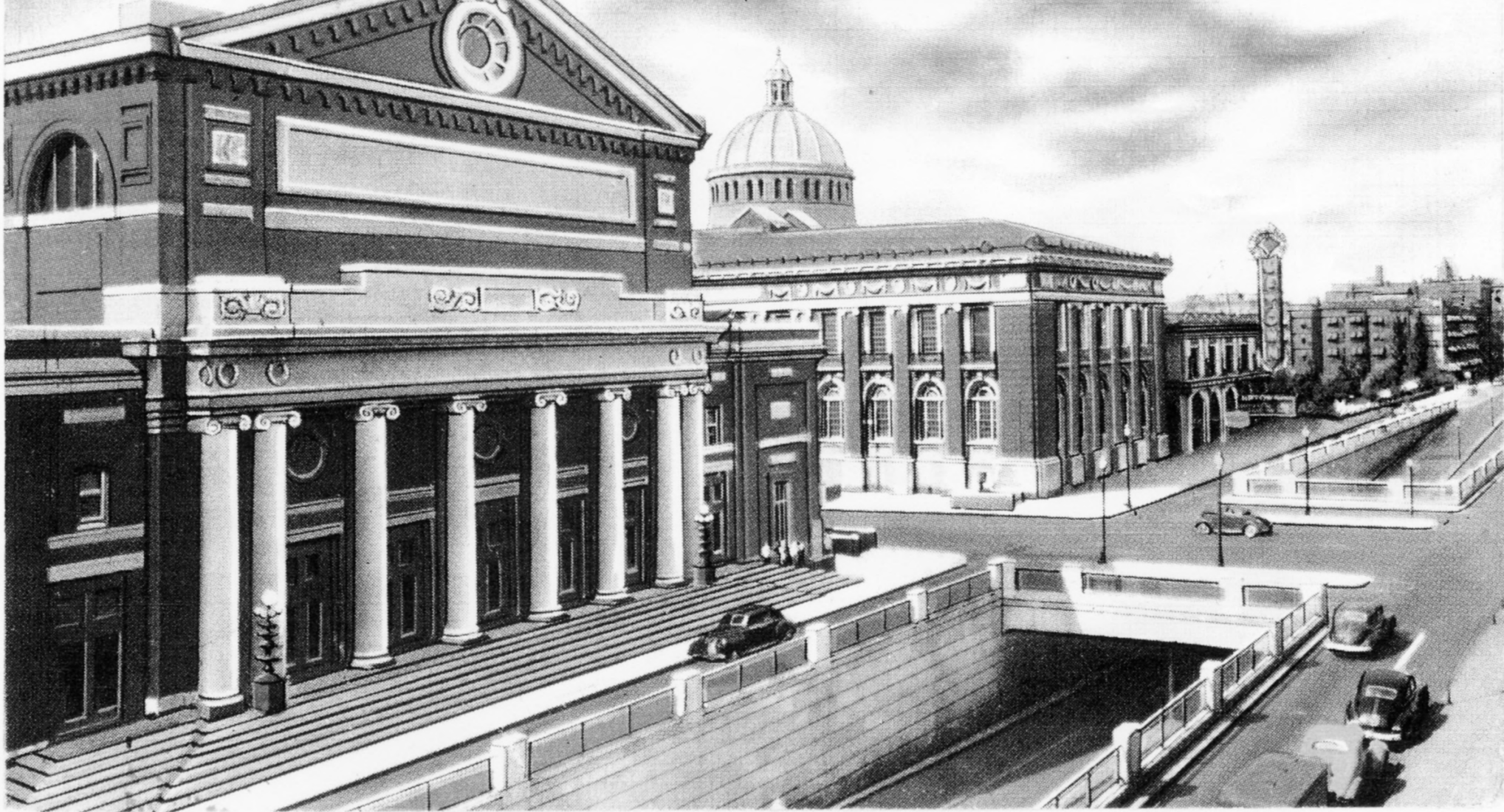
Huntington Avenue at Massachusetts Avenue Showing Symphony Hall, Horticultural Hall and Dome of Christian Science Church, Boston, Mass. B-18