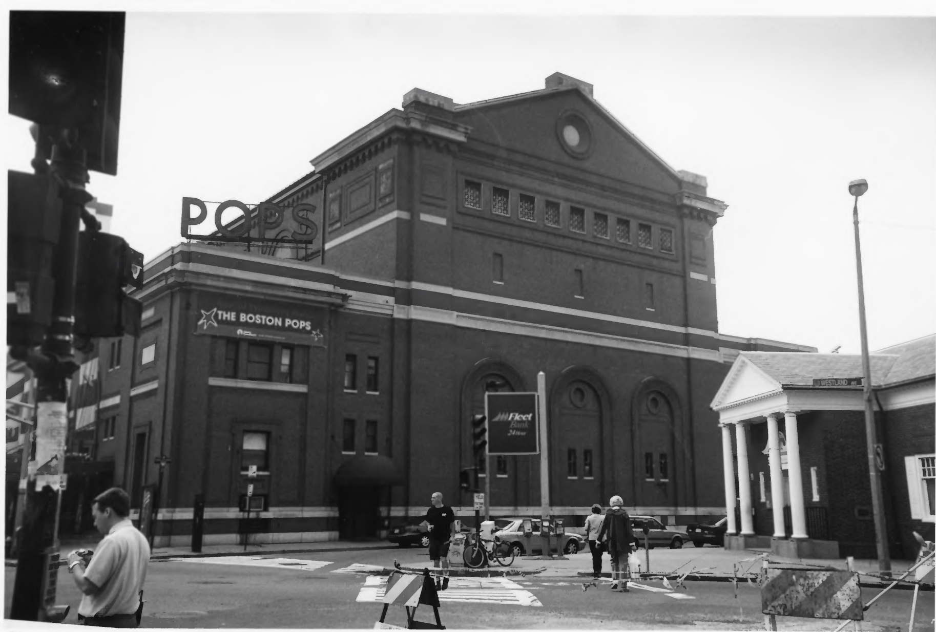
Photo #1 Boston Symphony Hall Boston, Massachusetts St. Stephen Street elevation