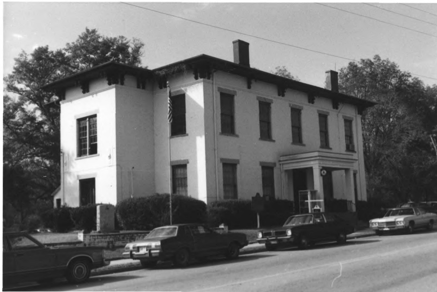
COLUMBIA COUNTY COURTHOUSE

Appling is a very small community; the courthouse is by far the most interesting building. It is a threatened building for it is too small for county needs; only the county commissioners, the registrar and the tax assessors' offices remain in the building. It is one of a half dozen 1850 courthouses remaining in Georgia and its simplicity, yet sophistication make it a significant structure.