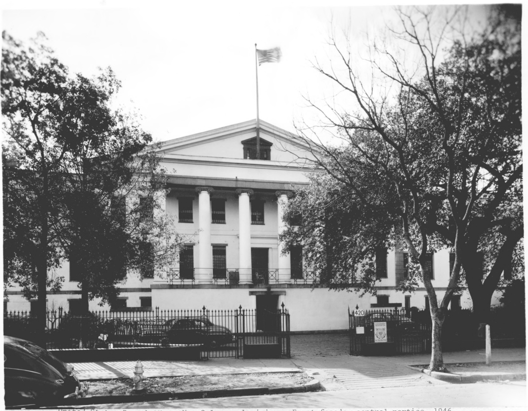
United States Branch Mint, New Orleans, Louisiana. Front facade, central portico, 1946.