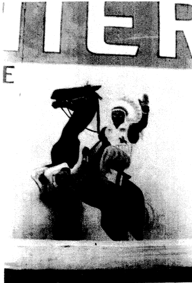
Figure 8-5: Touching up the paintings on the main façade, ca. 1960

Bowlin's Old Crater Trading Post Vic. of Bluewater, Cibola County, New Mexico