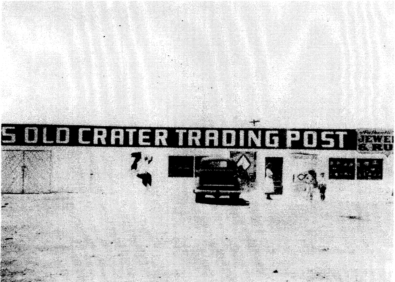
Figure 8-3: Bowlin's Old Crater Trading Post in 1954 following the construction of the new building

Bowlin's Old Crater Trading Post Vic. of Bluewater, Cibola County, New Mexico