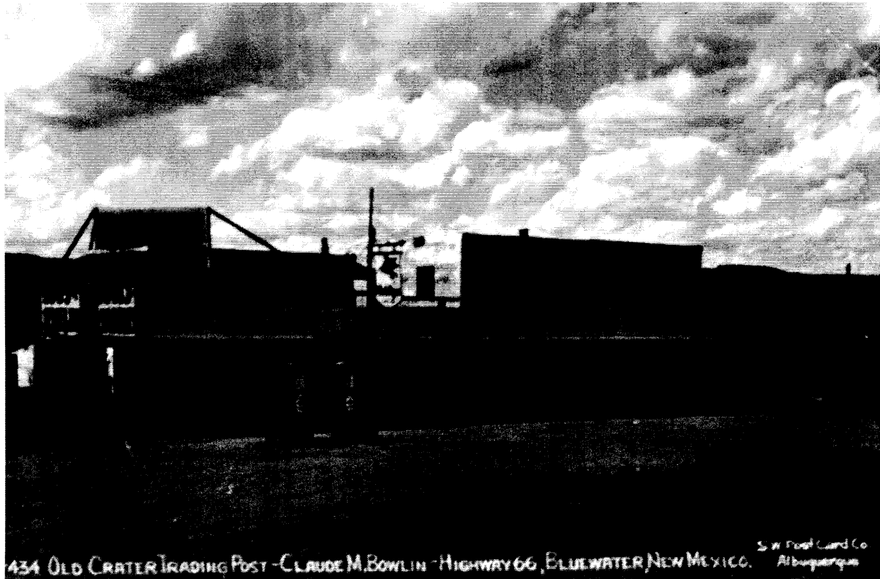
Figure 8-2: Original Old Crater Trading Post, ca. 1940

Bowlin's Old Crater Trading Post Vic. of Bluewater, Cibola County, New Mexico