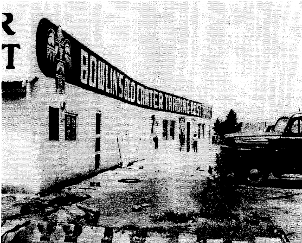
Figure 8-4: Bowlin's Old Crater Trading Post, ca. 1955

Bowlin's Old Crater Trading Post Vic. of Bluewater, Cibola County, New Mexico