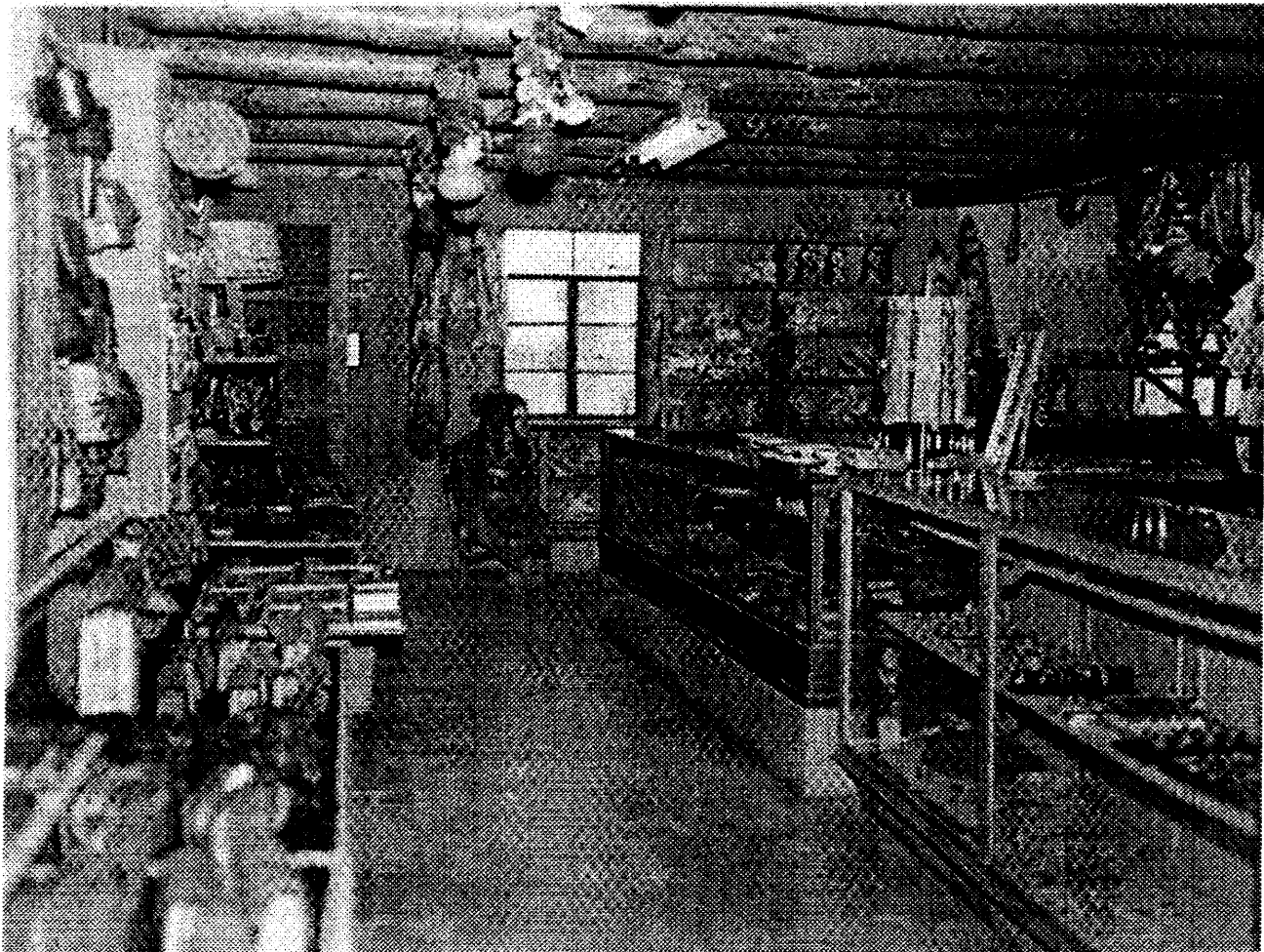
Figure 8-6: Photograph taken in August of 1962 of the interior of the Thunderbird (Bowlin's Old Crater Trading Post), (Courtesy New Mexico Archives and Record Center)

Bowlin's Old Crater Trading Post Vic. of Bluewater, Cibola County, New Mexico