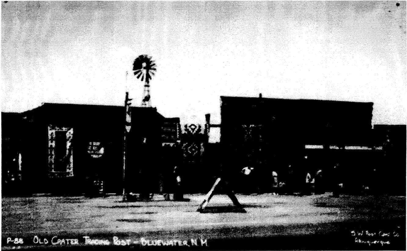
Figure 8-1: Original Old Crater Trading Post, ca. 1940

Bowlin's Old Crater Trading Post Vic. of Bluewater, Cibola County, New Mexico