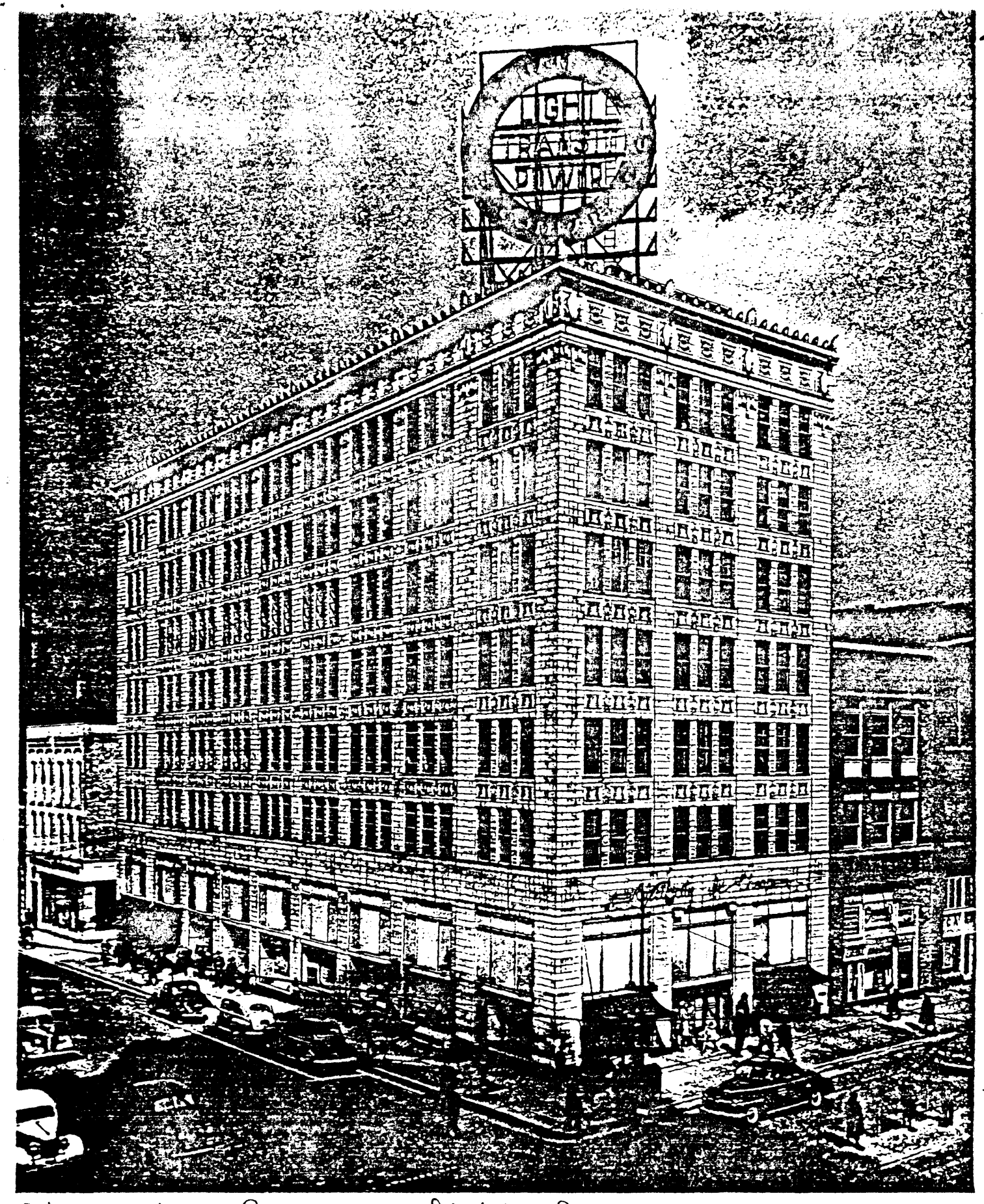
Birmingham Railway, Light & Power (now Collateral Insurance agency Building) N.E. Corner 1st are. + 21st 5t. No.