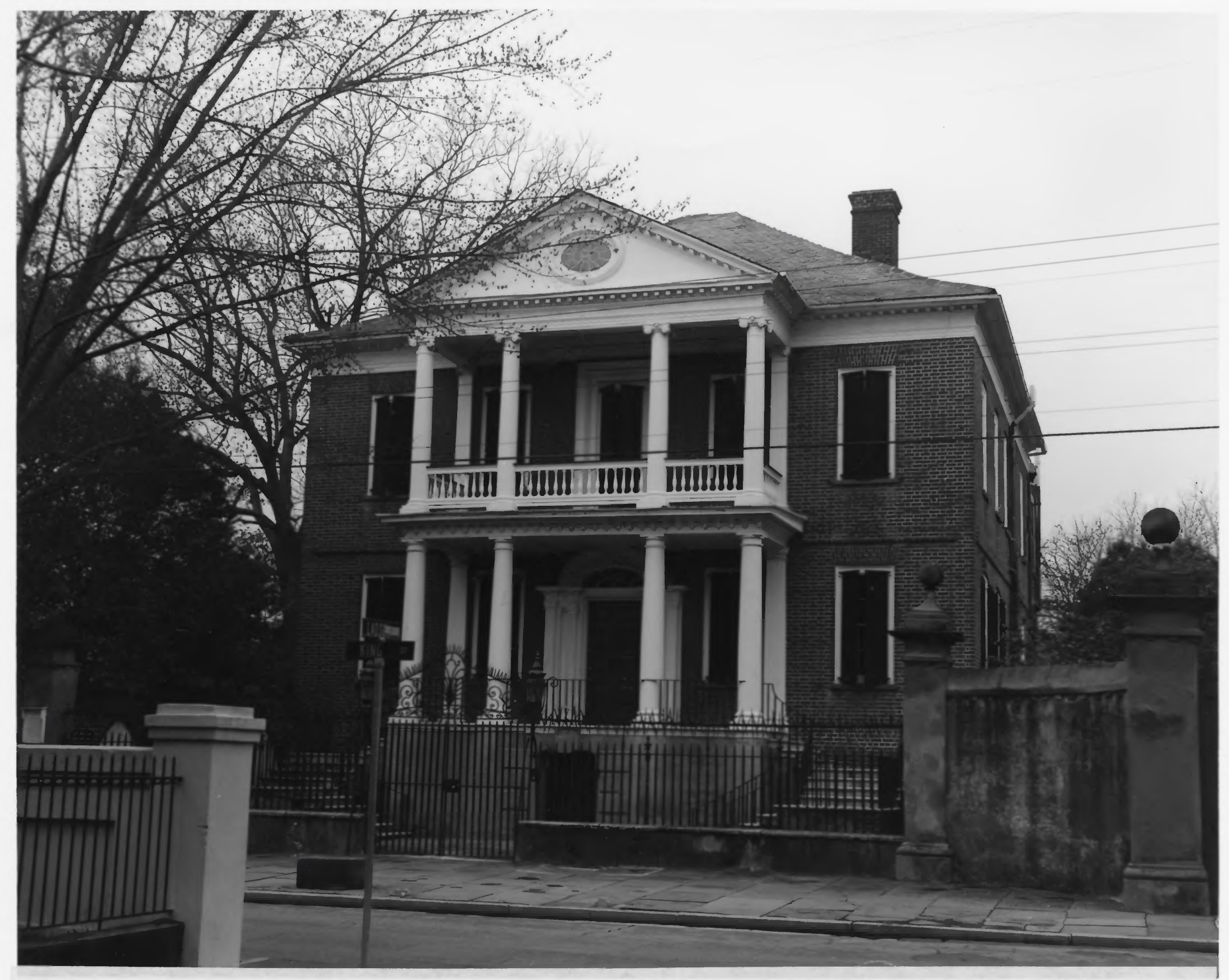
Miles Brewton House, Charleston, South Carolina